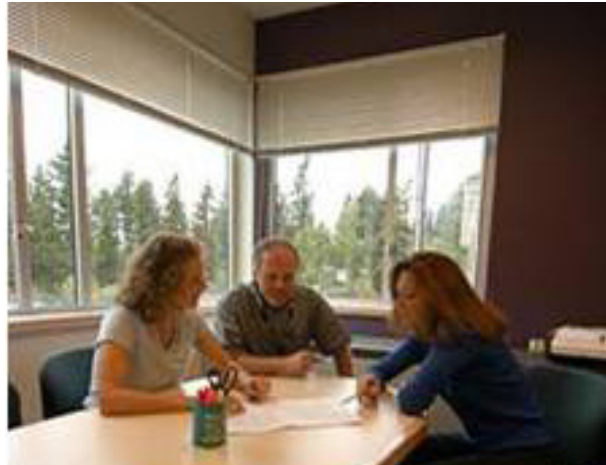
▶ Conference Room: Todd Beamer High School, Concordia Architects, Seattle, WA

At middle and high schools this room is to be used by students to research career opportunities.