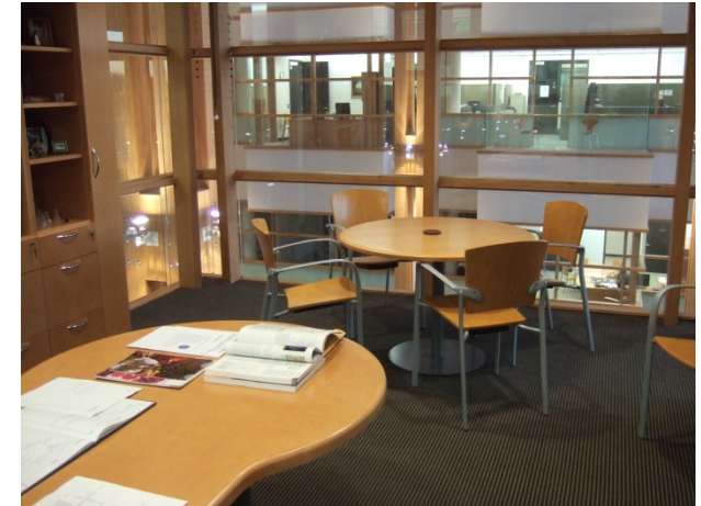
▶ Conference Room: Hudson Alpha Institute for Biotechnology, Cooper-Carry Architects, Huntsville, AL

NOTE: Images shown are intended to provide real-world examples and spark design creativity.