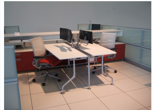
► Clerical Work Area, Open Office: Steelcase "University," Steelcase, Grand Rapids, MI

NOTE: Images shown are intended to provide real-world examples and spark design creativity.