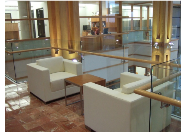
► Waiting Area: Hudson Alpha Institute for Biotechnology, Cooper-Carry Architects, Huntsville, AL

The mail room will provide mail slots for distribution of correspondence to school staff. This is not a space for receiving, screening or sorting bulk mail—that occurs at another location on the military installation prior to delivery to the school. Provide access to the mail room from the administration offices and from the corridor.