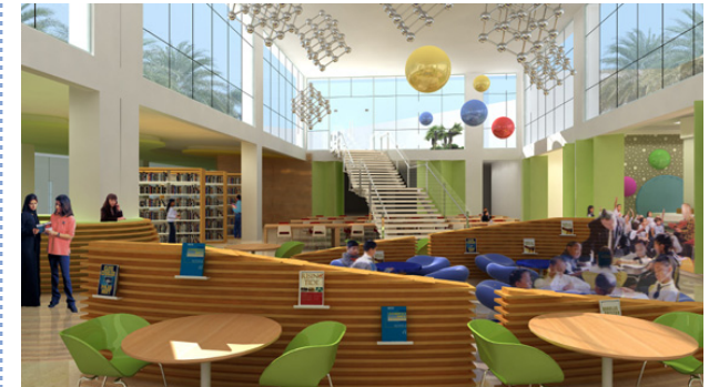
► Elementary School Information Center: GEMS World School, CPG Consultants Pte Ltd, Dubai, United Arab Emirates

This area provides space for the educational technologist. The educational technologist assists teachers with implementation of the technology portion of the curriculum. This office should be located near the flex lab that is provided in conjunction with the information center.