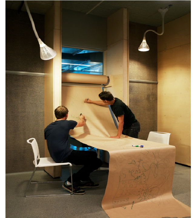
► Art Classroom: The Academy , BVN Architecture, Melbourne, Victoria, Australia

Provide a paved exterior space adjacent to the art room to function as an extension of the art room. This space should be large enough for the entire class to work individually or in groups.