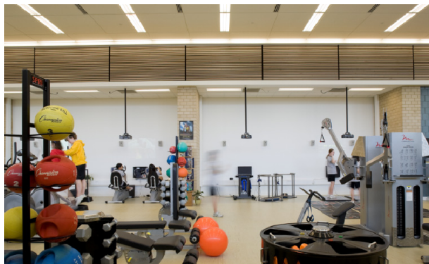
▶ Adlai E. Stevenson High School, Cannon Design, Grand Rapids, MI