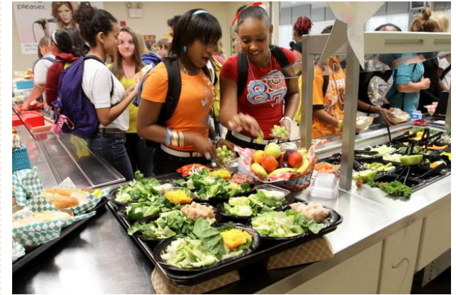
▶ Markham Woods Middle School, Lake Mary, Florida