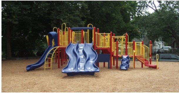
▶ Burton Elementary and Middle School, Progressive Architects, Grand Rapids, MI

The gymnasium, outdoor play lots, and playgrounds provide the customary opportunity for physical activity for students at school. A gymnasium with a full-size basketball court can provide movable seating with sufficient capacity for the entire student body. Space for professional development for coaches is also provided. Some schools include a fitness center to supplement the traditional opportunities for the students' physical development.