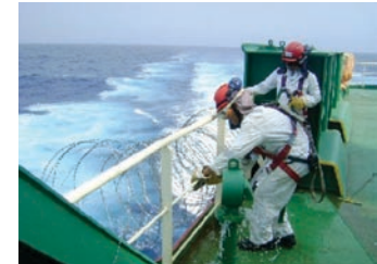
Ship protection measures in action