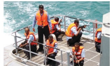
Yemen Coast Guard training exercise