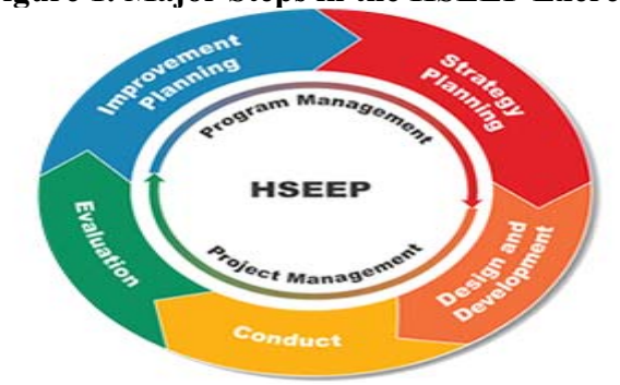
Figure 1. Major Steps in the HSEEP Exercise Cycle

The Homeland Security Exercise and Evaluation Program (HSEEP) is a capabilities and performance-based exercise program. The intent of HSEEP is to provide common exercise policy and program guidance capable of constituting a standard methodology for all exercises. HSEEP includes consistent terminology and tools that can be used by all exercise planners, regardless of the nature and composition of their sponsoring agency or organization. NLE 2011 followed HSEEP guidance<sup>1</sup> to ensure that all participants, from the federal, state, and local levels to the private sector, were using a consistent framework for conducting and evaluating the exercise. Figure 1 shows the HSEEP cycle of planning, executing, and evaluating exercises.