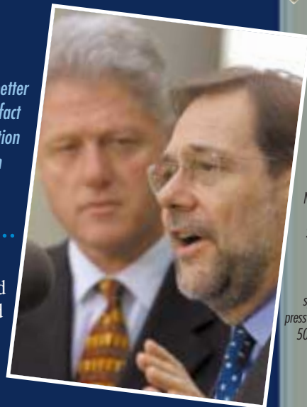
NATO Secretary General Javier Solana (right), alongside US President Bill Clinton, speaking to the press during NATO's 50th Anniversary Summit in Washington last April.

At the same time, the Alliance is continuing to advance significantly our project of adapting NATO for the 21st century.