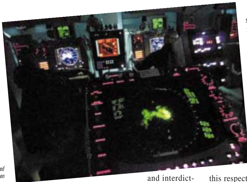
A storm over Kosovo is viewed on a radar screen in the Combat Information Center aboard the USS Gonzales in the Adriatic Sea.

and interdicting the VJ/MUP forces inside and around Kosovo, and preventing a continuation of their aggression, or its intensification. At the same time, the Allied campaign pursued an array of strategic target sets. These included logistics forces outside Kosovo with the ability to reinforce or support forces in Kosovo, the integrated air defence system, higher-level command and control, petroleum storage facilities and other targets that feed Serbia's military and security machine.