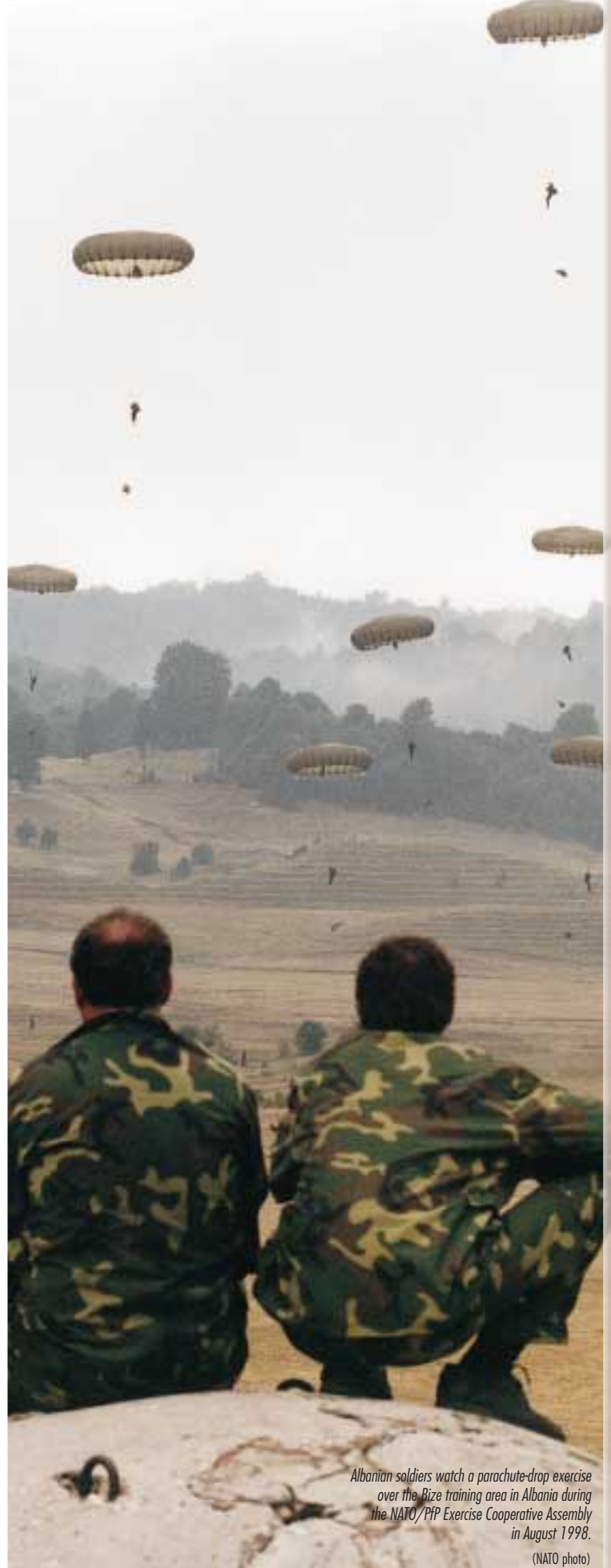
Albanian soldiers watch a parachute-drop exercise over the Bize training area in Albania during the NATO/PfP Exercise Cooperative Assembly in August 1998.

PfP has also proved to be a valuable and flexible tool for crisis management. Tailored assistance programmes with Albania, put in place after the internal crisis of 1997, have helped rebuild the Albanian armed