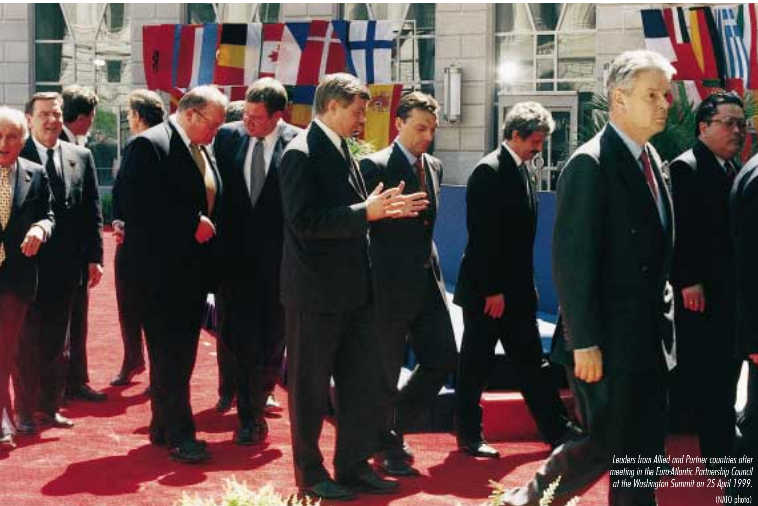
Leaders from Allied and Partner countries after meeting in the Euro-Atlantic Partnership Council at the Washington Summit on 25 April 1999.

Initiative (DCI) and the Membership Action Plan (MAP) for Partners aspiring to join the Alliance. It supports the DCI in addressing the interoperability challenges associated with future multinational crisis response operations; and it reinforces the MAP by better focusing PfP participation on essential membership-related issues in defence and military fields. In addition, PfP will likely play a key role in fostering security and stability in the Balkan region in the wake of the Kosovo crisis.