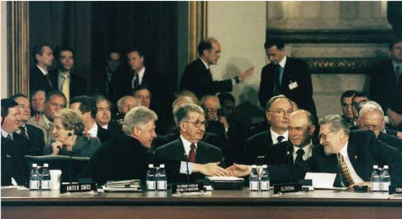
(Left to right) US President Bill Clinton reaches across President Kiro Gligorov of the former Yugoslav Republic of Macedonia (1) and Slovenian Prime Minister Janez Drnovsek to shake hands with Romanian President Emil Constantinescu. During the Washington Summit last April, the Allies met the leaders of the South-eastern countries neighbouring Serbia to launch work on a set of initiatives to enhance security in the region.