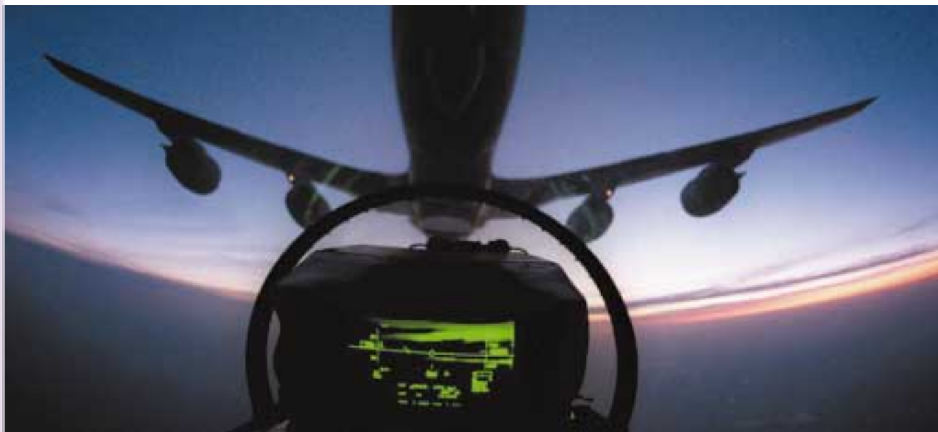
An F-16 Fighting Falcon from the 510th Fighter Squadron based in Aviano, Italy, refuels in flight from a KC-135 Stratotanker during a mission to provide air cover during Operation Allied Force on 6 May 1999.

At last April's Washington Summit, Alliance leaders launched a Defence Capabilities Initiative to equip NATO for the defence and security challenges of the 21st century. NATO has already undergone a fundamental transformation since the early 1990s, with significant changes in its force and command structure, as well as taking on new tasks, including a developing crisis response capability as seen in Bosnia and Herzegovina and more recently in Kosovo. It has also developed the ability to support WEU-led operations. But work remains to be done, such as developing an effective rapid deployment capability and employing more advanced technologies, and this is what the new Initiative aims to bolster.