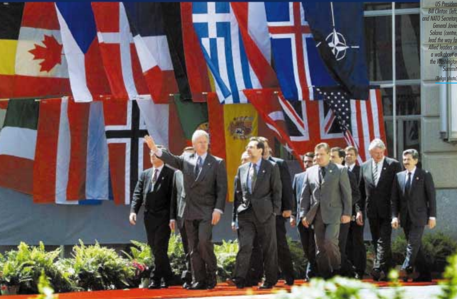
US President Bill Clinton (left) and NATO Secretary General Javier Solana (centre) lead the way for Allied leaders on a walkabout at the Washington Summit.