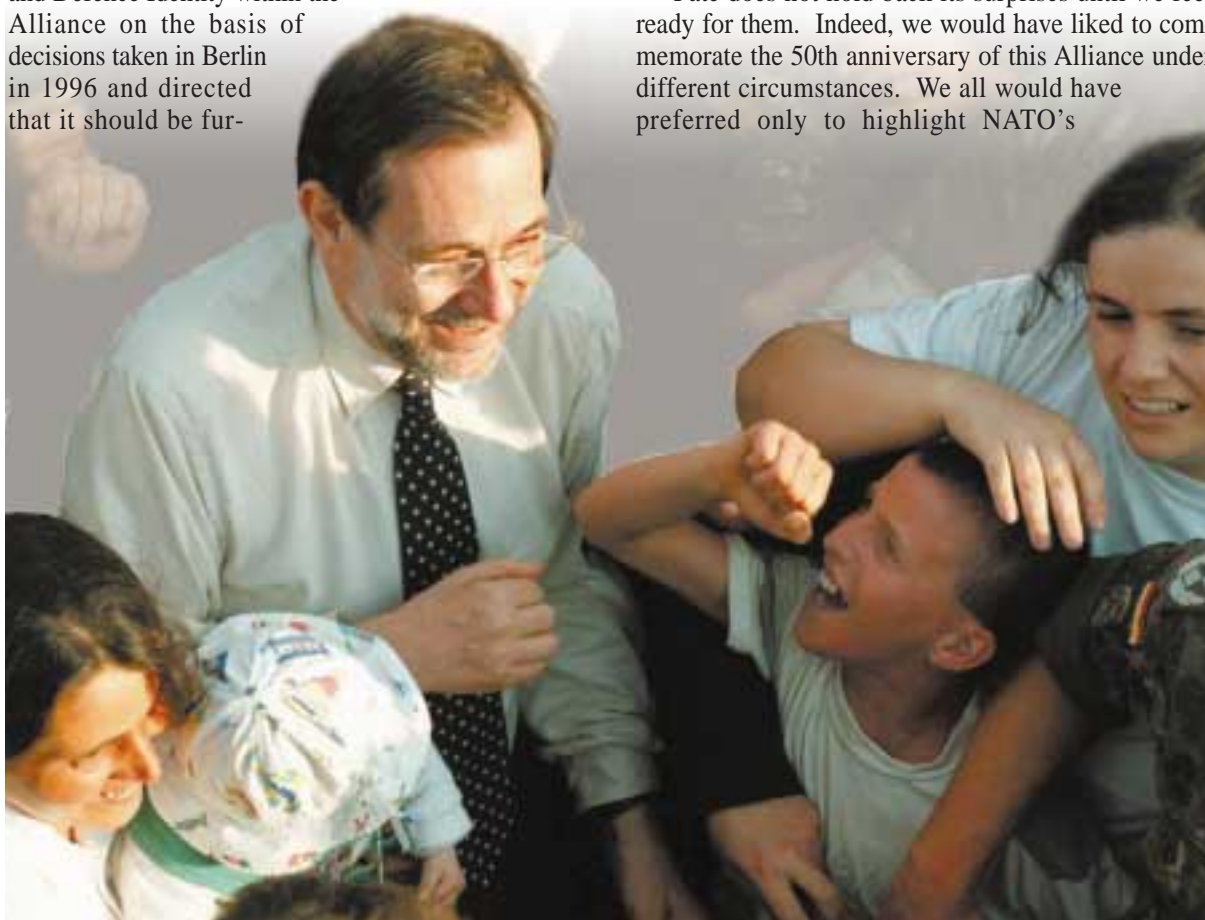
NATO Secretary General Javier Solana is greeted by Kosovar refugees at the Cegrane refugee camp in the former Yugoslav Republic of Macedonia* on 12 May.

NATO's future will also require a stronger role for the European Allies and a re-balancing of the vital transatlantic relationship. That is why, at the Summit, NATO's leaders welcomed the new impetus given to efforts to strengthen the European security and defence dimension and reaffirmed the Alliance's support for these efforts. The Summit recognised the significant progress achieved in building the European Security and Defence Identity within the Alliance on the basis of decisions taken in Berlin in 1996 and directed that it should be fur-