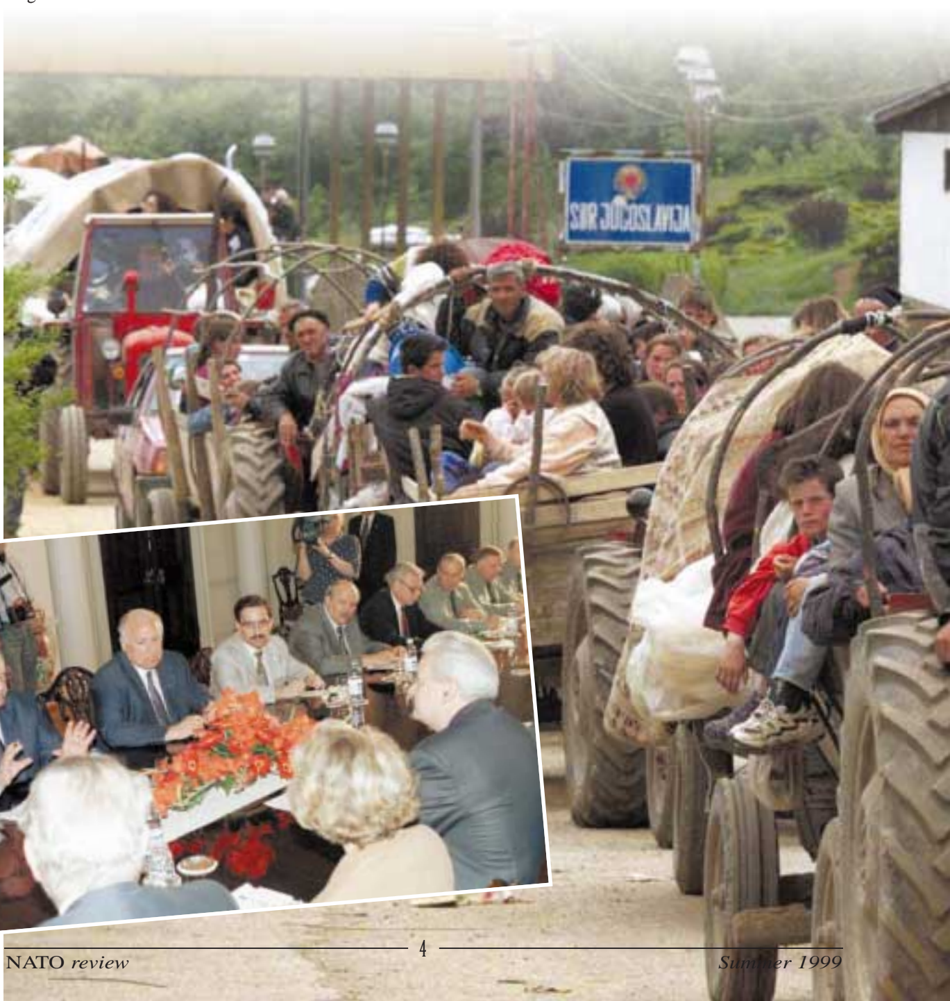
Finnish President Martti Ahtisaari, the European Union's envoy (left), and Russian envoy Viktor Chomomyrdin (centre) meet with Yugoslav President Slobodan Milosevic (near right) in Belgrade on 3 June to secure his acceptance of the international community's peace plan for Kosovo.