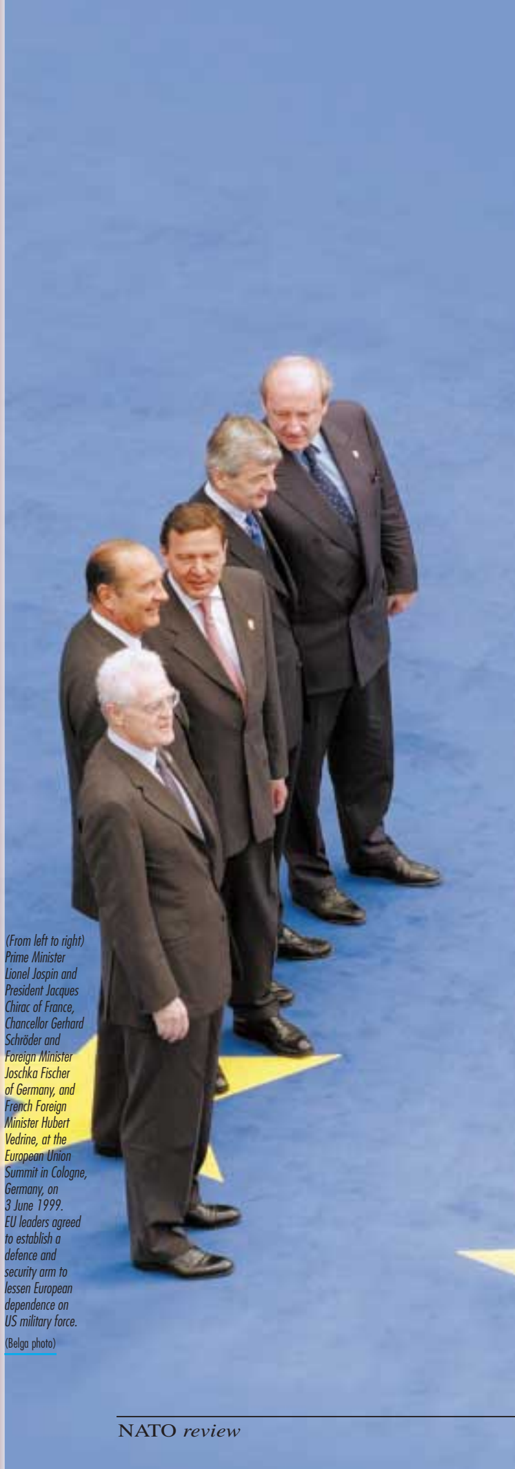
(From left to right) Prime Minister Lionel Jospin and President Jacques Chirac of France, Chancellor Gerhard Schröder and Foreign Minister Joschka Fischer of Germany, and French Foreign Minister Hubert Vedrine, at the European Union Summit in Cologne, Germany, on 3 June 1999. EU leaders agreed to establish a defence and security arm to lessen European dependence on US military force.