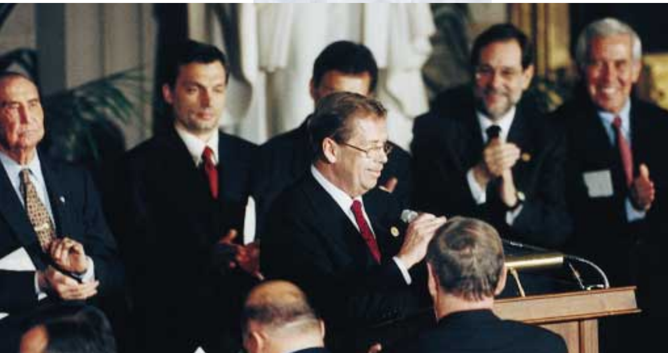
Czech President Václav Havel speaks during a ceremony at the Capitol at the start of the Washington Summit on 23 April, the first formal occasion to bring the leaders of the Czech Republic, Hungary and Poland together with other Alliance leaders, since the three new members joined the Alliance last March.

The leaders of the three newest Allies were formally welcomed into the Alliance at the Washington Summit meeting on 24 April 1999. At the same time, NATO Heads of State and Government reaffirmed their commitment to the openness of the Alliance and pledged that the Alliance would continue to welcome new members. But they went beyond a mere declaration of intent. They also launched a Membership Action Plan (MAP), a programme of activities to assist aspiring countries in their preparations for possible future membership.