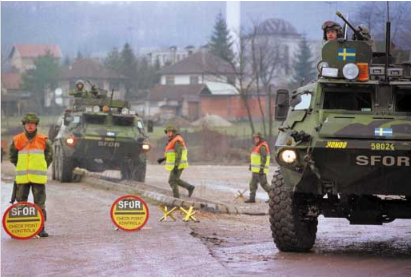
SFOR soldiers from Sweden, a Partner country, man a checkpoint near Tuzla, Bosnia and Herzegovina, last March.

The Washington Summit also heralded a new stage in the continuing evolution of PfP. Allies and Partners demonstrated their commitment to a more operational role for the Partnership by developing a coherent package of measures to reinforce PfP's operational capabilities.