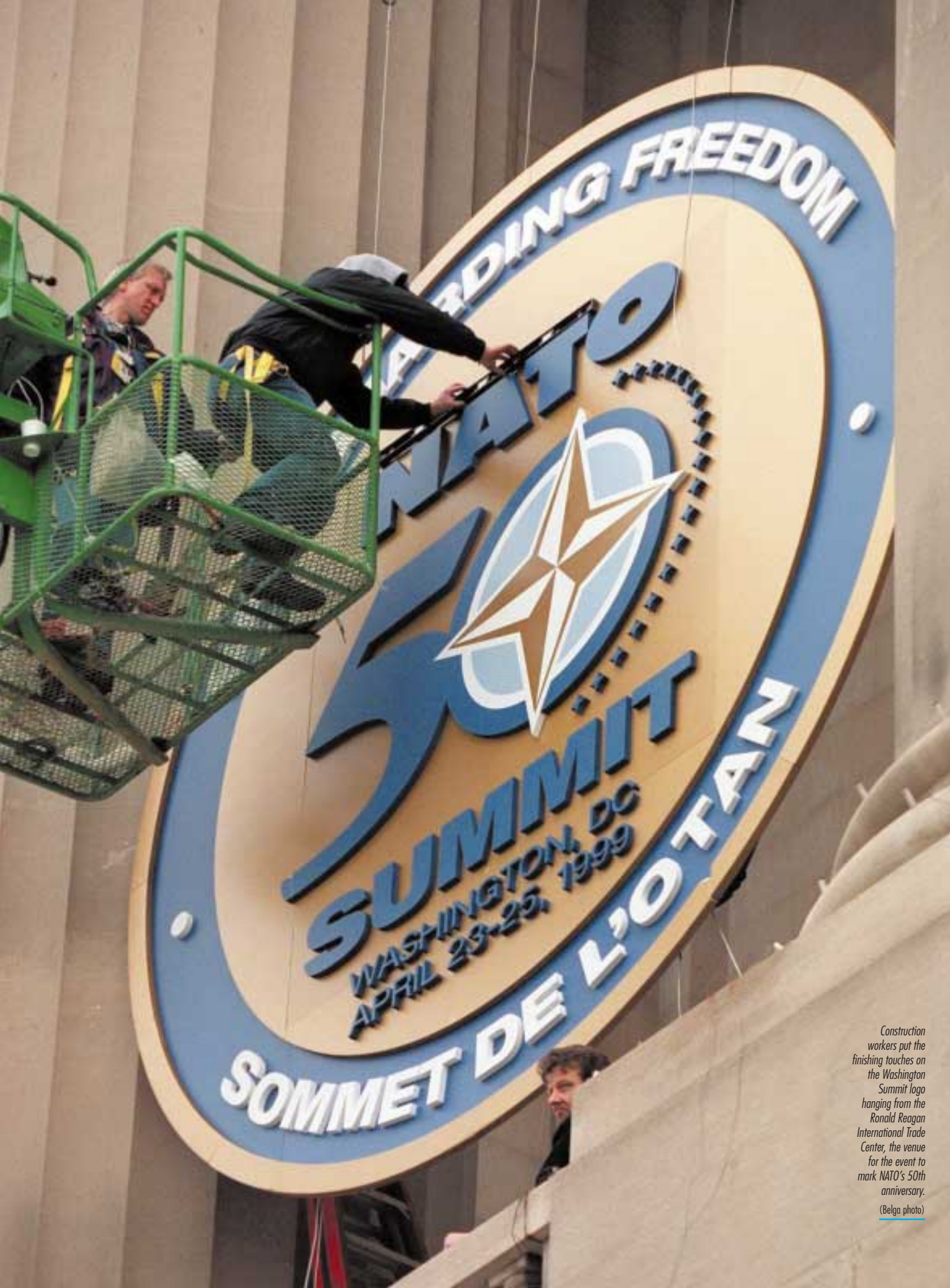
Construction workers put the finishing touches on the Washington Summit logo hanging from the Ronald Reagan International Trade Center, the venue for the event to mark NATO's 50th anniversary.