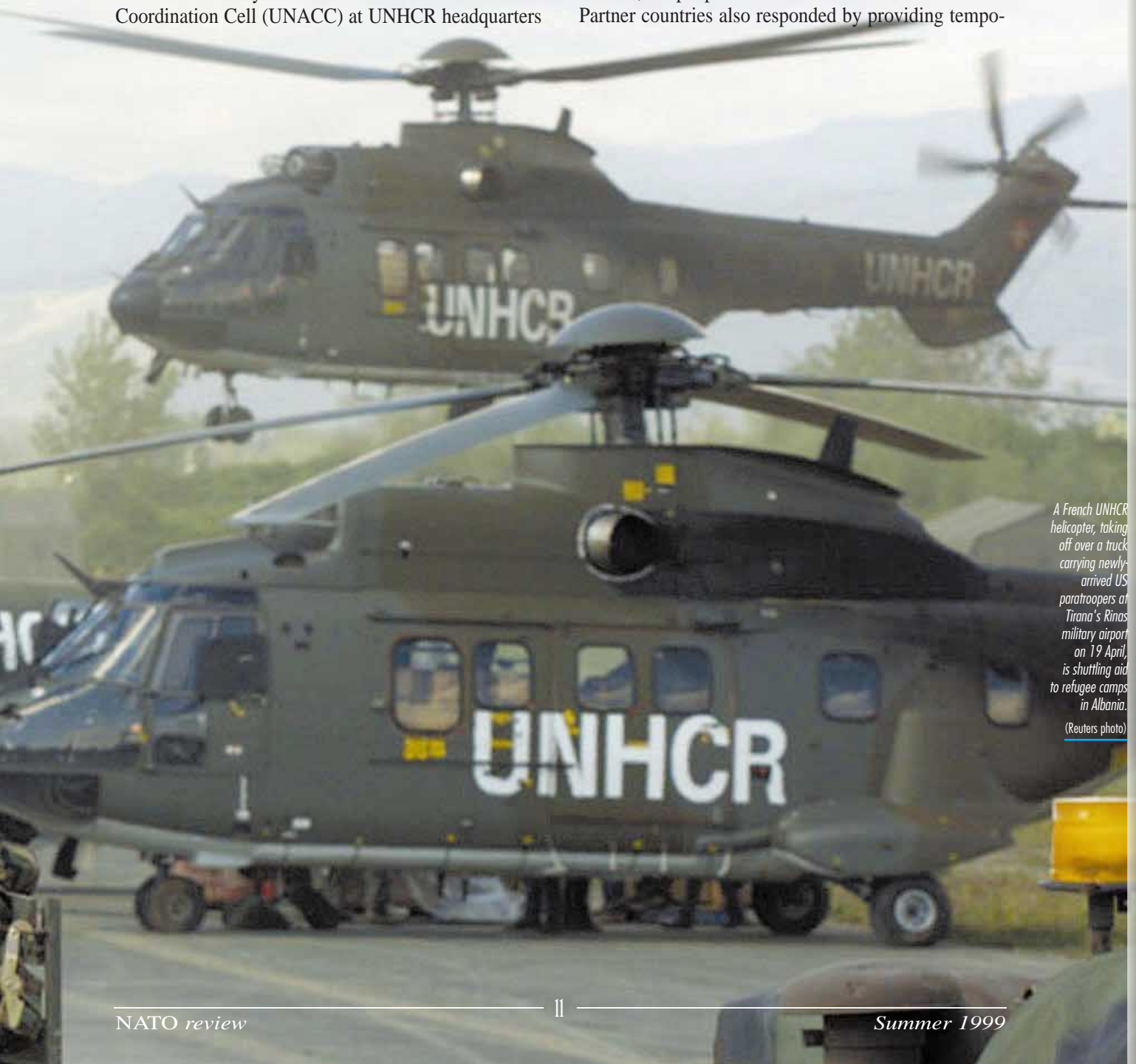
A French UNHCR helicopter, taking off over a truck carrying newly-arrived US paratroopers at Tirana's Rinas military airport on 19 April, is shuttling aid to refugee camps in Albania.

NATO countries responded to appeals from UNHCR and the Skopje government by offering to provide temporary asylum for more than 110,000 Kosovar refugees in the former Yugoslav Republic of Macedonia. They have provided aircraft to move more than 60,000 people to all 19 NATO member countries. Partner countries also responded by providing tempo-