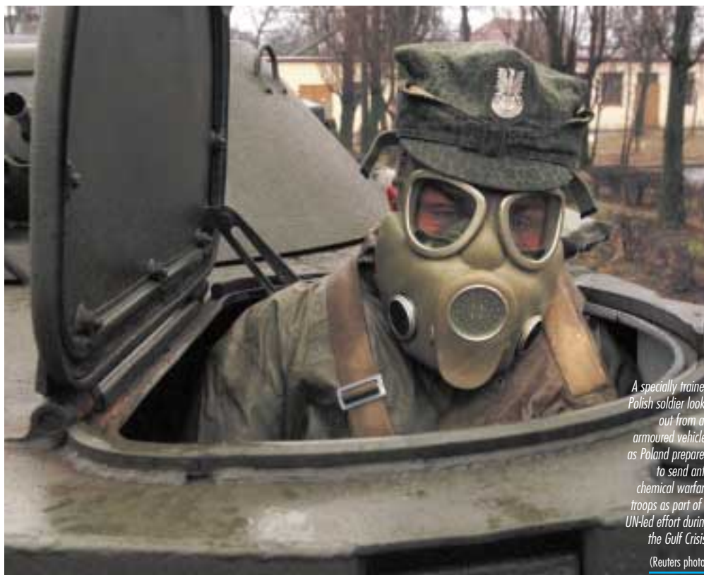
A specially trained Polish soldier looks out from an armoured vehicle, as Poland prepared to send anti-chemical warfare troops as part of a UN-led effort during the Gulf Crisis.

The Senior Politico-Military Group on Proliferation (SGP) and the NATO Senior Defence Group on Proliferation (DGP), under the authority of the Joint Committee on Proliferation (JCP).