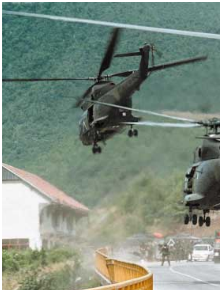
British Puma military transport helicopters bring KFOR soldiers and equipment into Kosovo on 13 June.

The Yugoslav integrated air defence system had been seriously damaged. Without continued suppression it would have recovered quickly; it was a race of Allied destruction against Serb reconstruction and