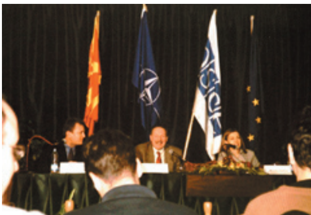
Marc Laity at a press conference

For the media it was a shock. The worst media had interpreted our reactive and low-key response as a manifestation of weakness and lack of confidence in our own case, and polite rejections of outrageous allegations were brushed aside. Our previous refusal to engage on political issues had also been seen as weakness by journalists who did not understand the limitations of what Western military officers can say. Suddenly, they themselves were challenged, and because NATO's daily press conferences were the media highlight of the day, they had little choice but to report what we said. Every night the NATO press conference took up huge chunks of television airtime. Much of the analysis was still distorted, but NATO's messages and agendas were being heard in a way they had never been heard before, and many of the