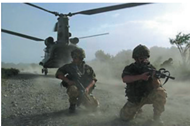
Afghan aftermath: An international security presence is required to help rebuild Afghanistan.

In the decade before 11 September 2001, there were plenty of conflicts around the world, but little clarity among Western powers about their strategic interests and moral responsibilities for ending them. The absence of the strategic focus that had been provided by the East-West struggle was keenly felt and could be seen in the confusion of Western responses to state breakdown and civil war in a range of countries, including Afghanistan, Angola, former Soviet Republics in Central Asia and the Caucasus, Liberia, Rwanda, Sierra Leone, Yugoslavia and Zaire/Congo. Some of these civil conflicts, as in Afghanistan and Angola, were continuations of Cold War-era proxy wars that maintained their deadly momentum long after Super-Power patrons had lost interest. Others — some former Soviet republics and Yugoslavia — were the consequence of the collapse of multi-national states.