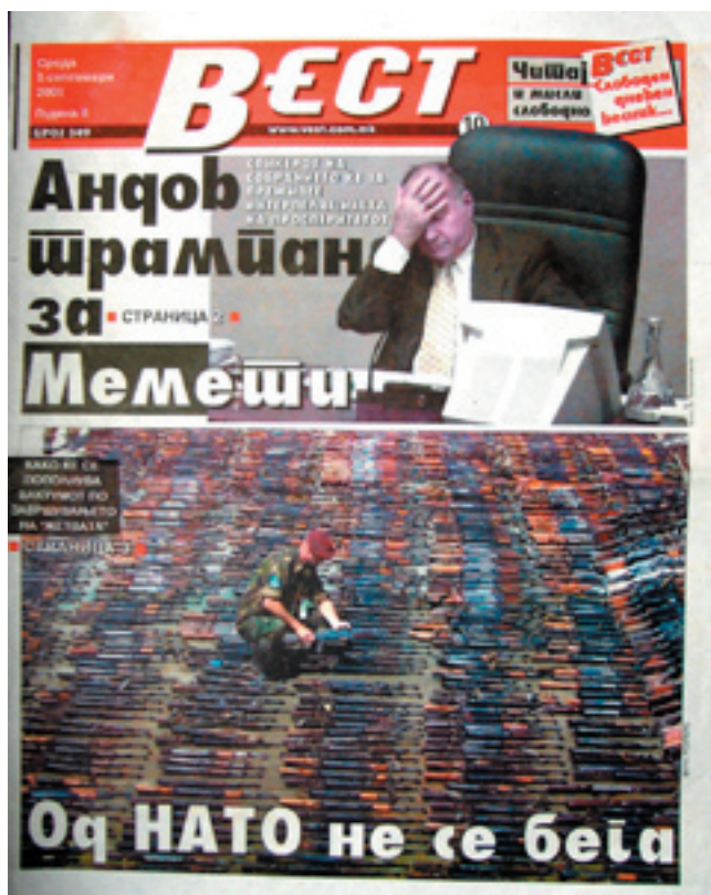
PR problem: Even good-news stories like the collection of NLA weapons could be interpreted negatively.

The original NATO media operation was relatively small. It was responsible for the public relations activities of the logistical support to KFOR in the former