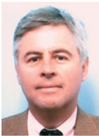
Special Representative Pieter Feith.

As the crisis escalated, it became clear that Skopje could not resolve it on its own. In this way, NATO received a request on 14 June from President Trajkovski for help with implementing a plan for defusing the crisis, notably to assist with the disarming of the armed groups. In response, the North Atlantic Council commissioned military advice that, in turn, stressed that any NATO operation would have to be limited in scope, size and time.