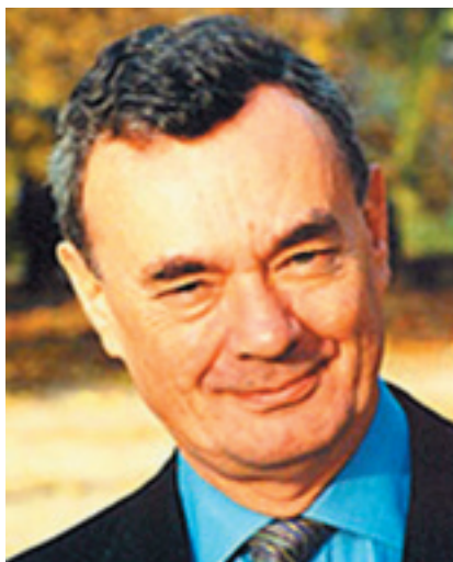
Merritt: “We’ve got to bring the European Union and NATO closer together.”

The NDA has set up three working groups covering European force projection and capabilities; the transatlantic relationship; and defence-led research