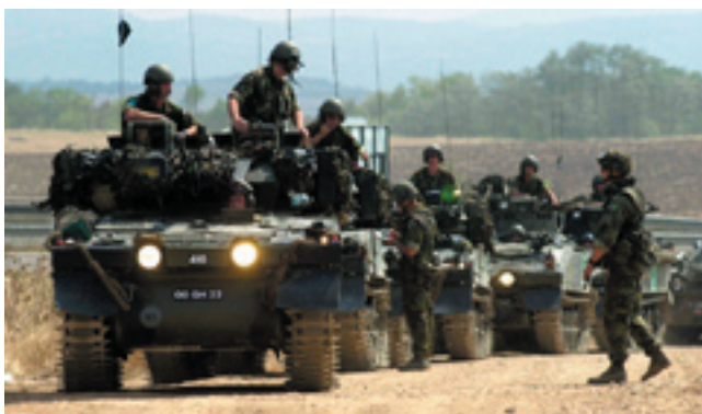
Timely intervention: NATO intervened in the former Yugoslav Republic of Macedonia* before tensions exploded into open conflict.

Since the end of the Cold War, NATO has been on a steep learning curve. It took years — too many years — for the Alliance to take action to stop civil war in Bosnia and Herzegovina. NATO reacted far more quickly over the Kosovo crisis, but still too late to prevent ethnic cleansing and terrible human rights abuses. Most recently, the Alliance intervened in Southern Serbia and in the former Yugoslav Republic of Macedonia* before tensions exploded into open conflict — with the result that mass bloodshed was averted, and peace maintained at a relatively low cost.