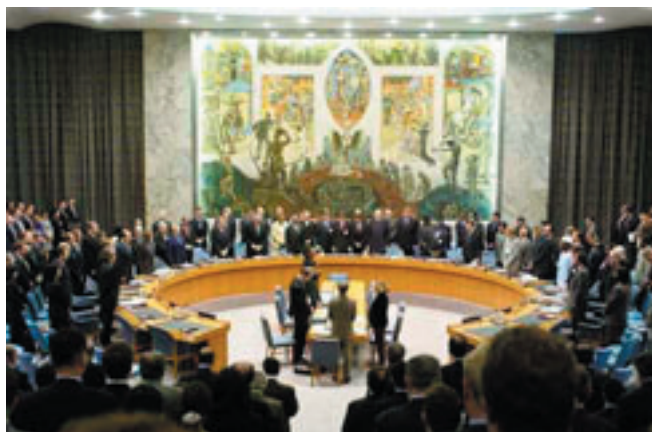
Security Council in special session: The United Nations is unquestionably the principal institution for building, consolidating and using international authority

The dilemma of humanitarian intervention has been overtaken since the terrorist attacks of 11 September 2001 with other preoccupations, but it has not been resolved and it has not gone away. When, if ever, is it appropriate for states, individually or collectively, to take coercive action, and in particular military action, against another state – not for the purpose of self defence, and not in order to address some larger threat to international peace and security as traditionally understood, but for the purpose of protecting people at risk within that state?