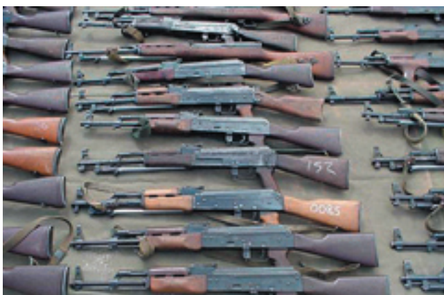
Lethal weapons: During Essential Harvest, NATO soldiers collected close to 4,000 weapons in 30 days.

T his year looks likely to be the first in more than a decade in which good news has eclipsed bad in Southeastern Europe. This is, no doubt, partly attributable to the aftermath of the terrorist attacks of 11 September 2001 against the United States and the shift in media attention to other parts of the world. But it is also the result of genuine improvements in conditions on the ground which appeared extremely unlikely a year earlier.