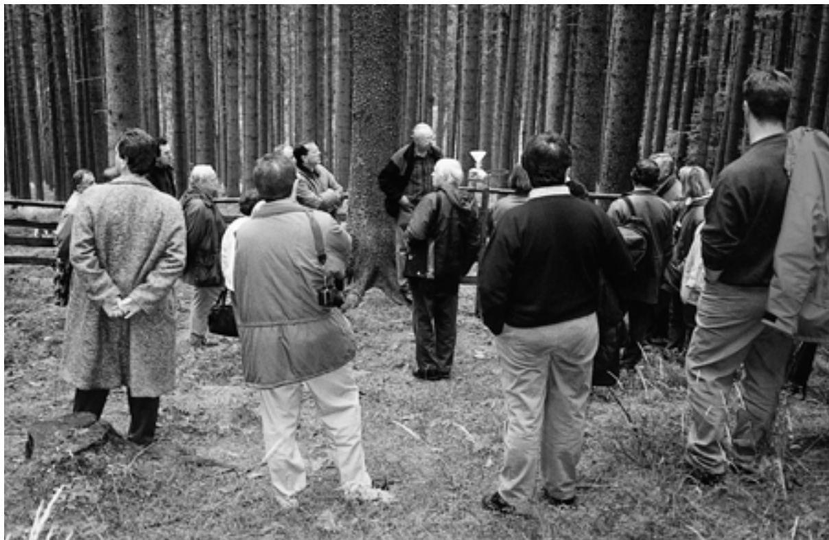
A practical demonstration of the effects of pollution in a forest in the Upper Silesia industrial area, during the NATO Advanced Workshop held in Cieszyn, Poland, in September 1997.

Other initiatives are also underway, such as a programme of industrial partnerships intended to speed the transfer of technology from academic institutions to industry; an agreement with scientific leaders in