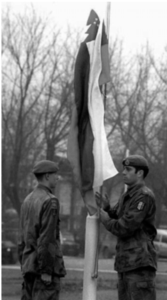
Norwegian SFOR soldiers raise the Slovenian national flag on 5 November 1997 at a camp near Sarajevo to mark the occasion of 35 members of the Slovenian air force being assigned to SFOR for tasks in Bosnia.

democratisation in Kosovo and in South-eastern Europe.