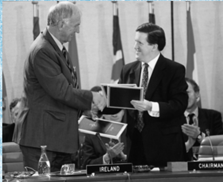
Irish Foreign Minister David Andrews (left) signs the PfP Framework Document and submits Ireland's PfP Presentation Document to NATO Secretary General Lord Robertson, on 1 December.

The next step will be to develop an Individual Partnership Programme for Ireland, based on the wide-ranging menu of cooperative activities available under PfP, which allows Partner countries to tailor their participation according to specific national requirements and priorities. As Mr Andrews stated in remarks to the North Atlantic Council: "Ireland attaches importance to the voluntary, flexible and self-differentiating characteristics of the Partnership for Peace."