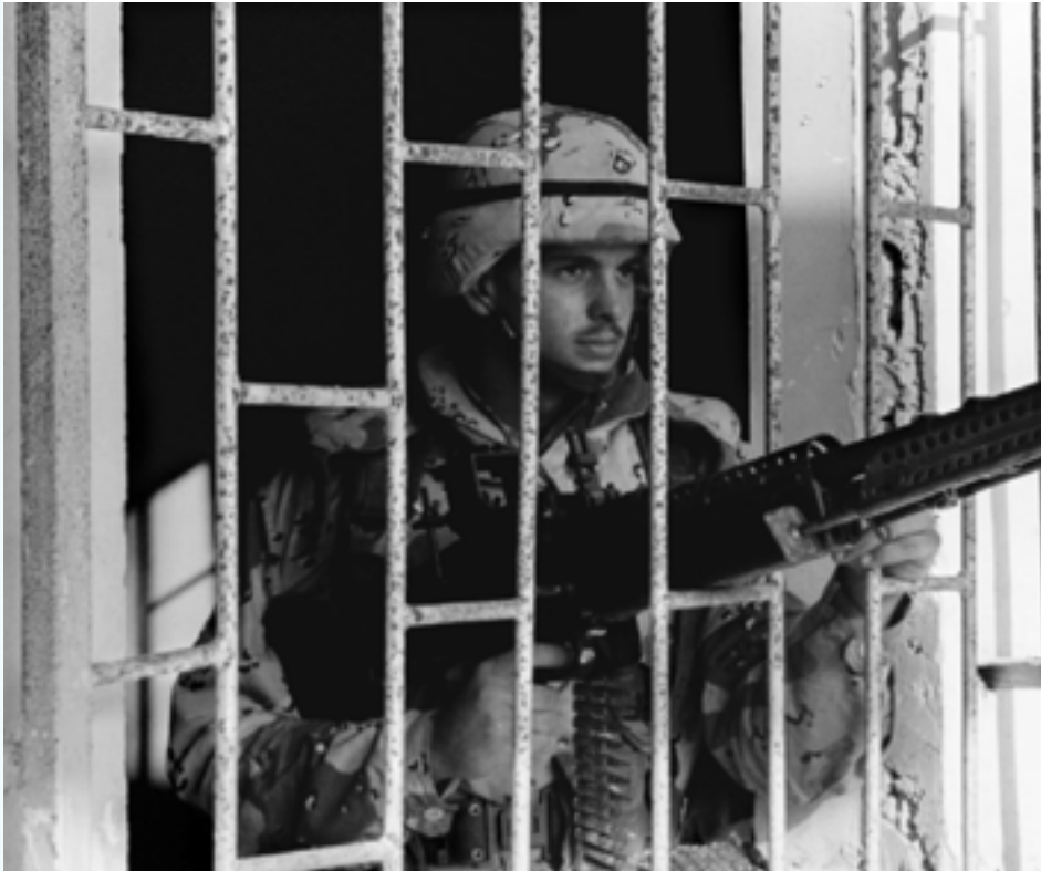
A US soldier keeps guard from a defensive position in Mogadishu, Somalia, in June 1993.

absence of “A list” threats since the end of the Cold War. But another reason is the ability of “C list” issues to dominate media attention in the Information Age. Dramatic visual portrayals of immediate human conflict and suffering are far easier to convey to the public, than “A list” abstractions like the possibility of a “Weimar Russia” or the potential collapse of the international system of trade and investment. Yet, if these larger strategic issues were to turn out badly, they would have a far greater impact on the lives of most ordinary citizens of NATO countries.