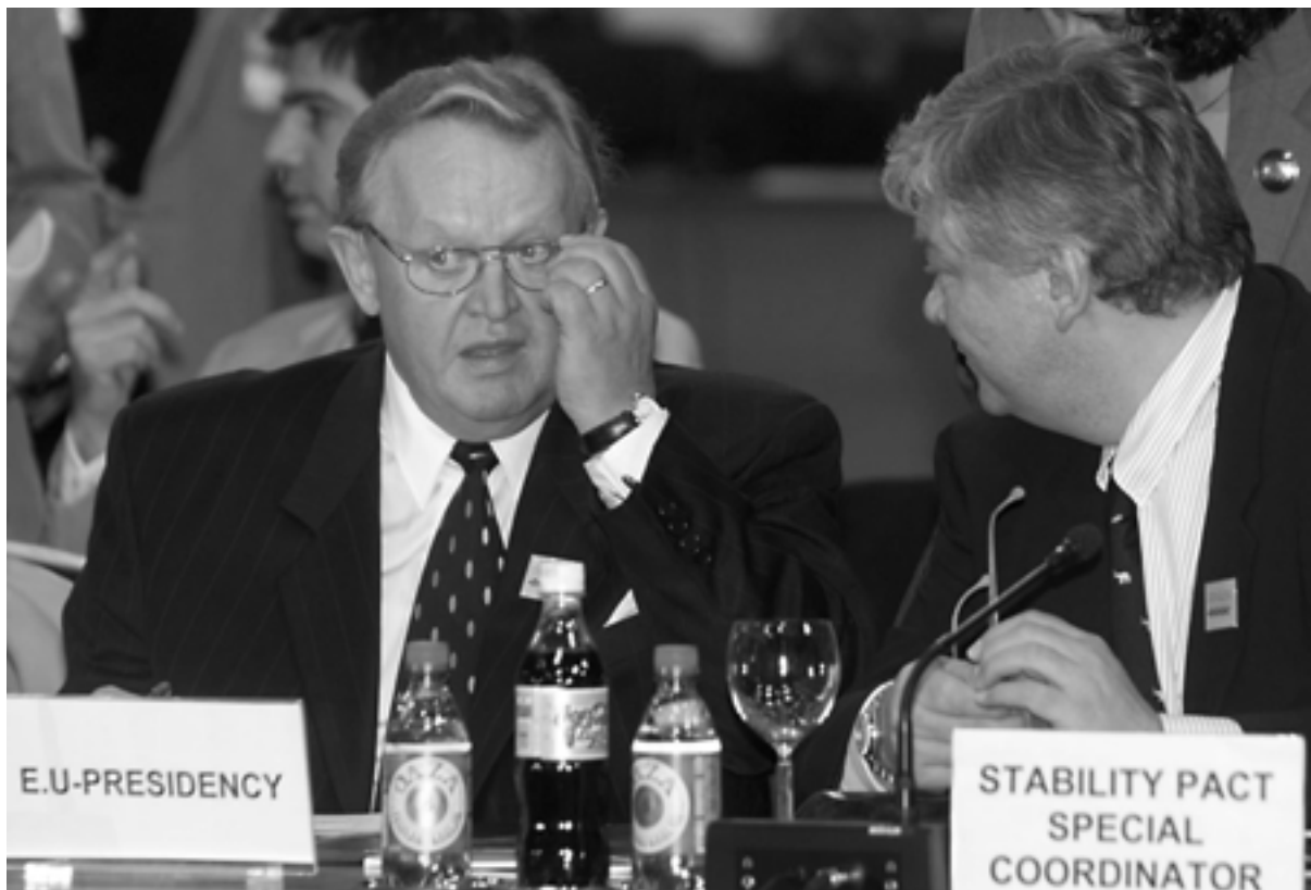
Finnish President Martti Ahtisaari (left) — seated next to Stability Pact Special Coordinator Bodo Hombach during a meeting of nine Balkan States on the eve of the Stability Pact Summit in Sarajevo — spoke of the Stability Pact in terms of a marathon.

The Stability Pact is a type of Helsinki Process for South-eastern Europe. Its decision-making structures, which consist of a system of three "Working Tables", the results of which are brought together at the "Regional Table", reflect closely the "Baskets" which