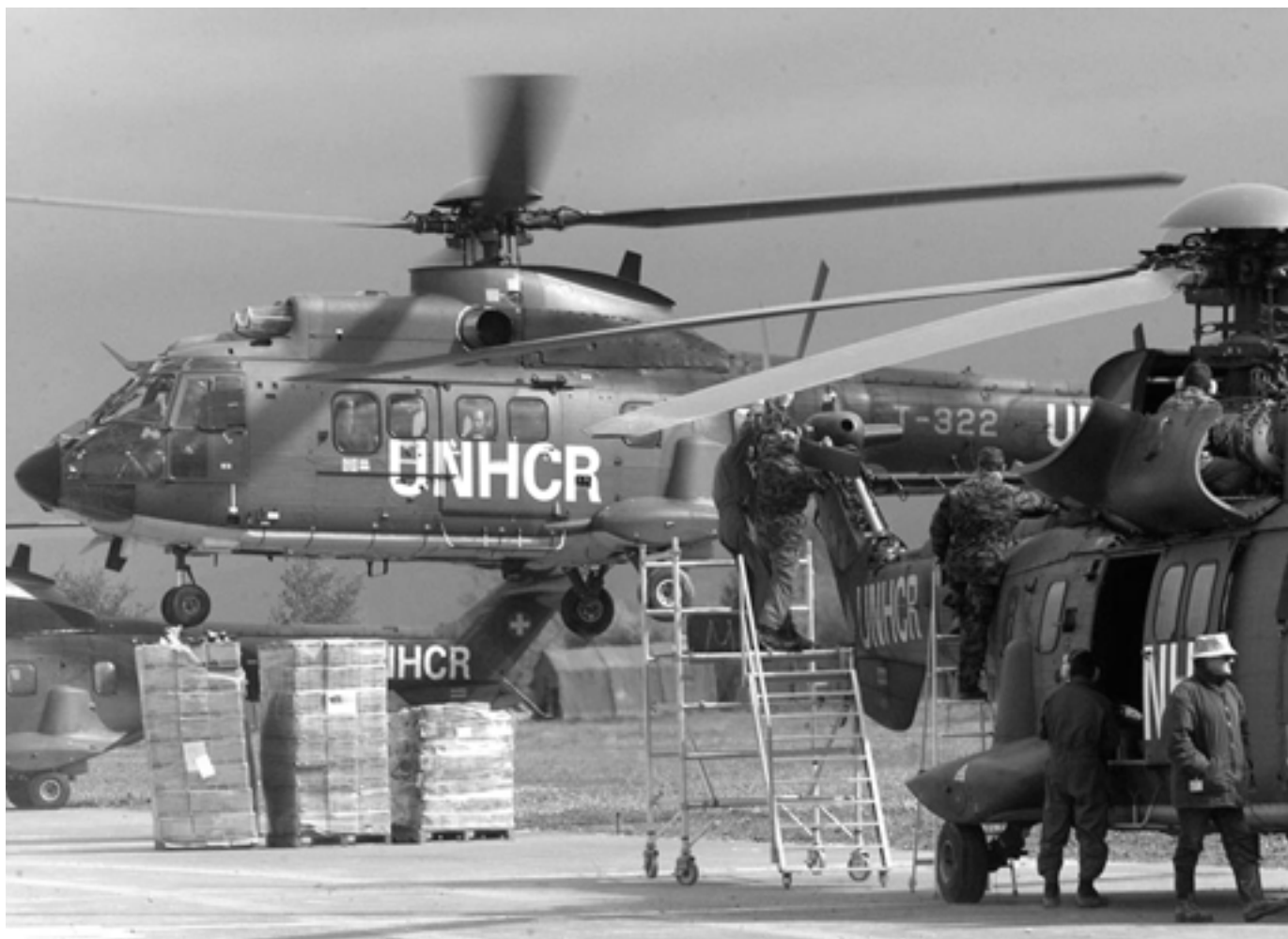
Swiss UNHCR helicopters deliver humanitarian aid to Kosovar refugees in northern Albania on 20 April.

Domestic legislation prohibits the Swiss government from sending armed units abroad. Nevertheless, the Swiss government decided to provide an unarmed support unit to the Austrian battalion in KFOR. About 140 Swiss soldiers are now deployed in Kosovo. In the meantime, a public debate has started in Switzerland as to whether this prohibition against sending armed troops abroad should be lifted, as well as other legal obstacles hampering international cooperation.