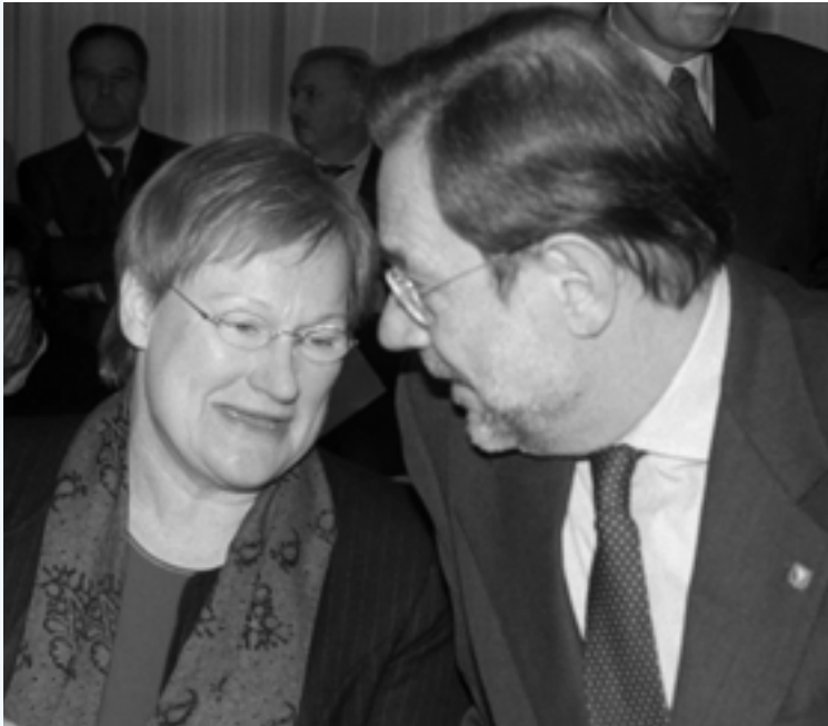
Dr Javier Solana, High Representative for the EU's Common Foreign and Security Policy, listens to Finnish Foreign Minister Tarja Halonen, President of the EU Council, at the first formal joint EU foreign and defence ministers meeting, in Brussels on 15 November. Proposals for the creation of a European rapid reaction force were discussed, in preparation for the EU Helsinki Summit in December.