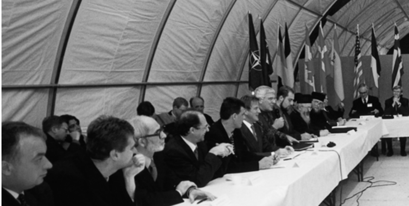
The North Atlantic Council meets ethnic Albanian and Serb community leaders at KFOR headquarters, Pristina, Kosovo, on 22 October.

My job is to build on that success, in order to ensure that NATO continues to meet the challenges of the future. Let me outline several of the specifics.