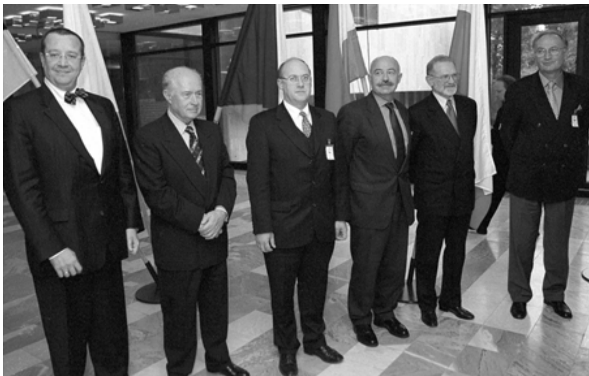
(Left to right) Foreign Ministers Toomas Hendrik Ilves (Estonia), Ioannis Kasoulides (Cyprus), Jan Kavan (Czech Republic), János Martonyi (Hungary), Bronisław Geremek (Poland) and Boris Frlec (Slovenia) met in Tallinn, Estonia, on 11 October 1999, to discuss issues related to their negotiations for EU membership, as well as tighter cooperation between the six countries.