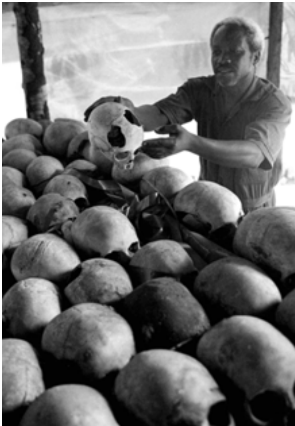
The official memorial site dedicated to the victims of genocide in the village of Ntarama, Rwanda, where 5,000 people were killed in April 1994.

such issues into the wider strategy for advancing the national interest.