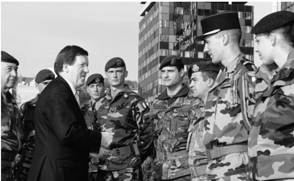
NATO Secretary General Lord Robertson speaks to multinational SFOR troops in Sarajevo, Bosnia, on 21 October, during a two-day visit to the region.

All these challenges were met successfully, thanks to the leadership of Javier Solana and to the remarkable cohesion of the Alliance, as well as its ability to adapt. The Alliance has evolved from a passive, reactive defence organisation into one which is actively building security right across Europe. NATO's agenda over this past decade has been so successfully implemented that the Alliance itself is more relevant and more indispensable than it has ever been. NATO's foundations as it enters the 21st century are rock solid.