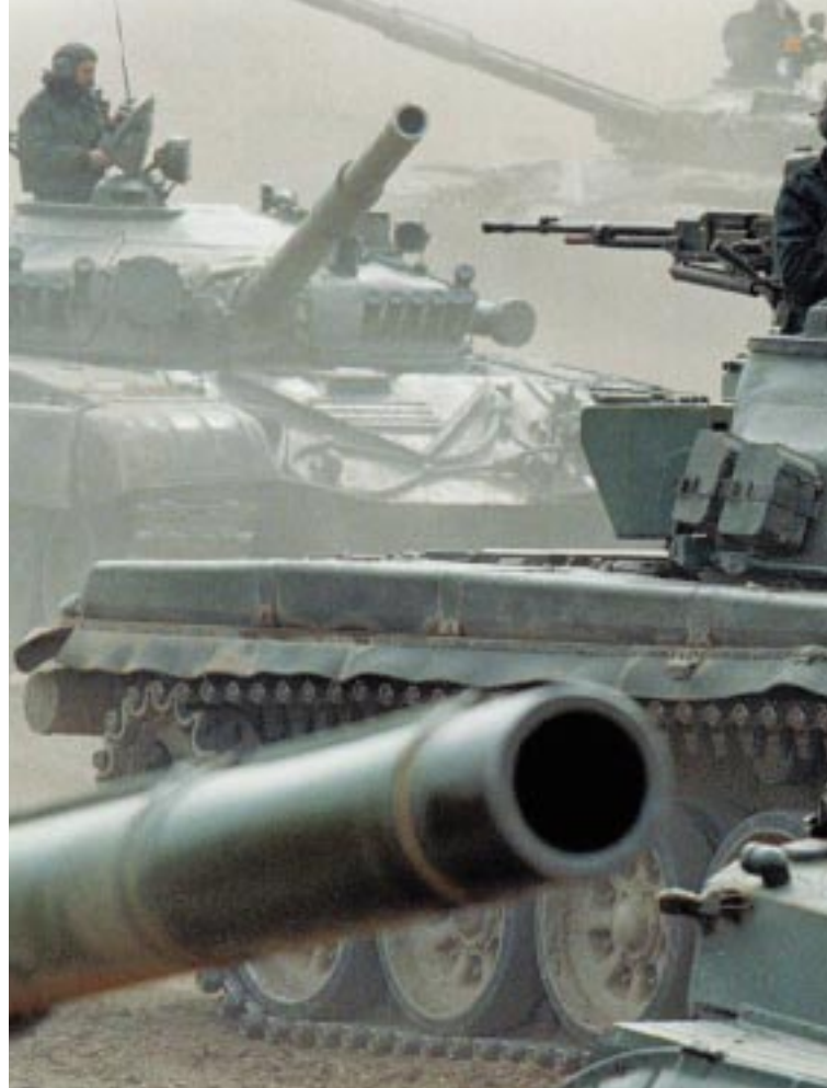
Hungarian T-72 tanks on manoeuvres in Tata, Hungary, last March.

An element that stands out among my personal experiences relates to procurement of equipment. An effective military depends on proper equipment, whether to undertake future Article 5 (collective defence) or non-Article 5 (peace support) operations. But in the face of scarce resources, it is important that only the right equipment is procured and in the right order of priority. NATO's advice and support in respect to procurement practices has been invaluable to us. I would like to stress that never, throughout the process of Hungary's accession, have we come under any pressure from NATO on the question of procurement of military equipment. On the contrary, NATO's message has been that buying new equipment should be secondary to structural reform, education and training. Hungary is not at the mercy of salesmen!