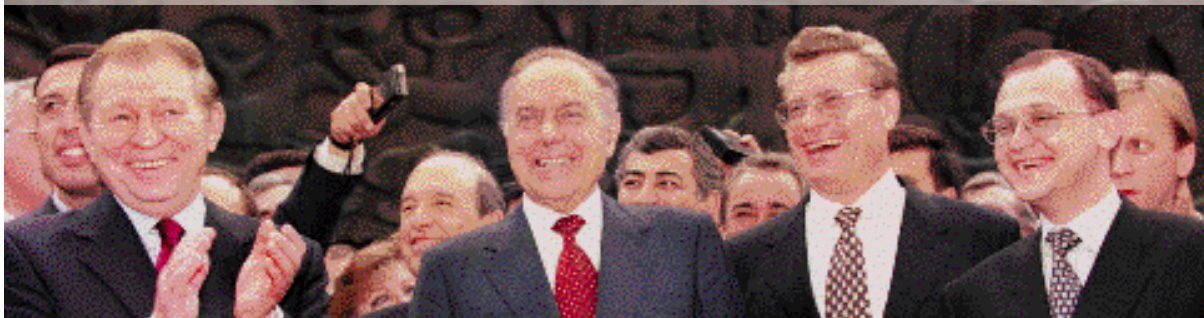
"Participation in regional cooperation mechanisms is an important aspect of Ukrainian foreign policy." From left to right, Ukrainian President Leonid Kuchma, Azerbaijani President Gaidar Aliev, Moldovan President Petru Lucinschi and Russian Prime Minister Sergei Kiriyenko, smiling for a photo at the Black Sea Economic Cooperation summit meeting in Yalta on 5 June.

tant links in the chain binding our state to the area of stability and good-neighbourliness as foreseen in the 1995 Pact on Stability in Europe.