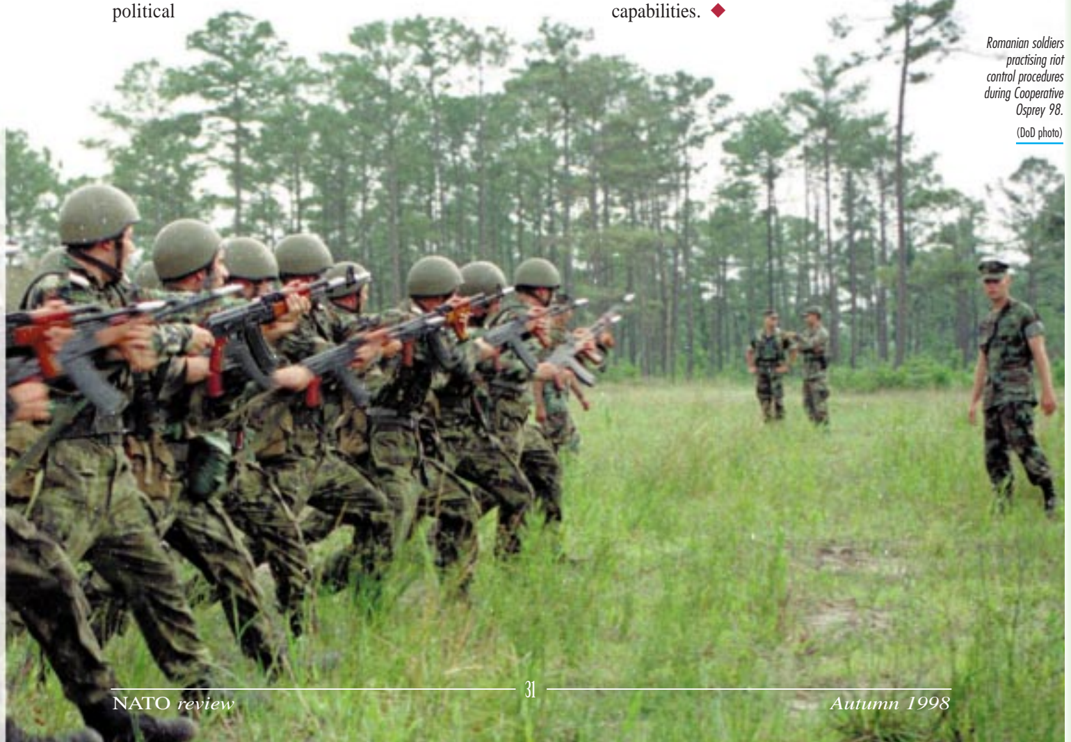
Romanian soldiers practising riot control procedures during Cooperative Osprey 98.

We have already come a long way in enhancing cooperation and capabilities in crisis management. The 28 May meeting of EAPC Foreign Ministers, who expressed serious concern about developments in Kosovo and called for a resolution of the crisis (see EAPC Statement on page D8 of the accompanying Documentation Supplement), is just one example of a common response to a real world problem and of the culture of cooperative security that NATO has fostered. But there is clearly more that can and should be done, and allies and partners will be considering other ways to enhance our common efforts to manage crises effectively. The direct relationship between the security of allies and that of all of Europe, which Alliance leaders emphasised in July 1997 in their Madrid Declaration, underlines the utility of our continuing common efforts to enhance crisis management cooperation and capabilities. ♦