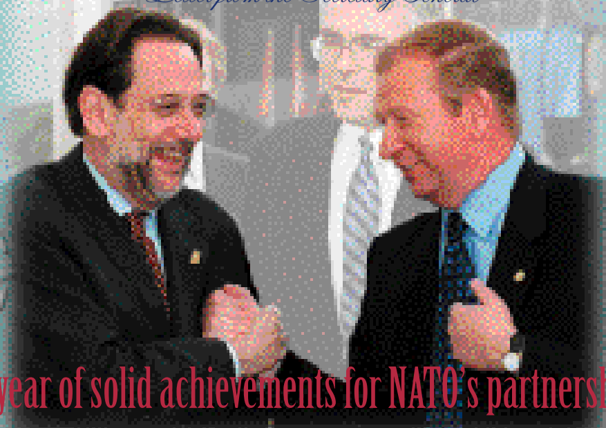
Javier Solana welcomes Ukrainian President Leonid Kuchma (right) for the signing ceremony of the NATO-Ukraine Charter in Madrid last year.