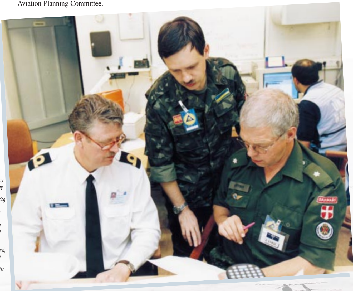
A Ukrainian officer from the Ministry of Emergencies (centre) conferring with his colleagues from Iceland and Denmark during the PFP exercise Cooperative Safeguard 97. (In the background, teams of rescue workers are practising disaster response procedures in the field during the exercise held in Iceland in July 1997.)

The Ukraine-NATO Working Group on Civil Emergency Planning, established under the aegis of the Ukraine-NATO Commission, was created to implement the Memorandum's provisions, as well for the planning and coordination of the joint activities. The first meeting of the Working Group took place in Kyiv last March with the participation of senior NATO officials and representatives from the Ukrainian Cabinet of