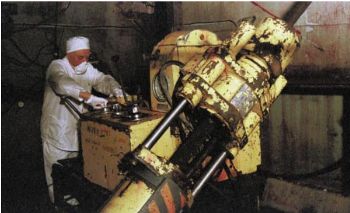
"Ukraine has valuable experience in responding to a nuclear emergency." Here, a worker operates a drilling machine making tests under the concrete sarcophagus built over the nuclear power plant's fourth reactor after the 1986 accident.