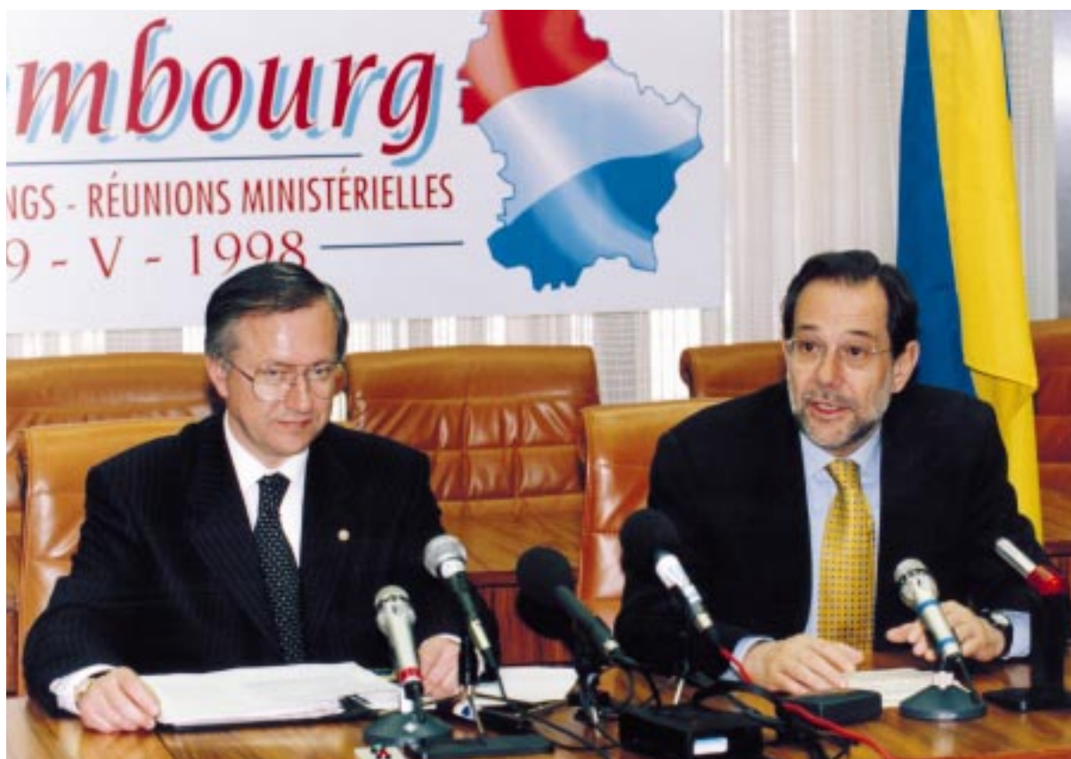
Ukrainian Foreign Minister Boris Tarasiuk (left) giving a press conference with NATO Secretary General Javier Solana after the 29 May meeting in Luxembourg of the NATO-Ukraine Commission at the level of Foreign Ministers.

European security and stability are of utmost concern to Ukraine, a founding member of the United Nations, and millions of whose citizens were victims of the Second World War and of the totalitarian Soviet regime. Since gaining its independence at the end of 1991, Ukraine has sought to make its contribution to the strengthening of European stability. One should not underestimate, for instance, the historic importance of Ukraine's unprecedented decision to voluntarily renounce its nuclear weapons and join the Non-