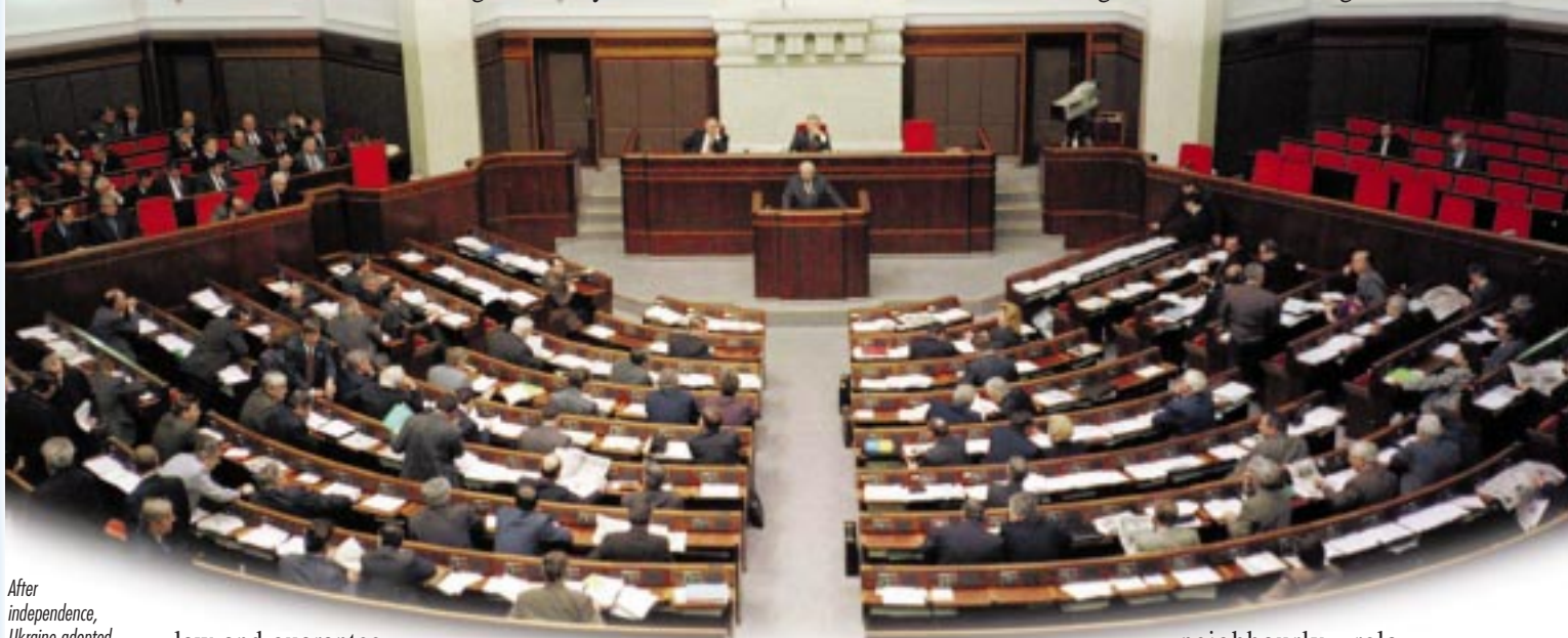
After independence, Ukraine adopted a new constitution providing for a clear system of government, including a unicameral parliament, the Verkhovna Rada.

law and guaranteeing civil rights. It provides for a clear system of government, with a President as head of state, a unicameral parliament elected by universal suffrage, called the Verkhovna Rada , a legislative system which incorporates the norms of European law, and a system of local self-governance. Moreover, Ukrainian legislation guaranteeing the rights of national minorities has gained international respect and praise.