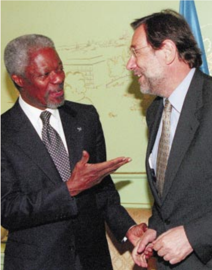
UN Secretary General Kofi Annan (left) and NATO Secretary General Javier Solana conferring in Rome on 15 June on the situation in the former Yugoslavia.

tance, such as the UN OCHA, thus facilitating the consensus achieved among the 44 nations of the EAPC.