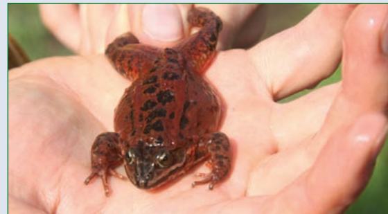
In an ongoing effort to recover native Puget Sound wetland species, some 600 endangered Oregon spotted frogs raised at Woodland Park Zoo were released into the wild after spending the first nine months of their lives in a captive-rearing program. Biologists from the Washington Department of Fish and Wildlife (WDFW), Woodland Park Zoo, Oregon Zoo, and the U.S. Army released the frogs this fall into Dailman Lake on the Fort Lewis Military Reservation in Pierce County. This is part of a collaborative effort to return the endangered frog to a portion of its historic habitat.