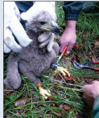
Banding of a white-tailed eagle nestling at Grafenwoehr Training Area. This bird species is one of the rarest in the state of Bavaria. In 2009, only six nestlings fledged.