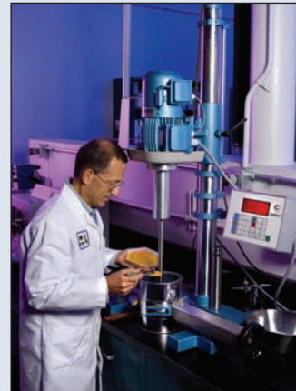
A principal investigator at Army Research Laboratory formulating the next generation CARC materials for improved performance and environmental sustainability.