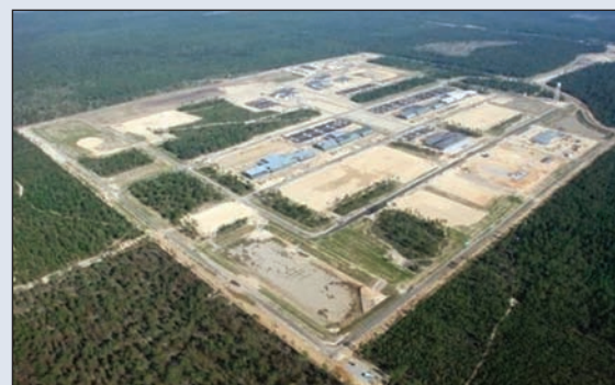
Eglin's CRM Team conducted 58 archaeological evaluations and surveyed 8,800 acres of land designated for the 7th Special Forces Group training range. CRM developed a way to protect valuable cultural resources, installing nearly 19,564 feet of fence and 7,000 resource markers designed to help soldiers avoid four National Register of Historic Places listed sites and other eligible resources within the special Army training areas. This innovative idea saved $650,000 in potential data recovery expenses.