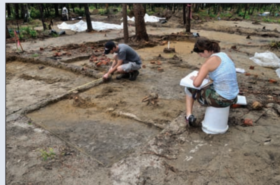
Local archaeologists excavate a prehistoric site on Eglin Air Force Base. The data recovery project is a mitigation effort to support the construction of a 10 mile road stretching across some of the base's ranges. The Mid-Bay Bridge Corridor will improve hurricane evacuation routes for Eglin personnel and local residents.