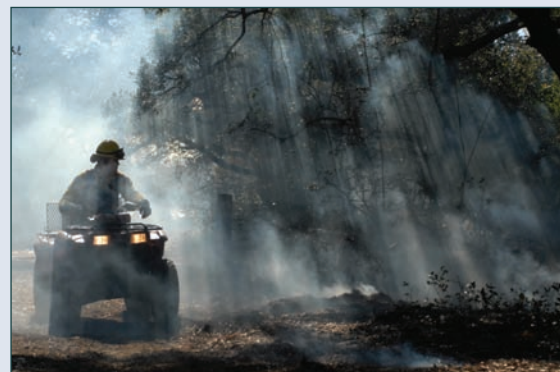
JG's team of wildland firefighters led the nation with 112,600 prescribed fire acres in fiscal year 2009, resulting in a combined 217,000 acres burned over the last two fiscal years.