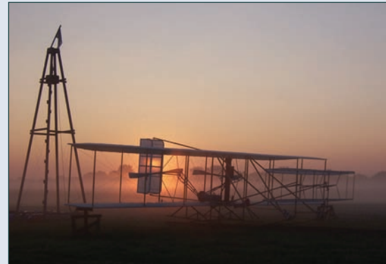
Huffman Prairie Flying Field, a National Historic Landmark, at sunrise. This is the field where the Wright brothers perfected the first practical airplane, which took flight on October 5, 1905. The photo shows the replica catapult and flyer that are typically on display at the flying field during summer visitation hours at the Dayton Heritage National Historical Park.