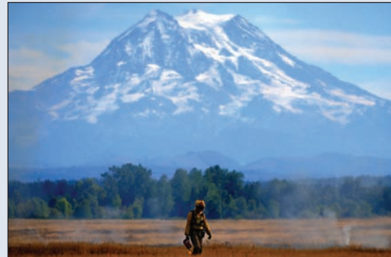
The largest intact native prairie in Washington is located on JBLM. JBLM staff partnered with The Nature Conservancy to conduct ecological burns designed to reduce flammable fuels, emulate natural disturbances, limit encroachment by exotic plants, and maintain this desirable ecosystem. More than 1800 acres were burned in 2009.