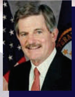
Jim Nicholson, Secretary of Veterans Affairs

An anniversary celebration and conference are being planned for later this year in San Diego, CA.