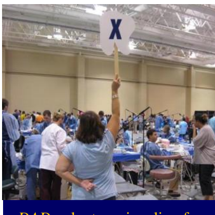
DAD volunteer signaling for next extraction patient

mer. During our one-day volunteering with the MOM project, our group ended up treating over 300 patients in a high school gym with 35 mobile dental units.