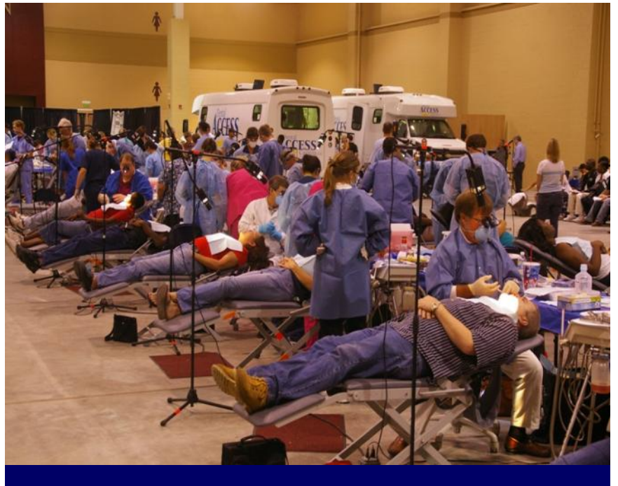
Charleston DAD Project in full swing

treated for an estimated total of profession. $1,059,648 of donated dentistry (using UC insurance reference). For the first time. anterior root canals and acrylic services rendered. There were 120 mobile chairs, 187 dentists, 67 Hygienists, 123 dental assistants, 25 office staff and 85 MUSC students who worked long hours to make a difference in the lives of these patients.