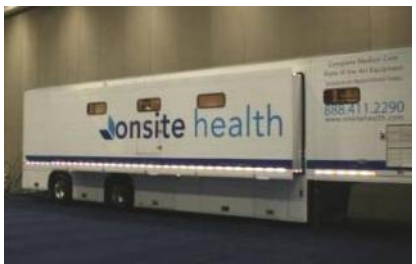
Onsite Health provided the mobile clinics for dental treatment.

Based on the 80th percentile UCR fees for the San Diego region, we furnished approximately $80,000 of dental services, and treated 123 patients over the 1-1/2 day event. Volunteers