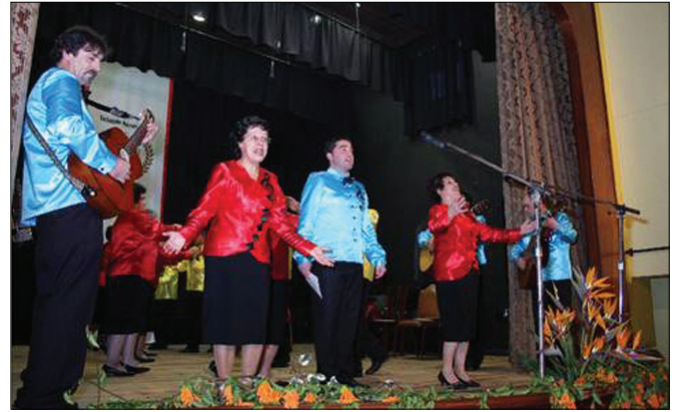
A group of musicians entertain audience members during the 2010 Carnaval at Casa do Povo dos Biscoitos.

As a reminder, personnel should keep tax records for a minimum of 7 years. Anyone interested in using the VITA rep program to file their tax return for free should contact their unit VITA rep or the base legal office to make an appointment.