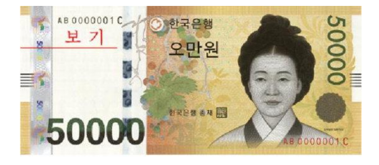
50,000 won (approx. $44.5)