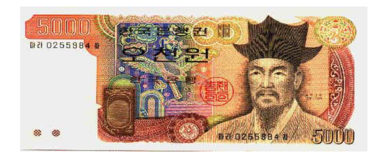
5,000 won (approx. $4.46)