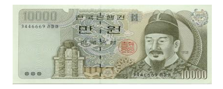
10,000 won (approx. $8.9)