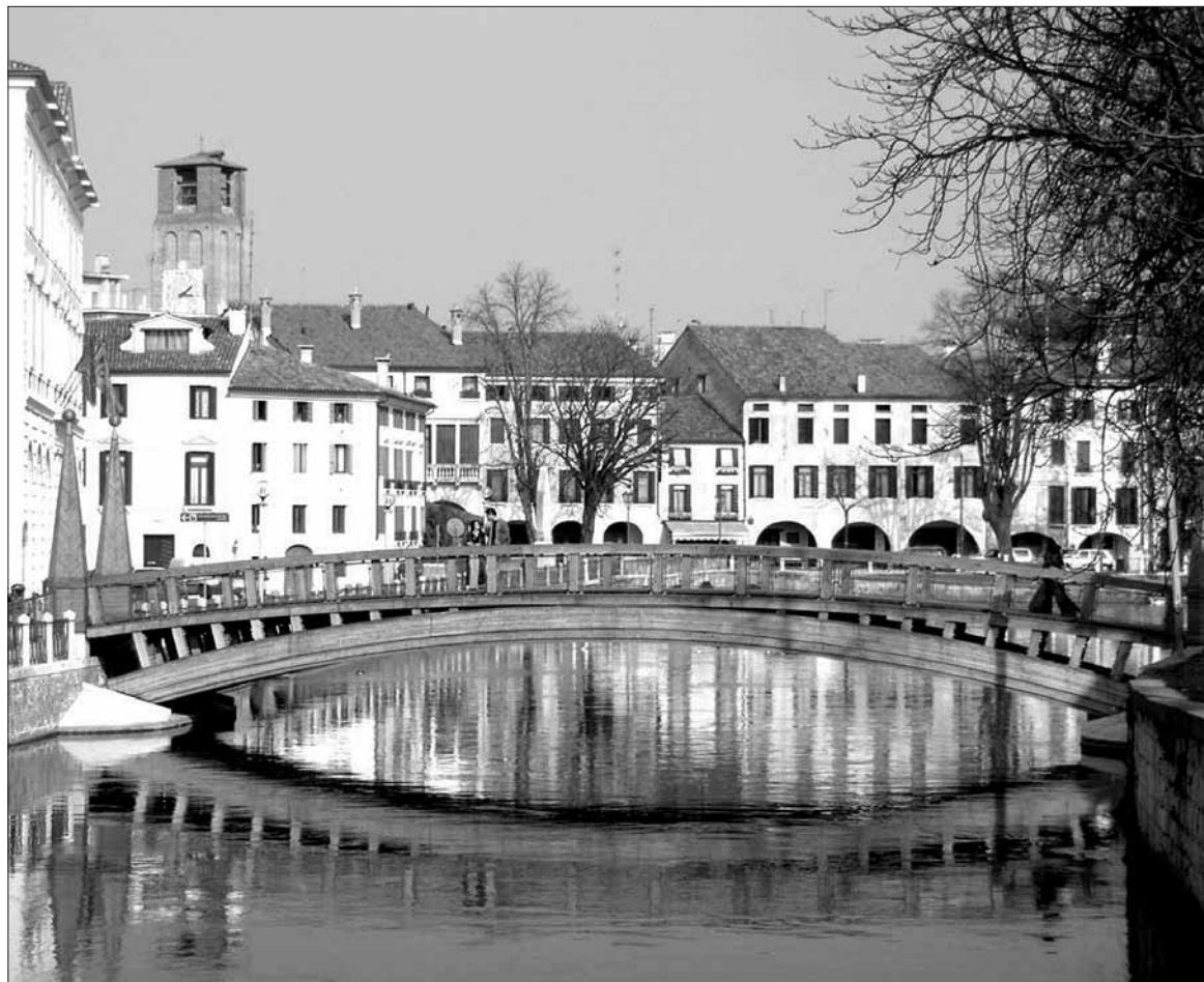
This is the Riviera Santa Margherita , a quarter near the historical center. Visitors may take a short walk from here and reach the heart of the city Piazza dei Signori and also Casa dei Carraresi , a palace which houses the exhibition "Genghis Khan and the Treasure of the Mongols".

Open weekdays 9 a.m.-1 p.m.; 2-4 p.m.; 8-9:30 p.m. Sundays: 10 a.m.-12:30 p.m. and 2:30-9:30 p.m. Entrance is free.