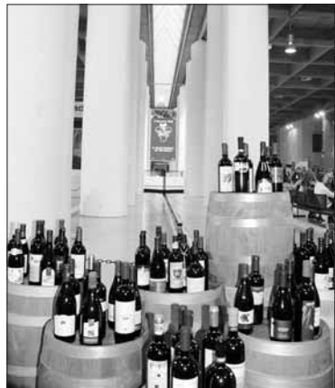
Some of the bottles on display at the Salone Nazionale del Vino Novello, which opens the season of this wine on Nov. 5 every year.

In Vicenza's exhibition grounds, on Nov. 5, the national New Wine Salon will be held. Open 10 a.m.-8 p.m. entrance is free.