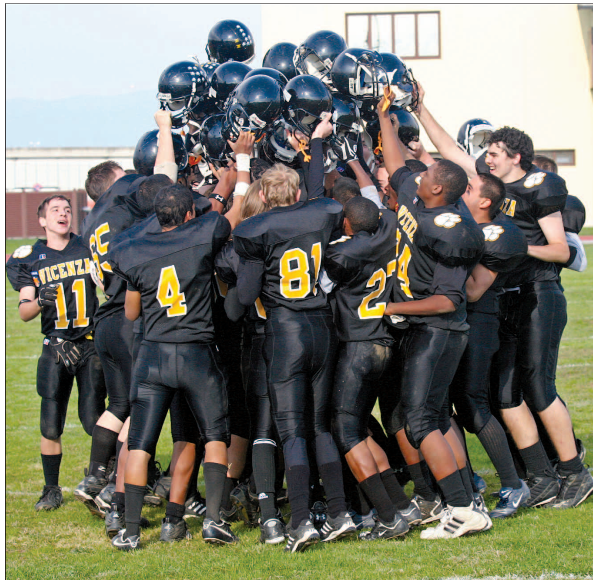
Cougars rejoice after a final home victory against the Bamberg Barons, stopping an eight-year losing streak in a 17-0 game. This victory propels them to a Division III playoff berth against Baumholder.

Although advancing to the Division III playoffs for the first time in eight years, the Vicenza Cougars ended their season losing to Baumholder Oct. 27, 26-19.