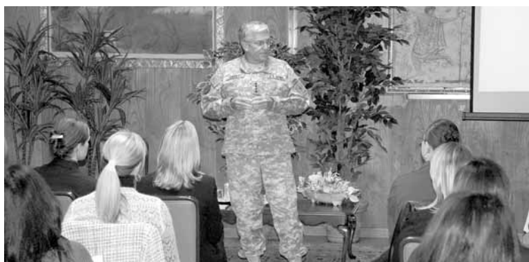
Gen. George Casey addresses the Vicenza Family Readiness Group

"The whole fair was a great opportunity for VHS students. We rarely get the opportunity to meet with many different colleges. But this time we actually got to meet them all at once," she said.