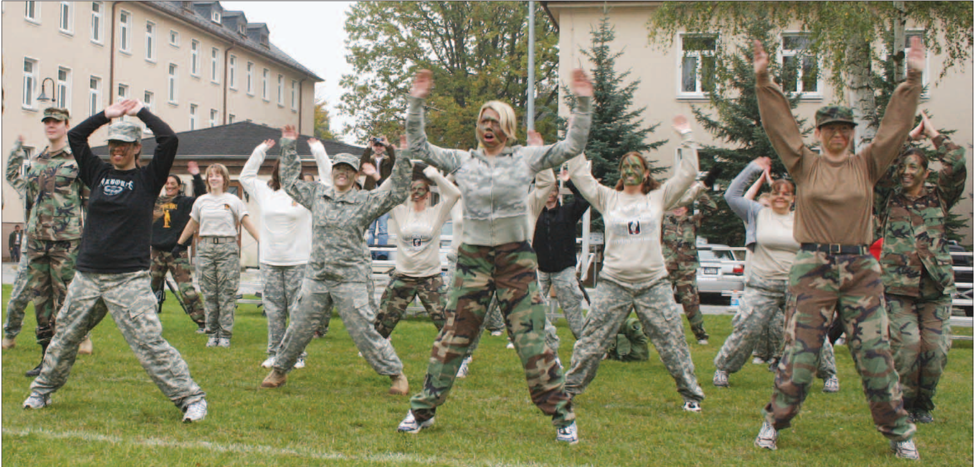
173rd ABCT spouses show just how Hooah they really are as they tackle group physical training drills at the brigade parade field on Warner Barracks, Bamberg, Germany.