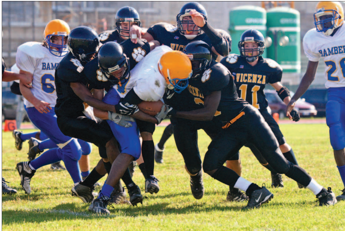
Vicenza Cougars' defense topples a Bamberg back in a swarm tackle for a loss of down.

"Last season during the coaches comments after we lost it was so