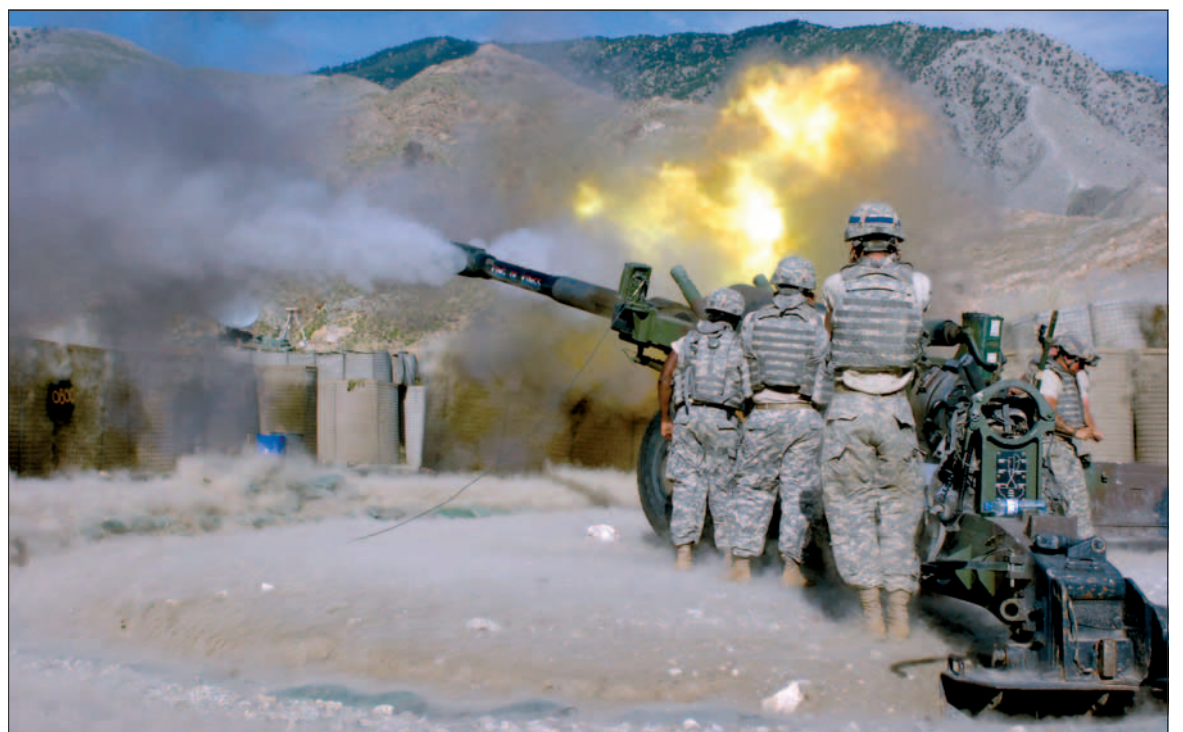
Bravo Battery, 4th Battalion, 319th Field Artillery Regiment (Airborne), fires a 155mm howitzer at Camp Blessing, Afghanistan. Numerous enemy contacts have ended with rounds fired by this particular battery.

When this happens paratroopers call for indirect fire support from 155mm howitzer gun teams based out of various Forward Operating Bases in the area.