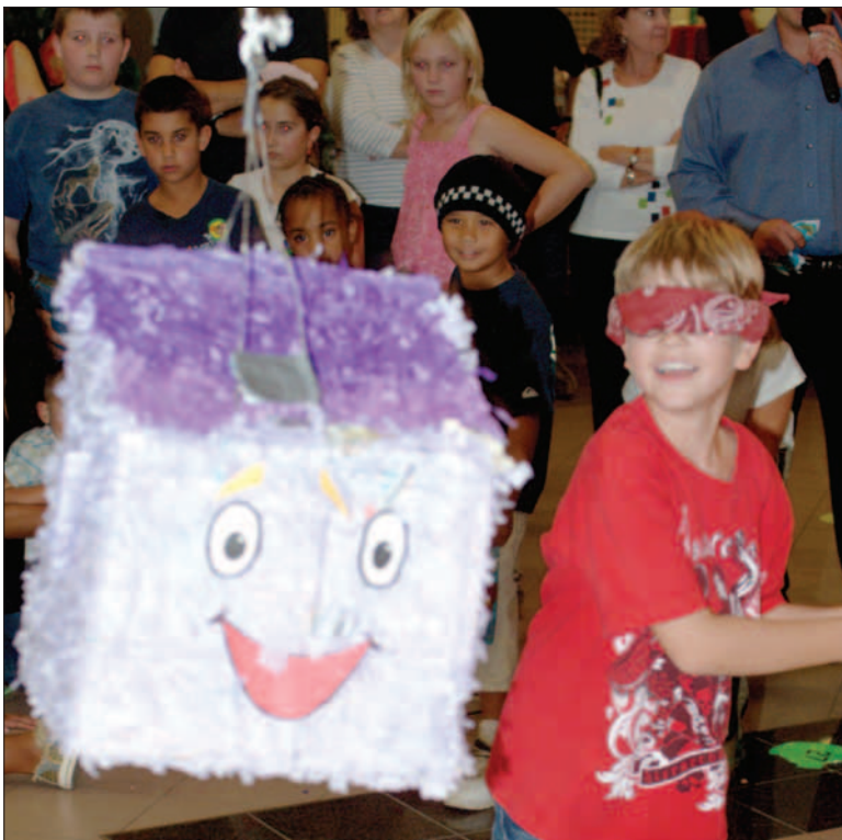
A young boy swings blindly at a piñata. Once the piñata was broken children dashed wildly to pick up the candy and toys.