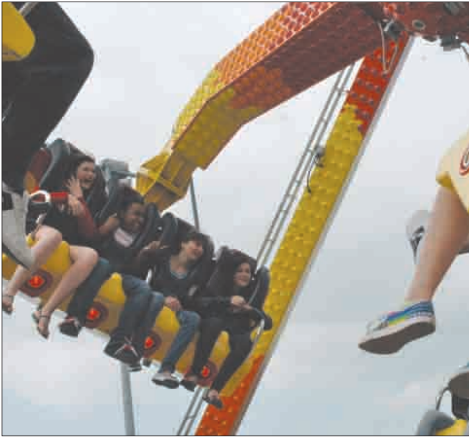
Carnival ride: One of the popular attractions to the Welcome Home celebration was carnival rides. The main stage also featured performers all day with different types of music.