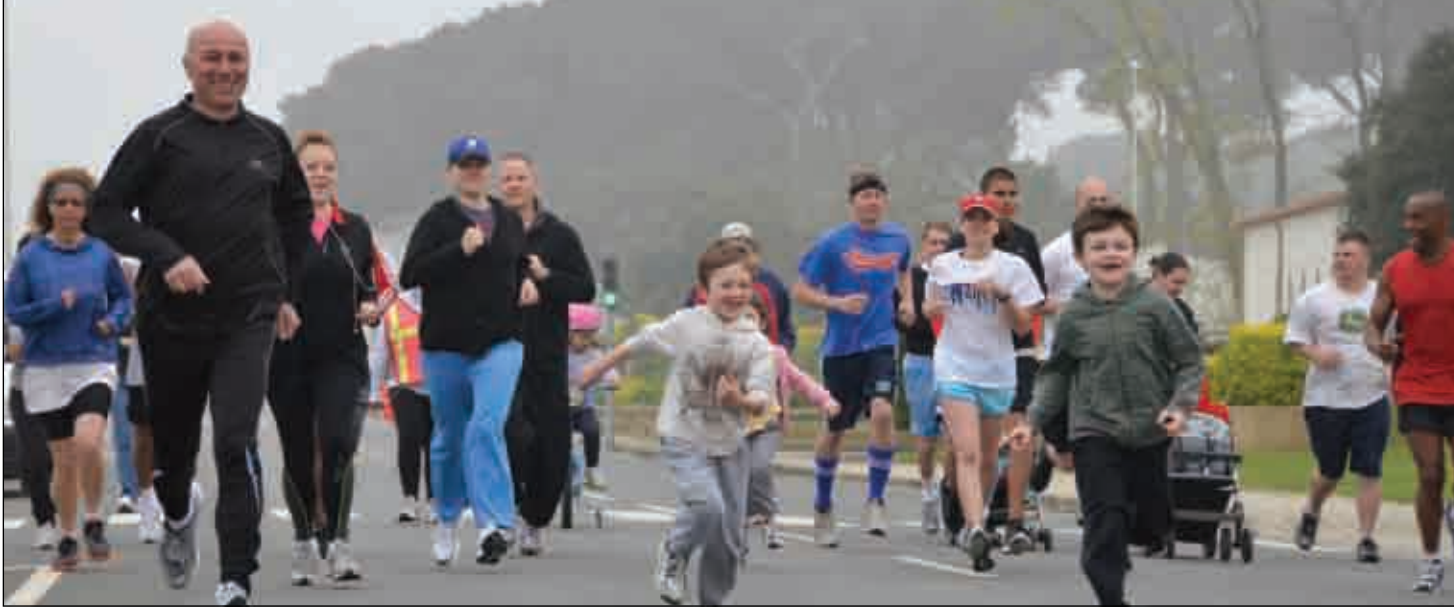
Camp Darby community members take off at the April Fools' 5 kilometer Fun Run Saturday.