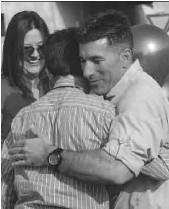
Families and friends welcome home U.S. Army Africa Soldiers upon their return March 31 to the command's headquarters in Vicenza, after a shipboard deployment on the USS Mount Whitney in support of Operation Odyssey Dawn.