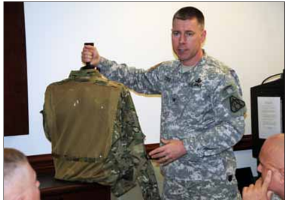
During a media roundtable, Sept. 16 at the Pentagon, representatives from PM Soldier Protection and Individual Equipment unveiled two uniform camouflage patterns that will soon be tested in Afghanistan.

agency responsible for developing the uniforms, will additionally test the efficacy of several other camouflage patterns in Afghanistan — though those will not be handed out to Soldiers there.