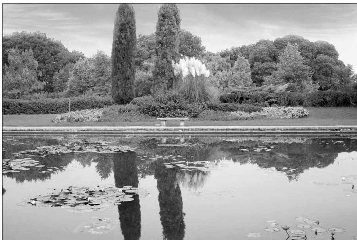
The lagoon at the Sigurta Gardens is a tranquil place to visit.

Directions from Vicenza 80 km: Autostrada A4 exit at Peschiera del Garda the park is located approx. 8 km from there. The park will close on Nov. 5.