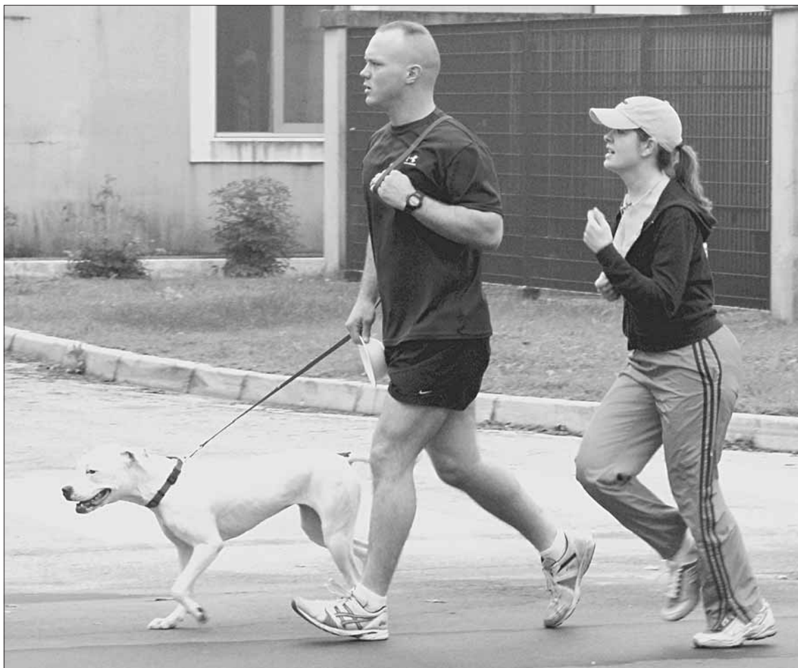
Remember to always keep your dog on a leash, on or off post, and no dogs are allowed on any MWR fields.

Let's look out for both the safety of each other and our pets. Pet owners will be held responsible.