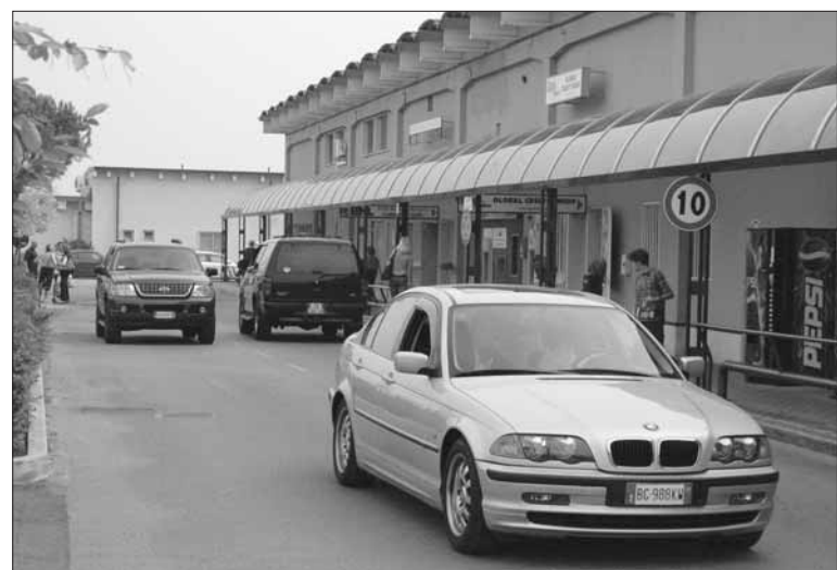
Slow down to 10 kmph in the area of the schools and Post Exchange. Handicapped parking areas are for designated personnel only. They are not drop-off zones.

Also, keep in mind that dogs are not allowed at MWR fields, regardless if they are on leashes or not.