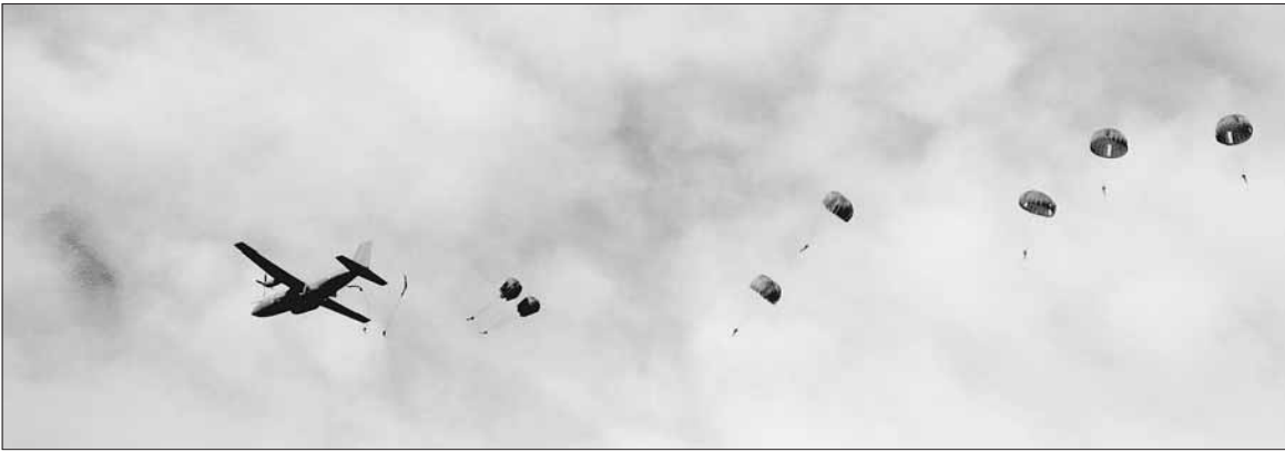
(Above) Paratroopers exit the C-160 Transall, while (Below) a member of the Tricolore makes a landing.