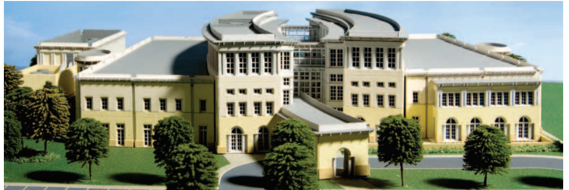
Site preparation on Caserma Ederle for the Enhanced Health Services Center begins this week.

wanted to assure soccer moms that the tournament scheduled for Oct. 27 will be permitted to take place on the sports field as planned. A multipurpose sports field being built in the North 40 between the eco center and the prison should be ready for use in