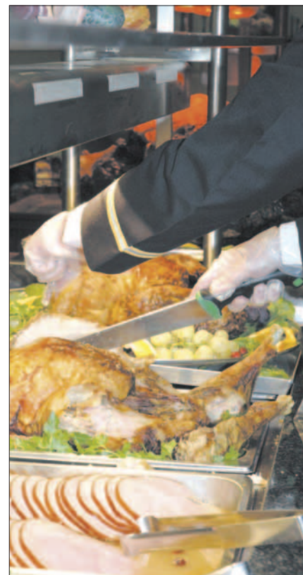
Senior leaders will be on hand to serve Thanksgiving dinner to Soldiers and their families at the Club Veneto this year on Caserma Ederle.

This year's meal features: roast turkey, glazed ham, roast beef, grilled steaks and crab legs; served along with cornbread dressing, brown and giblet gravy, sweet potatoes, shrimp fried rice, mashed potatoes, potato salad, vegetables, salads and desserts, a real family style celebration dinner.