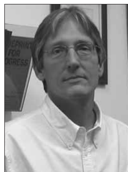
Army Substance Abuse Program

Vicenza and Darby hours: Mon-Fri, 8 a.m.-5 p.m., closed noon-1 p.m. Located in Bldg 163 on Caserma Ederle Phone: 634-7554, 0444-71-7554 Bamberg: Mon-Fri, 7:30 a.m.-4:30 p.m. Located in Bldg 7251 Phone: 469-1710/ 0951-300-1710 Schweinfurt: Mon-Fri, 7:30 a.m.-4:30 p.m. Abrams Center, Bldg 444, second floor Phone: 354-1710, 0972-196-1710