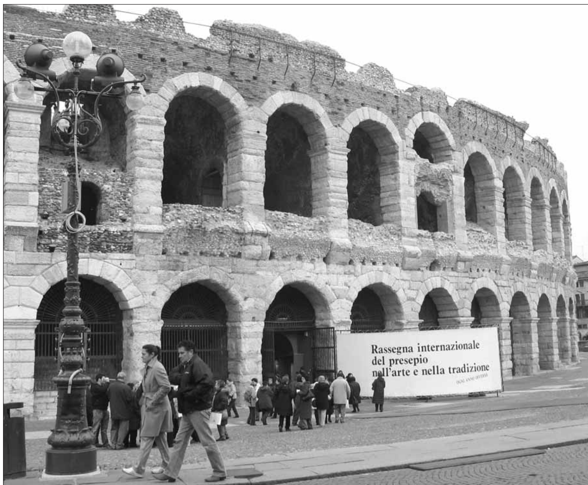
(Above) The entrance of the "Rassegna Internazionale del Presepio", or International display of the Nativity Scenes, an annual exhibit that takes place inside the Arena in Verona. The show, which is at its 24th edition, features about 400 nativity scenes from around the world. (Below, left) A scarlet Ibis is one of the many attractions at the Parco Faunistico Cappeller in Cartigliano.

Runners come from all over the world to compete and last year there were over 6,000 foreign professional runners in the marathon. The marathon starts at 9 a.m. in Piazzale Michelangelo. Information and enrollment in English from www.firenzemarathon.it