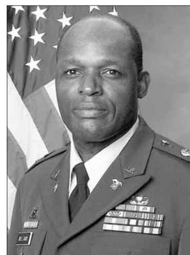
Chain of command or supervisor

Vicenza: Davis Soldier & Family Readiness Center, Bldg 108 Mon-Fri, 8 a.m.-5 p.m. Military & Family Life consultant - 24/7: 333-489-8967 Livorno Mon-Fri, 8 a.m.-5 p.m. Bldg 407 Bamberg Mon-Fri, 8 a.m.- 5 p.m. Military & Family Life consultant: 469-9194 or 0175-600-8373 and 0175-253-3020 Schweinfurt Mon-Fri, 8 a.m.-5 p.m., 354-6933, 09721-96-6933 Bldg 242, Ledward Barracks Military & Family Life consultant: 0175-379-4691, 0151-100-23585