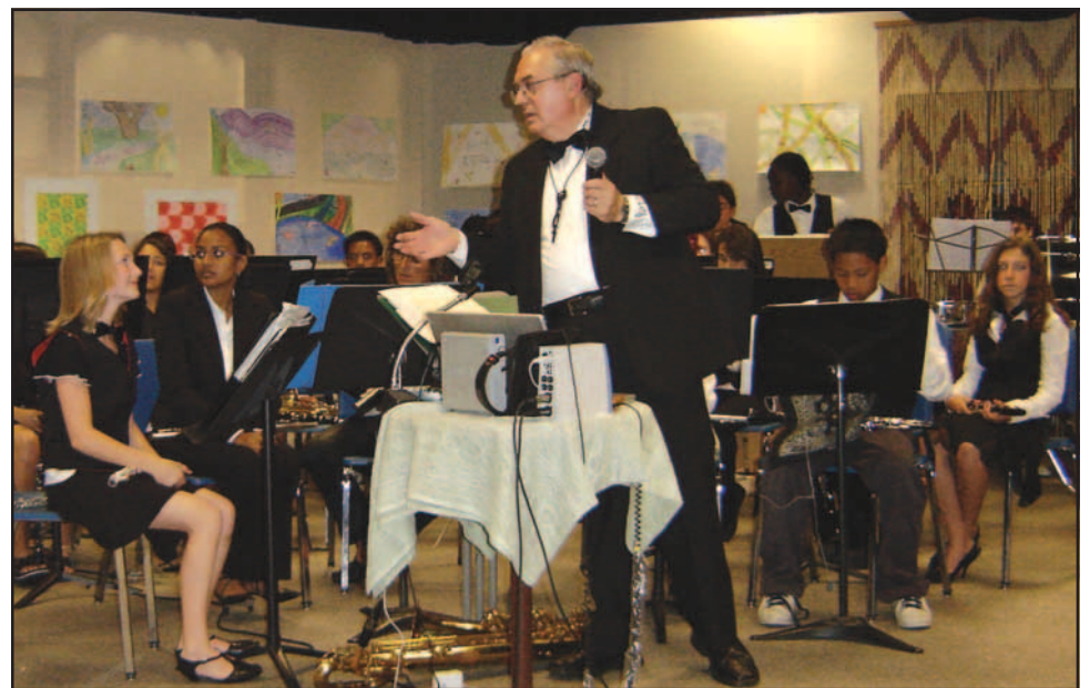
Livorno Unit School band holds its last spring concert. Livorno High School is scheduled to close at the end of the school year.

The original decision to close the high school was announced in 2005, but when London Central High School announced it