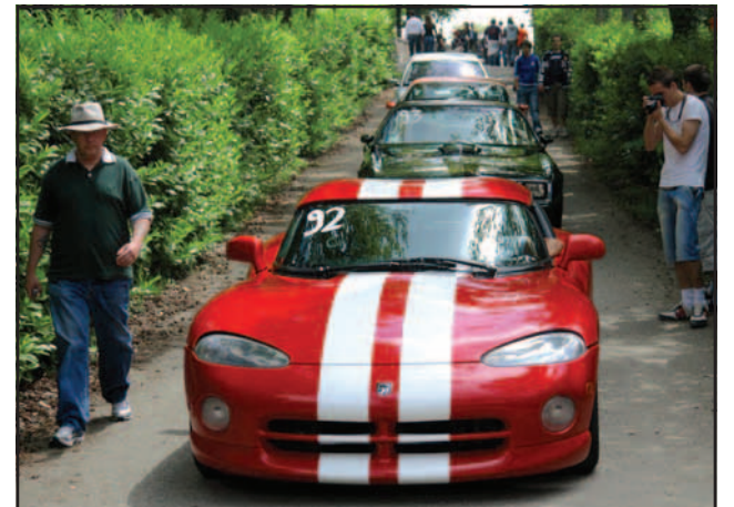
A Dodge Viper, a true American muscle car, has a V-10 motor, lots of horse power and a seat-of-the-pants thrilling drive, safely leads the way through a mountain path to the 3rd Annual All American Car Show outside of Florence.

Unlike most car shows where you pay a fee to compete for trophies, this was a free event. Everyone in the town went out of their way to make sure visitors had fun and were relaxed. Children sold crafts and sandwiches at make-shift tables as a band pumped out rock-n-roll Jerry Lewis tunes.