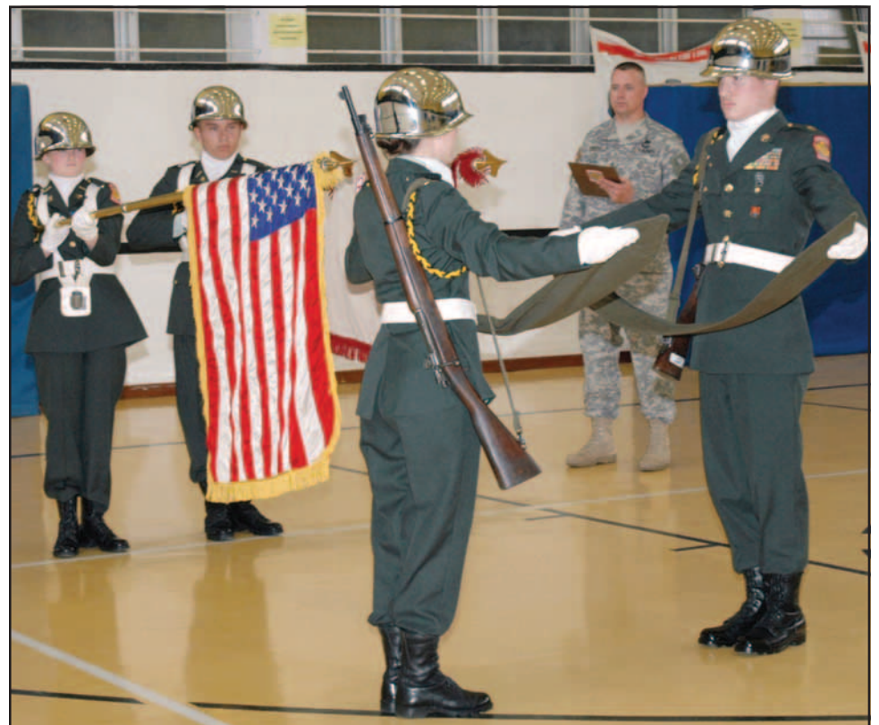
(Above) Cadet 2nd commands the Color Guard during the drill.

The Vicenza team also competed in the European Drill Championships conducted in Ansbach, Germany, on May 19.