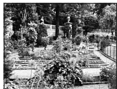
A view of one of the many gardens at the Orto Botanico in Padova.

The garden features more than 6,000 plants including ponds with water lilies, cactus, ferns, trees