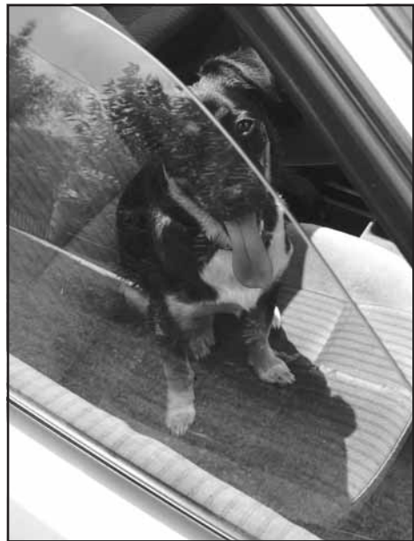
When the temperature outside reaches 93F, it only takes 20 minutes for the temperature inside the vehicle, even with the windows cracked, to reach 120F. Don't do this to Spot; leave him at home.

Don't let the death of any child in this community be the wake up call to change our busy lifestyles.