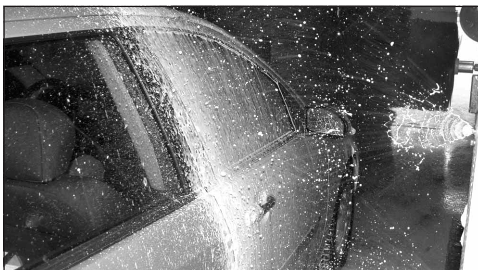
All vehicles shipped stateside must meet U.S. Department of Agriculture inspection requirements, especially cleanliness.

"Many European companies claim they can convert European-spec POVs to U.S. specifications while the POV is still in Europe," Schott said. "These claims are false."