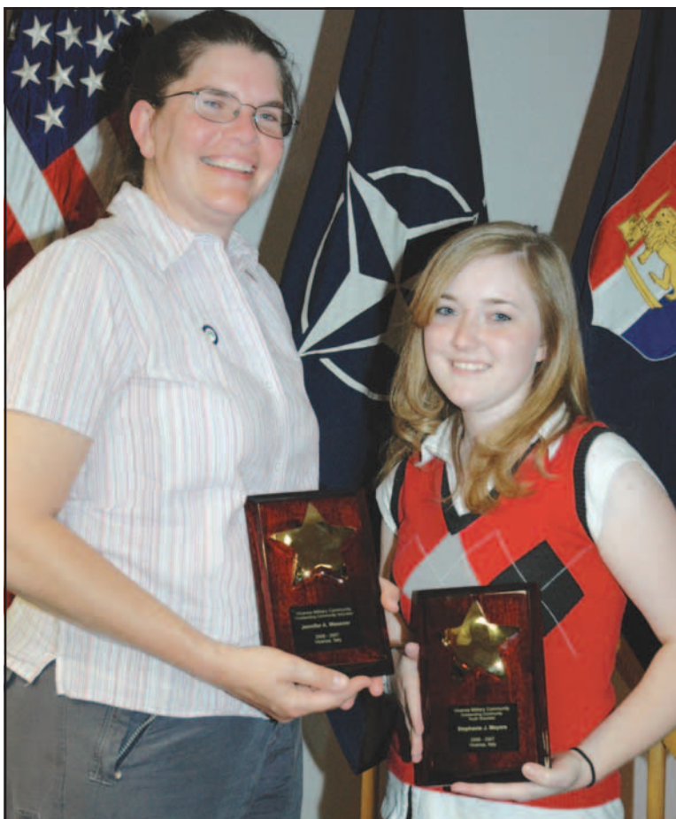
The USAG Vicenza Adult Volunteer of the Year and USAG Vicenza Youth Volunteer of the Year, with the awards they received during the Volunteer Recognition ceremony held May 9.