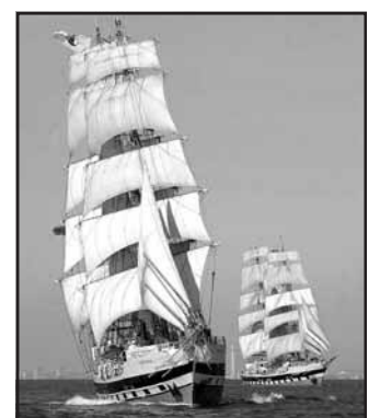
Camp A.R.M.Y. Challenge Tall Ship Adventure for youth in grades is held July 27-Aug. 1.

2007 school year) whose active-duty Army, Air Force, Navy, or Marine parent deployed between June 1, 2006, and February 28, 2008, are eligible to apply. Complete information and the application form for Camp A.R.M.Y. Challenge are available online at www.mwr-europe.com . Applications are accepted online only.