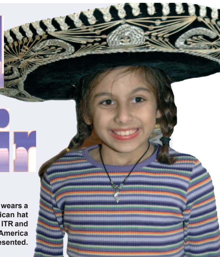
(Right) A child wears a Sombbrero, a Mexican hat while visiting the ITR and USO where North America was represented.