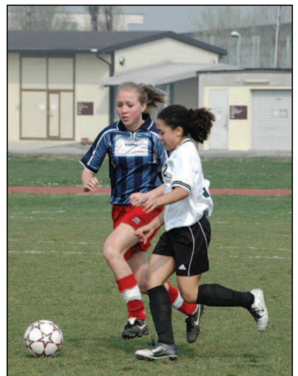
The VHS Cougars met Naples at home Saturday. Results from those games were: Vicenza Boys 0, Naples, 5; Vicenza girl's 1, Naples 0.

The next games will be played in Milan, Rome and Aviano. There will be another game on the North 40 on May 12 versus Milan. May 16-19 May the European Championships take place in Germany.