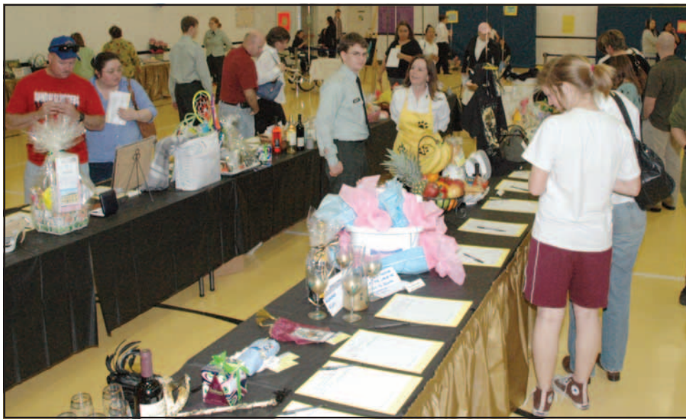
(Above) Community members crowd in the Vicenza High School gym to participate in the Silent Auction hosted by the VHS Booster Club March 16. More than 100 items such as bicycles, food, wine and theme baskets were auctioned off. More than $4,800 was raised by the auction. Proceeds go to purchase items for the Vicenza sports teams. (Right) A VHS student and also a volunteer at the event, helps auction off the football autographed by Indianapolis Colts kicker, Adam Vinatieri, at the Silent Auction.

When the auction ended, the amount raised was more than $4,800.