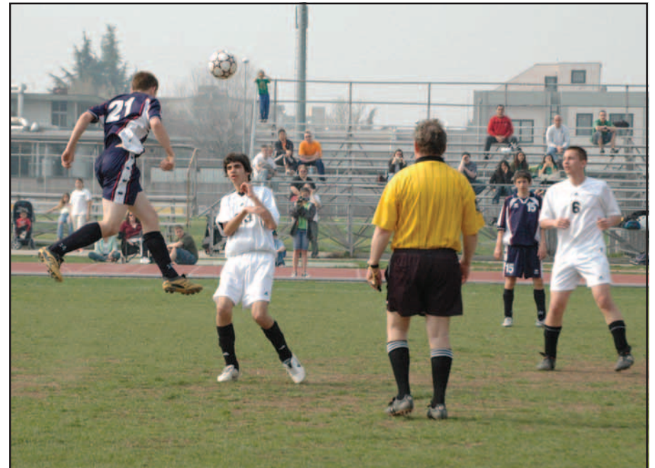
(Above) Vicenza High School Cougar #6 tries to block a high-flying kick from an Aviano player. Looking to help back him up is #23. Both boy's and girl's soccer teams took on Aviano March 17 at home. The boys tied Aviano 1-1. (Right) Vicenza girl's soccer player (right) tries to beat an Aviano player to the ball during their meet March 17. The girls lost to Aviano 0-1. Unfortunately, the game played by the Vicenza Girls Soccer team was interrupted toward the end of the second half when some player's were injured.