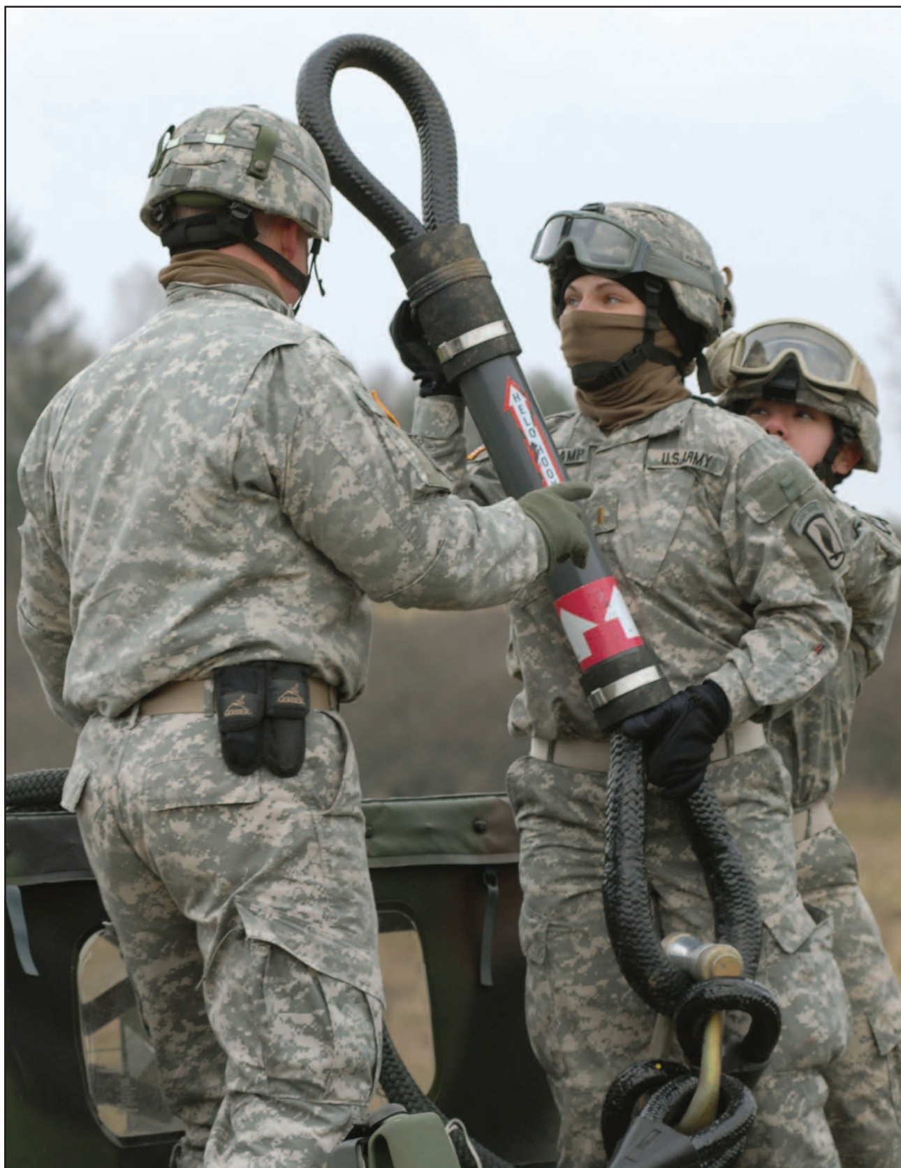
Paratroopers from the 173d Airborne Brigade Combat Team, Combat Support Battalion, took turns performing a single-point hook up during a training exercise at Hohenfels Training Area. The large hook is connected to the bottom of a Blackhawk helicopter to hoist the Humvee off the ground.

In usual scenarios, Chinooks are commonly used for transporting Humvees, but in the training exercise, Blackhawks were more accessible. Also, even though Alpha Company is composed primarily of airborne-qualified soldiers, no aircraft training is required to participate in a sling loading exercise. The only requirement is a Pathfinder or Air-Assault qualified non-commissioned officer be present to provide the instruction.