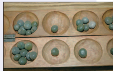
(Above) Detail of Uril, an African game from Cabo Verde. It was one of the items on display at the post library, which housed Africa.