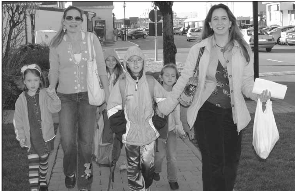
Community members take advantage of Walk your Kids to School day.

School Liaison Officer (Free and reduced lunches, Bright eyes, etc.), 634-5998.