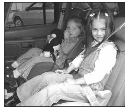
Two youngsters sit in appropriate car seats.

If you need clarification on the regulations above, want more information on car seats, or want to know to how to properly install your car seat, call MP station operations section at 634-8891 or off post at 044-471-8891.