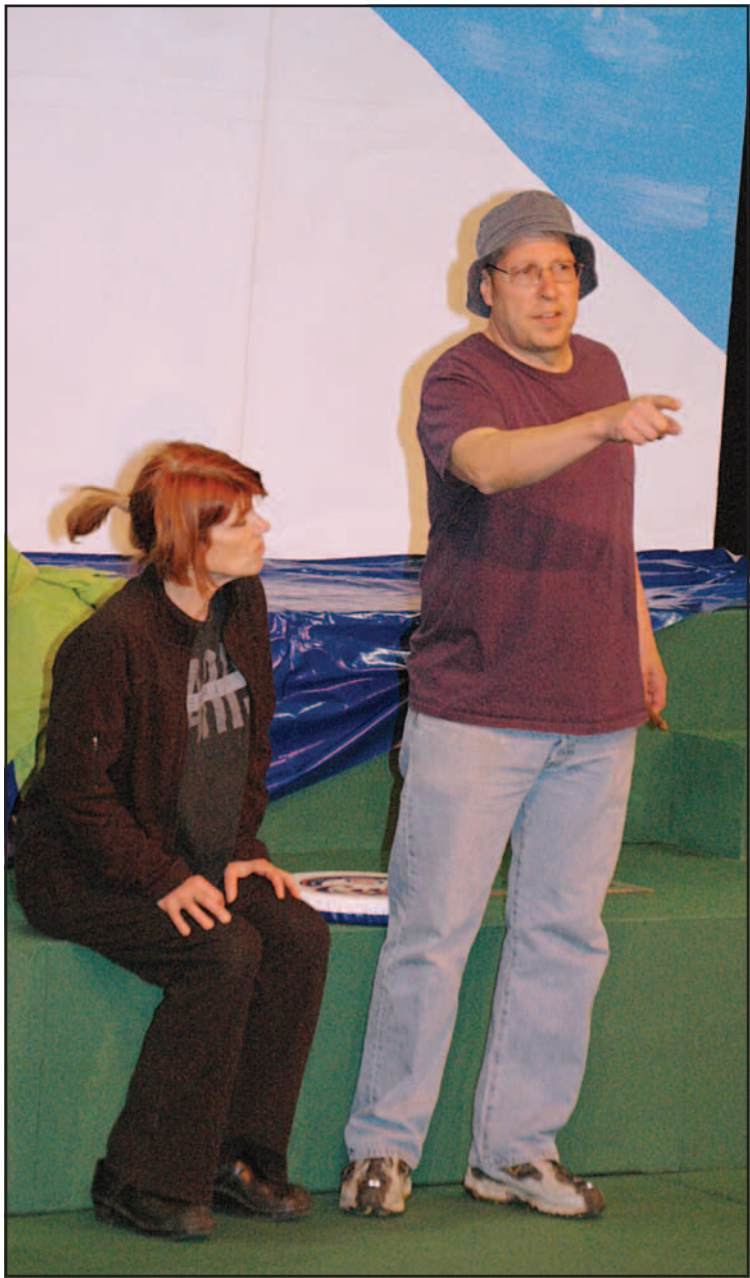
(Above) Two of the cast of the Soldiers' Theatre production of "Bleacher Bums" rehearse. This version of the play is the revised 1998 version, which includes a typical game between the Cubs and their arch-rivals, the St. Louis Cardinals. Players they react to include Mark McGuire and Sammy Sosa who had a major impact on the game during this time period. (Right) The actors rehearse lines while another member paints the backdrop to resemble the bleachers of Wrigley Field. "Bleacher Bums" opens Friday and tickets are on sale now. Call Soldiers' Theatre at 634-7281 for details.