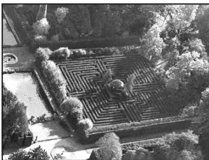
Aerial view of the maze at Valsanzibio gardens.

Valsanzibio is located 36 km from Vicenza, before you visit the gardens check out the map and get directions from www.valsanzi.biogiardino.it