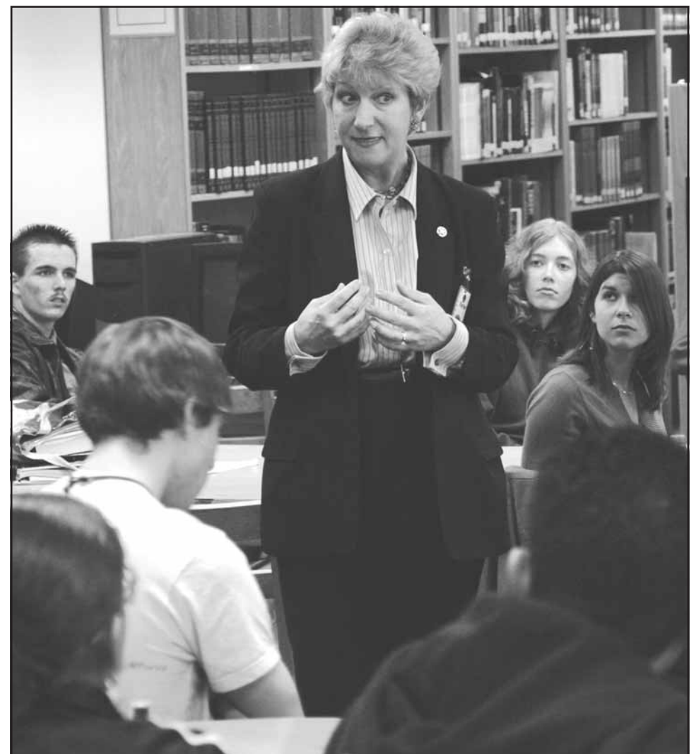
A Secret Service special agent, speaks to the senior class of Caserma Ederle High School on March 12. Representatives from the Secret Service and the Drug Enforcement Agency were at the school to speak to the kids about job opportunities in the government.