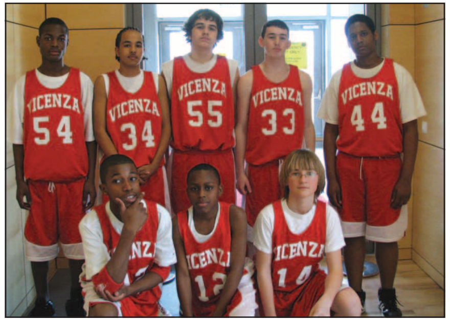
Child and Youth Services youth sports team the Vicenza Rockets. The youth took second place in the IMCOM-Europe Basketball tournament March 10-11 in Weisbaden, Germany.