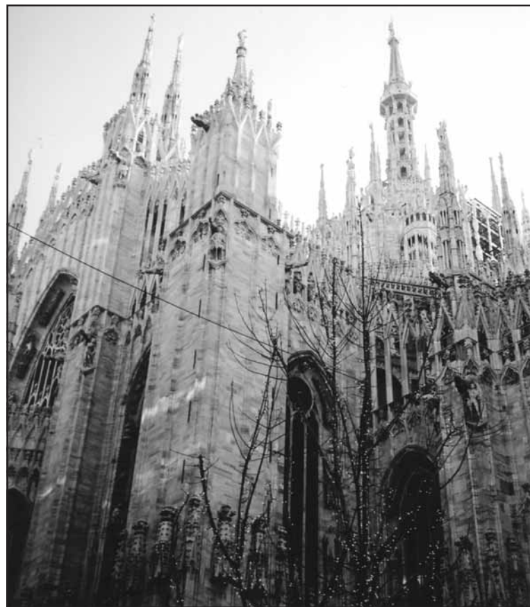
Milan's fairy-tale Duomo.

Only small groups are allowed inside at a time and only for 15 minutes. Cost is about 8 euro.