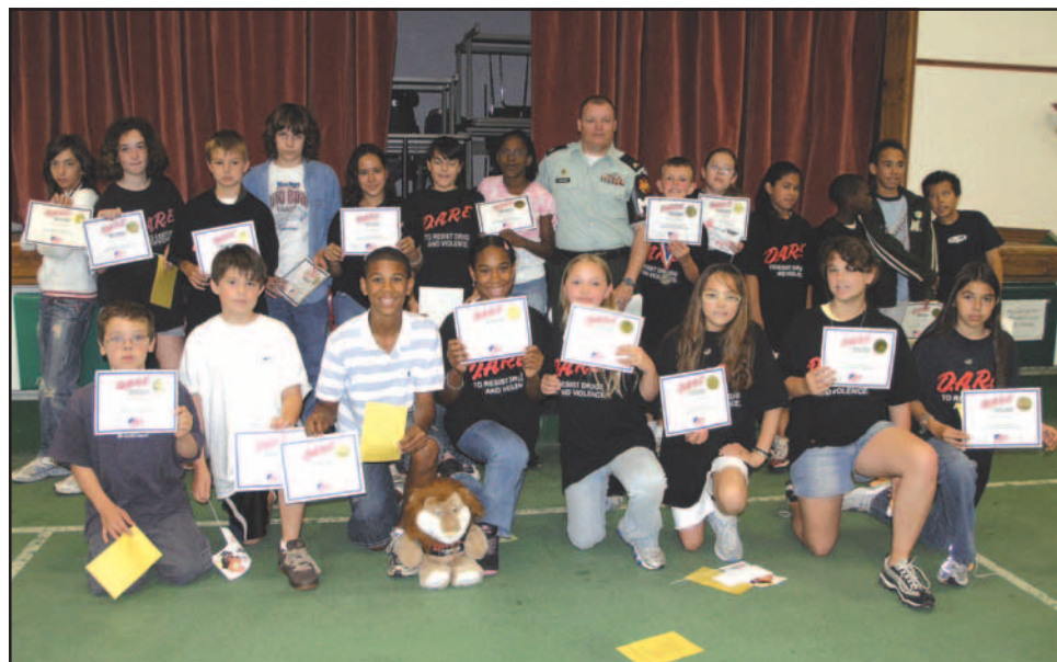
Livorno Unit School 5th and 6th graders proudly show the diploma they received upon completing the D.A.R.E. program.

"Only by building a strong trust and loyal