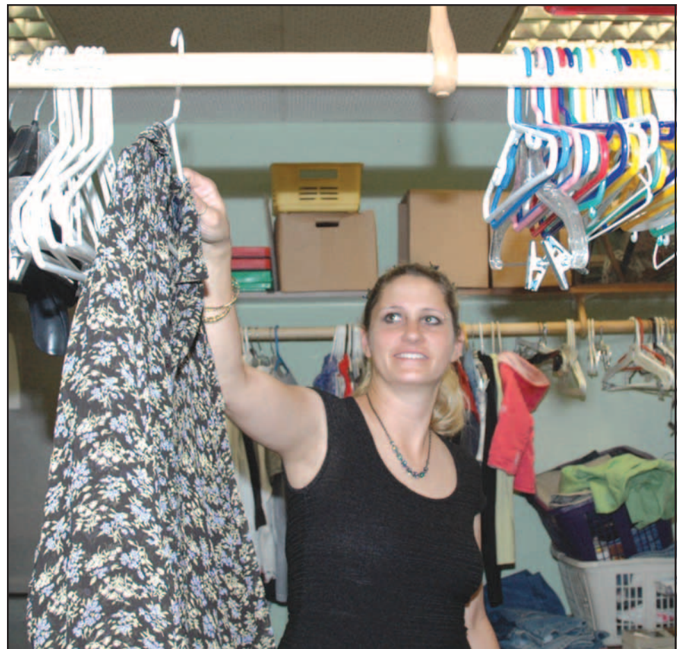
A volunteer arranges clothing items consigned at the VMSCC Thrift Shop. She is one of many volunteers who dedicate their time sorting, pricing and putting merchandise out on the floor to be sold.

However, if you have large items like furniture, call to set up a drop-off time. That way the item can be placed directly into the store for a faster sale. Please to not place garbage in this area.