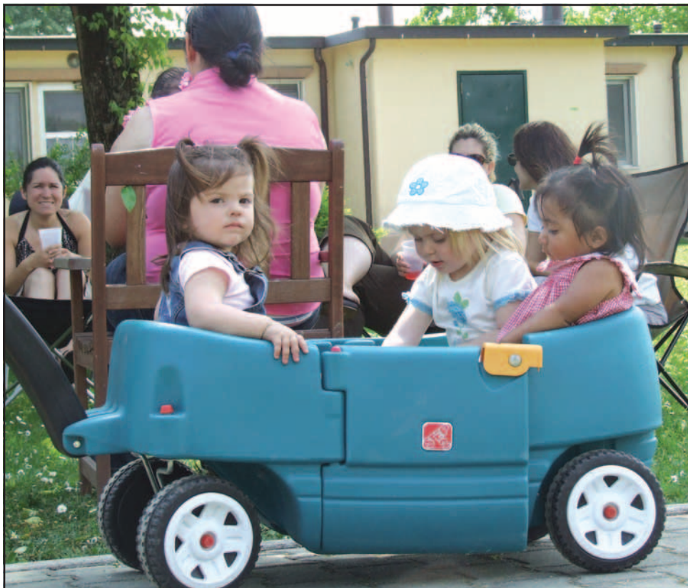
Little girls play in a toy cart during a MOMS Club Park Day on Caserma Ederle. Park days are held several times a month at different locations.

interests of the participants such as a book-sharing club, an exercise group, a toy and clothing swap, Moms Night Out, Toddler music group, Infant playgroup, Toddler playgroup and Preschool playgroup.