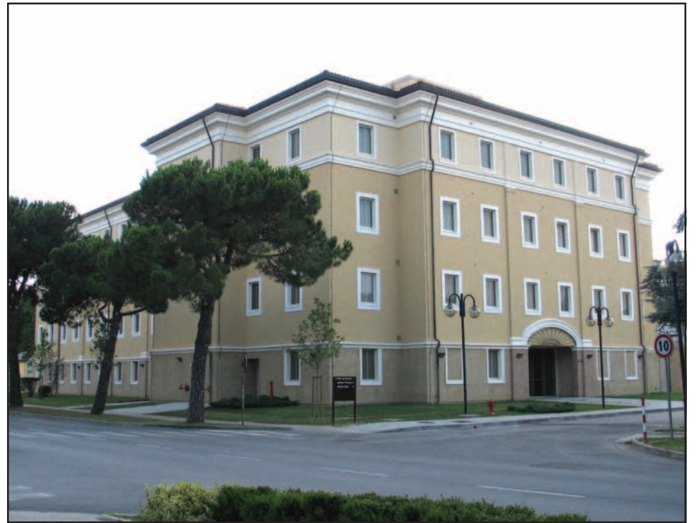
Above is one of two new LEED-certified barracks built for the 173d Airborne Brigade Combat Team Soldiers.

automobile use and the associated energy consumption and exhaust pollution."