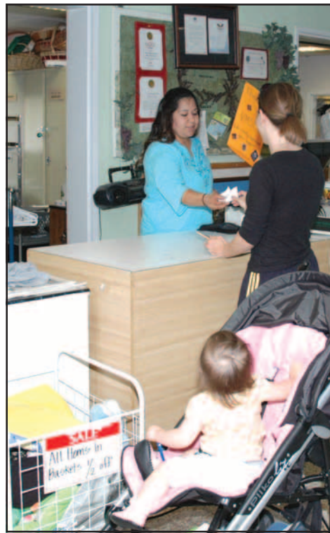
A Vicenza Military Spouses and Civilians Club Thrift Shop cashier helps a customer during operating hours.

At the back of the Thrift Shop (in the shoppette parking lot) there is a wooden storage shed used to house all of the donations to the Thrift Shop. Donations can be dropped off at any time.