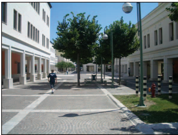
Above is an artist's rendering of a pedestrian-friendly area which reflects the downtown centers in Italian towns and cities that have pleasant walking areas where vehicles are frequently prohibited altogether to improve air quality and promote the well being of their residents.

"We're designing areas with perimeter parking in conveniently located multi-story garages and mall-like centralized green spaces with trees that encourage walking and bicycling," said master planner Frank Powell. "The campus-like areas and spaces help the environment by reducing