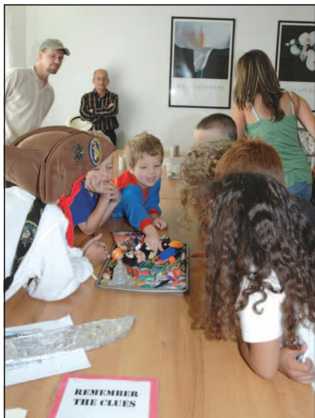
A child picks up one of the items to remember it while participating in Remember the Clues. Like the board game Concentration, the children looked at the objects for a specific amount of time, then the items were covered up and the children would have to list what items were on the tray. As a group, the children remembered more than 20 items and won individual prizes.

For questions about the Thrift Shop, call 634-7460.