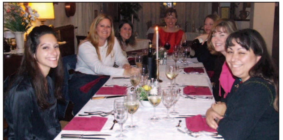
Members of the Moms Offering Moms Support (MOMS) Club enjoy a mom's night out. The club is open to everyone in the Vicenza community - even dads!

As part of their agenda, the club set up several activity groups to best meet the