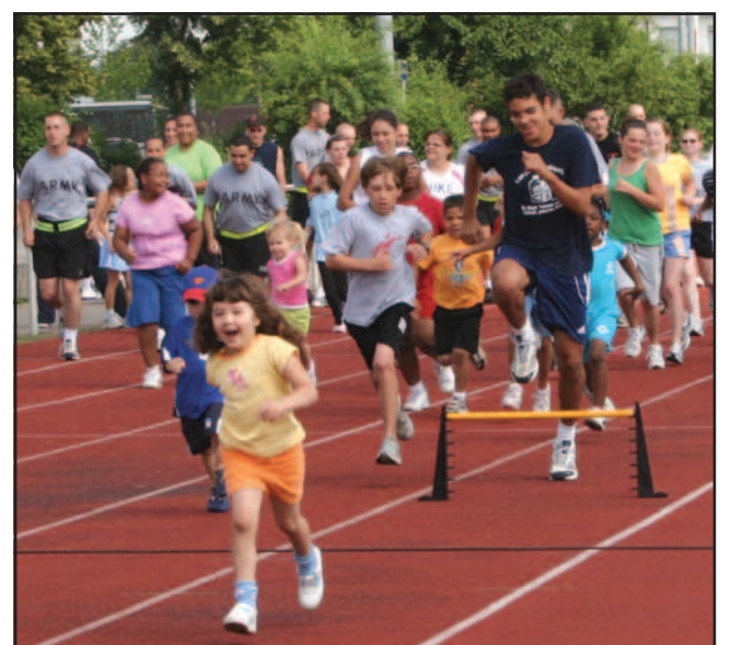
Bamberg community members take off for the one-mile run during a mock physical training test June 22.

A certificate of achievement was awarded to all participants and medals to all children. Any participants registered with the Operation Walk 4 Freedom were given 25 bonus miles for competing in the events that day. Planners hope this will be the first in a series of monthly events and activities for families of the deployed 173d Brigade.