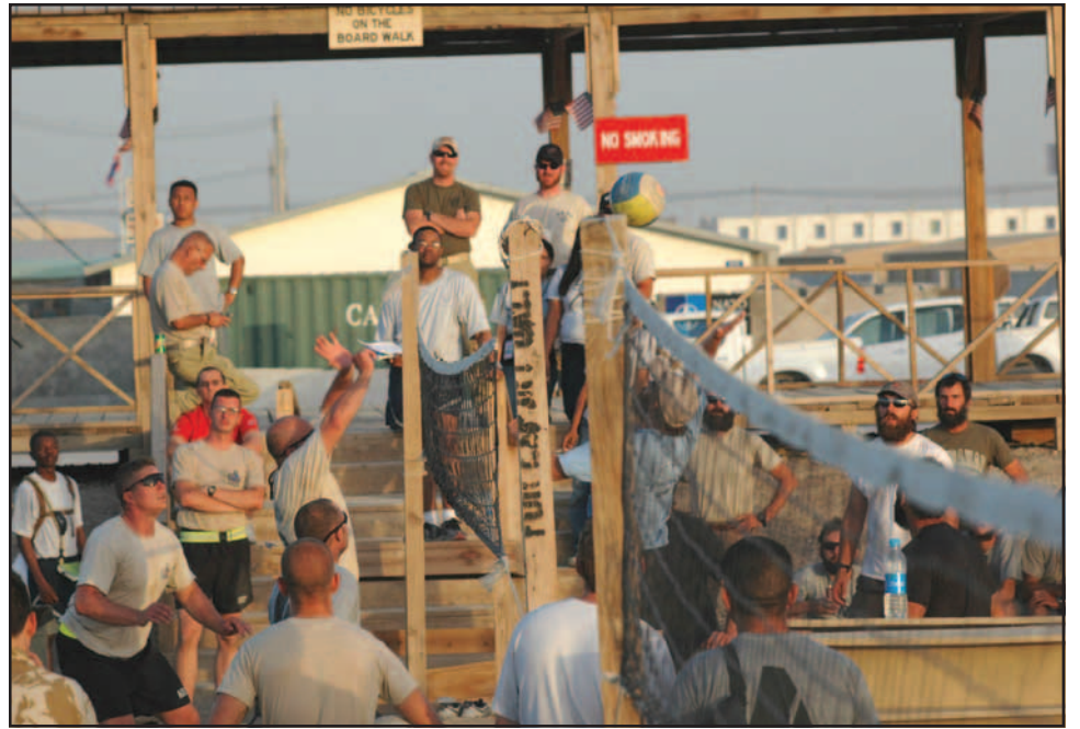
The competition on the volleyball court was as hot as the day for Soldiers from 1-508th Infantry (Airborne) and 82nd Airborne Division during the Fourth of July celebration held at Kandahar Airfield, Afghanistan. Servicemembers from the multi-nation installation participated in a day of events that included a pistol marksmanship competition, dunk tank, games and barbecue.