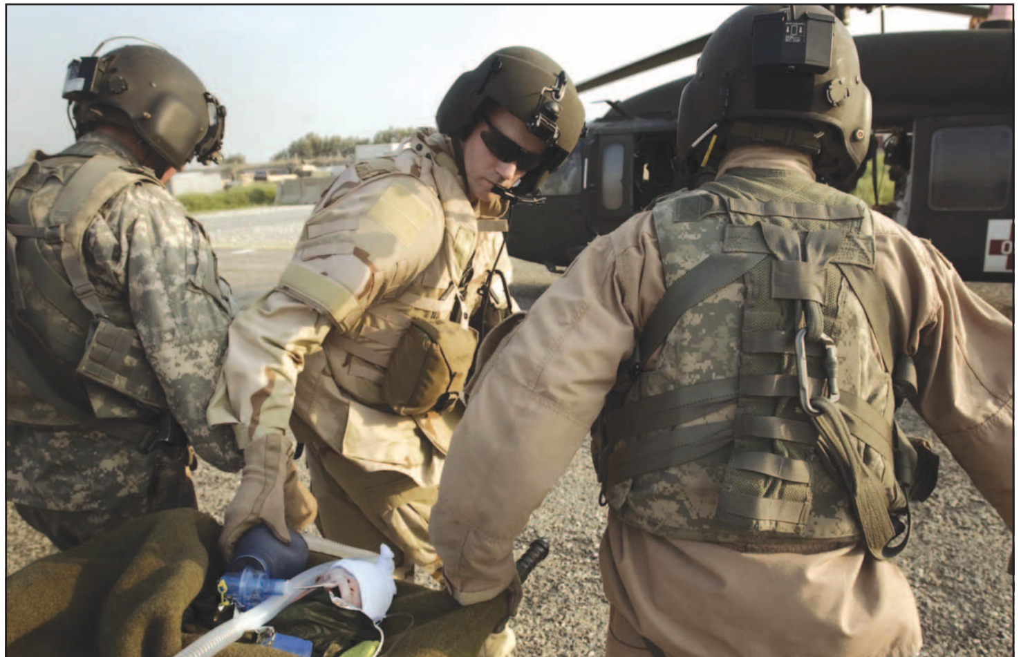
A medical evacuation crew from the 82nd Airborne Division picks up a four-hour-old baby boy and his uncle and transports them from the Jalalabad Airfield to the hospital at Bagram Airfield.