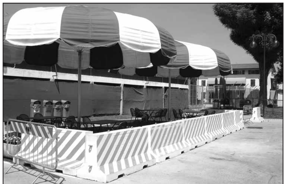
New additions to the Combat Water Survival Training pool on Villaggio include a seating area with umbrellas and Astroturf.

If you want bricks to beautify your home, please go to Self Help and fill out a form – don't take the bricks that have been allotted to other projects.