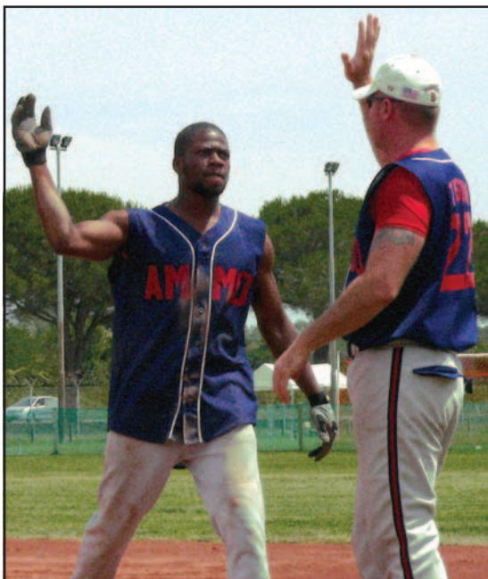
Members of the A-Team celebrates after they beat the Ramstein A-team at the annual Camp Darby Ammo bowl 40-22. The softball tournament brings Air Force teams from across Europe to Camp Darby during the Fourth of July celebration.