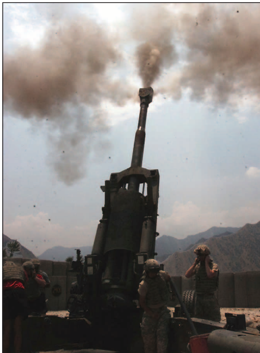
Paratroopers from 2nd Section, 2nd Platoon, Bravo Battery, 4th Battalion, 319th Airborne Field Artillery Regiment fire their 155mm Howitzer from Forward Operating Base Blessing in eastern Afghanistan in support of multiple troops in contact. In a few hours the battery had fired 111 rounds simultaneously supporting three separate sites. The "king of battle," as artillery is called, has become increasingly important, being called upon as soon as possible when troops find themselves in contact and also being used to fix the enemy, which has become as important as finding them. Everything from the incredibly unforgiving terrain to the ability of insurgents to disappear into the civilian population has made clear the significance of indirect fire support.

Unfortunately, despite all their efforts, the child passed away sometime later at the Bagram Airfield medical facility.