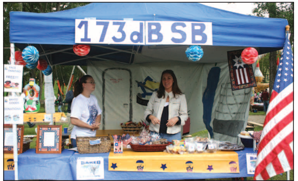
Spouses of Soldiers in the 173d Airborne Brigade Combat Team Brigade Support Battalion sell baked goods and other craft items at the Fourth of July celebration held at Friendship Park in Bamberg, Germany. Hundreds of people braved the mud, rain and hail to enjoy the festivities held July 4.