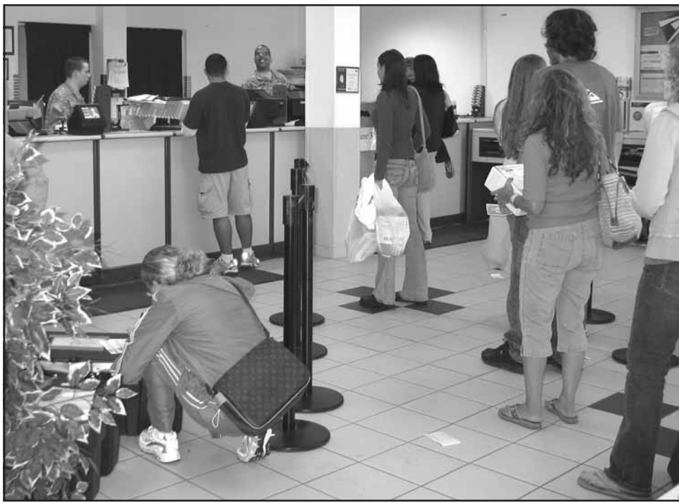
Caserma Ederle's Army Post Office is busy with Soldiers and family members mailing packages. The APO has changed its hours and is now open Monday-Friday 11 a.m.-6 p.m. Mail received after 4 p.m. will not go out in that day's dispatch, it will go in the next day's mail. Also, 4 p.m. is the cut-off for Registered or Express mail items.