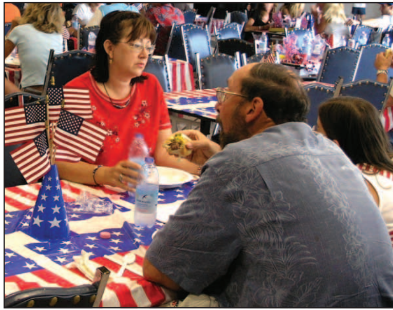
Bad weather doesn't dampen American spirits as they celebrate Independence day at Camp Darby's alternative site after a storm hit the beach.

"If you can believe it, there were high winds again on Labor Day in 2004," exclaimed Carpenter. "Sometimes the weather is crazy, look at today, 24 hours after the