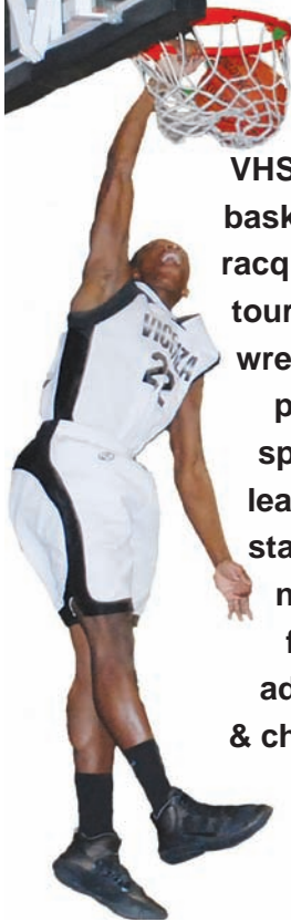
VHS Boys basketball, racquetball tourney & wrestling plus sports leagues starting now for adults & children

USAG Livorno page 5 Choirs treat Darby to Gospel Italian style & Tax Center to open Community events pages 6 & 7 Wedding expos, Medieval fest, ice skating & more Sports, page 8