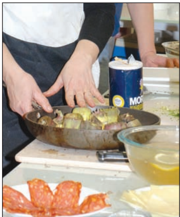
A peek at whose making news on Caserma Ederle

Speak Out: Steelers or Packers? Garrison News pages 2 & 3 Vicenza launches new website & Students spell their way to the top Page 4