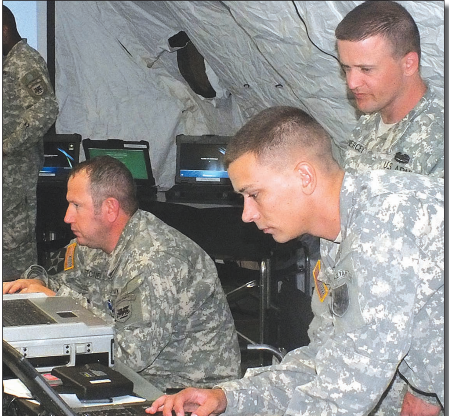
Members of U.S. Army Africa Contingency Command Post ensure communications and computer equipment is in working order during a deployment exercise at Aviano Air Base, recently.