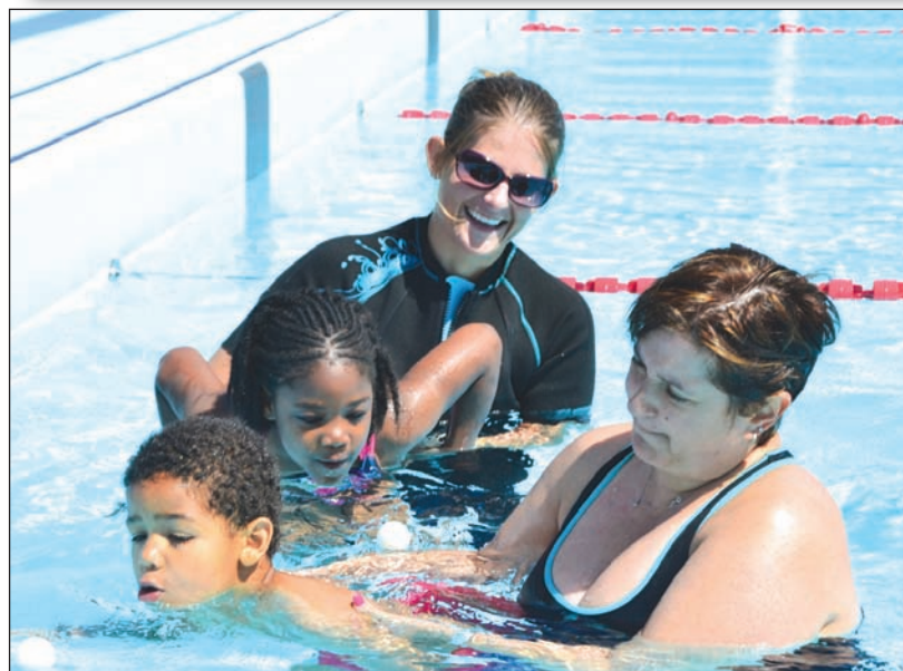
Above and at left, instructors work with children enrolled in swimming lessons through Child, Youth and School Services. For more information call 633-8084.