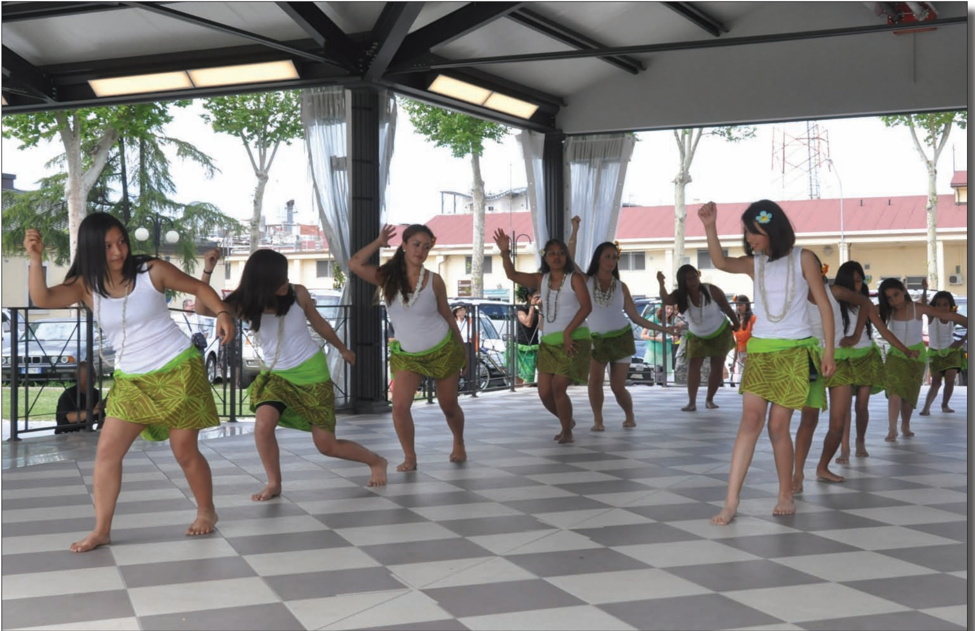
A group of women perform the Tahitian Dance. The dancers tell a story through the use of hand gestures. This dance was one of the dances features during Caserma Ederle's Asian-Pacific Islander Heritage Month Celebration at the Hoekstra Field Pavilion May 24.