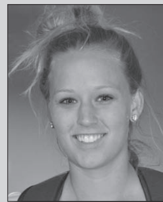
Sella Pauling VHS

What are you most looking forward to this summer?