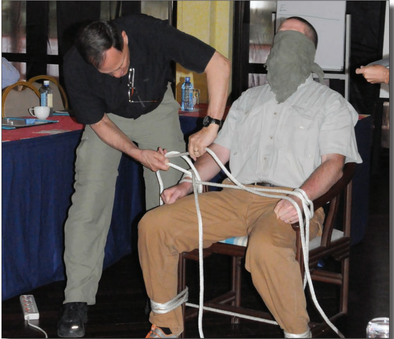
Members of the Anti Terrorism/Force Protection Level II class take part in an exercise to better prepare them for a possible abduction or hostage situation.

Training consisted of students from different areas of operation and job fields from all over the continent. Personnel who have had years of experience in AT/FP traded ideas and shared their experiences with those whose only experience with AT/FP was the required