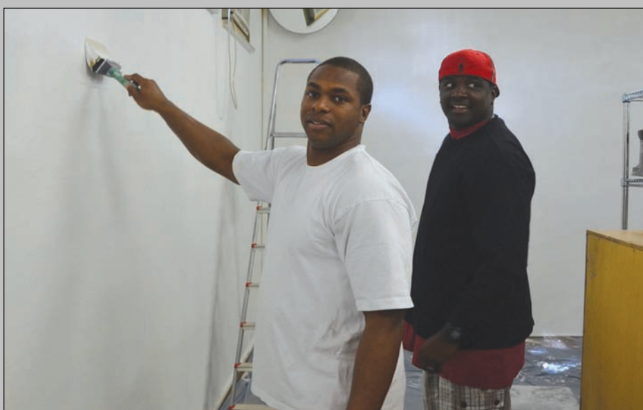
Above and below, 839th Trans. Bn. Soldiers help give the thrift shop a facelift.