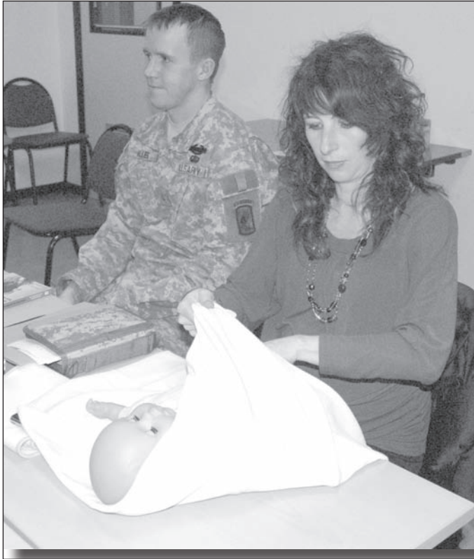
A soon-to-be new mother learns swaddling technique during the class at Army Community Center.