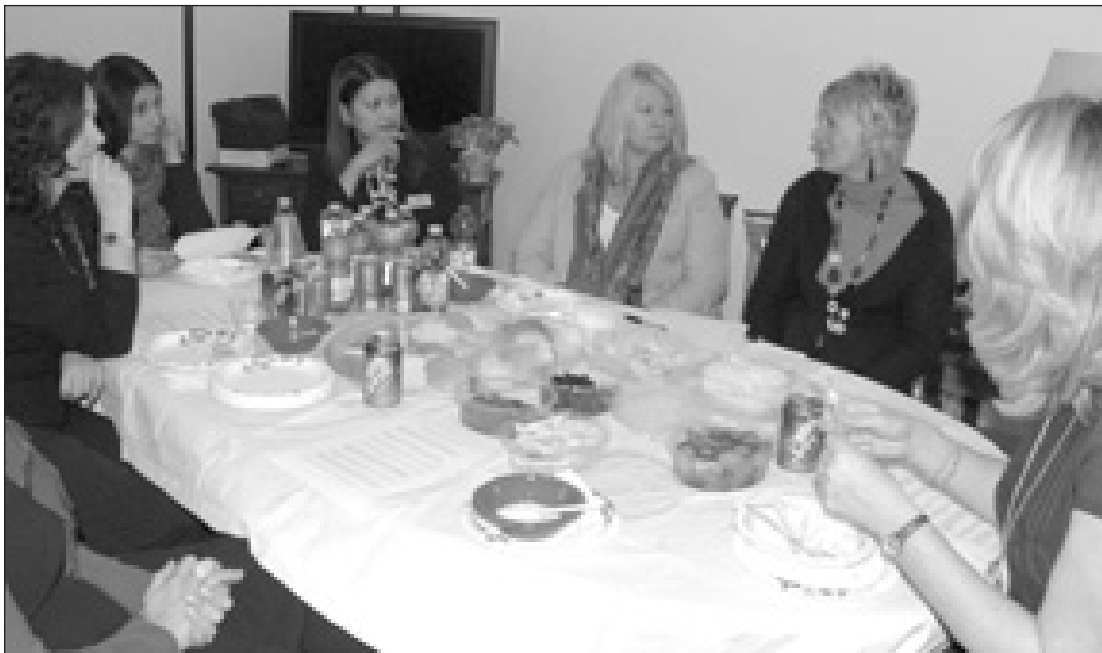
Local survivor spouses gather at a Survivor Outreach Services support group Dec. 15.