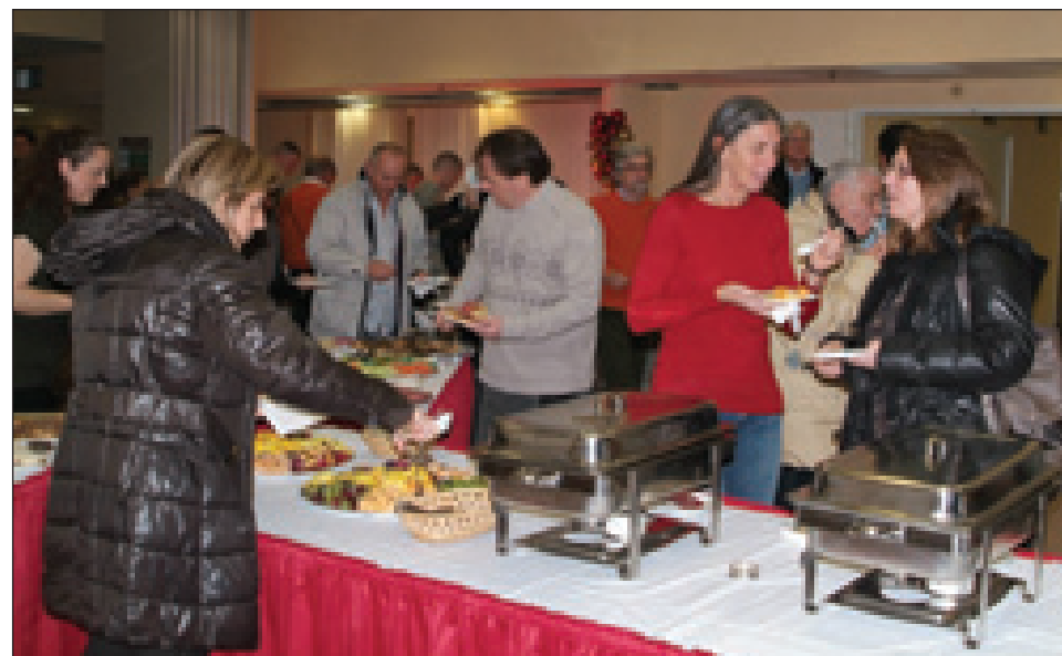
USAG Livorno employees gather together to exchange holiday greetings Dec. 16 at the DCC. See more photos from both event at www.flickr.com/photos/campdarby .