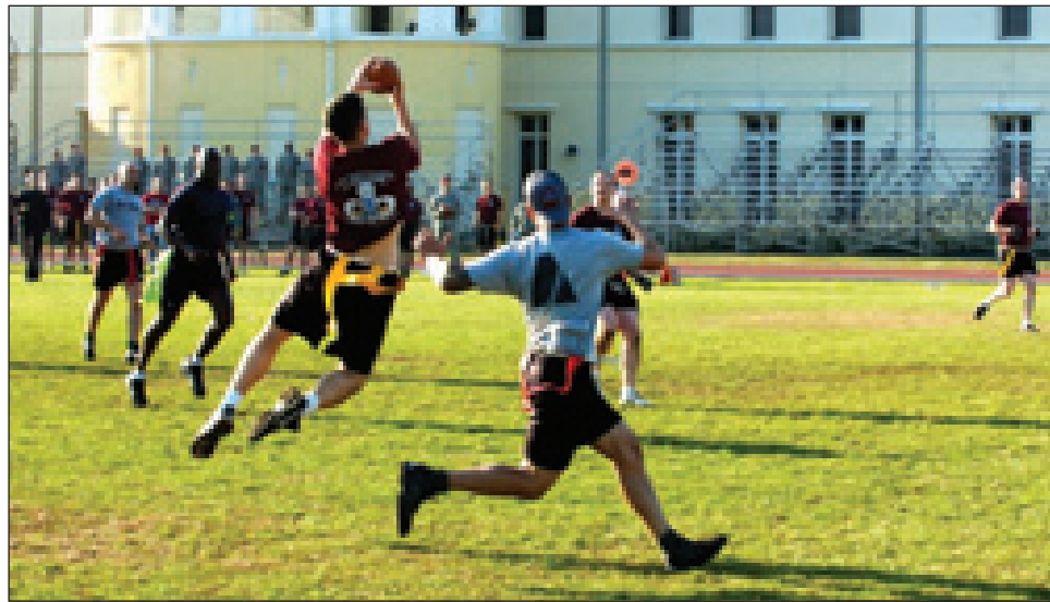
An officer from 1st Battalion, 503rd Infantry Regiment, 173rd Airborne Brigade Combat Team catches a pass during 1st Battalion's Turkey Bowl, Nov. 23. The Turkey Bowl is an annual football game pitting the officers against the NCOs of 1st Bn. and this year the NCOs won again, 20-6

"I'm glad that the Soldiers, NCOs and officers that weren't playing ... brought their families or significant others and