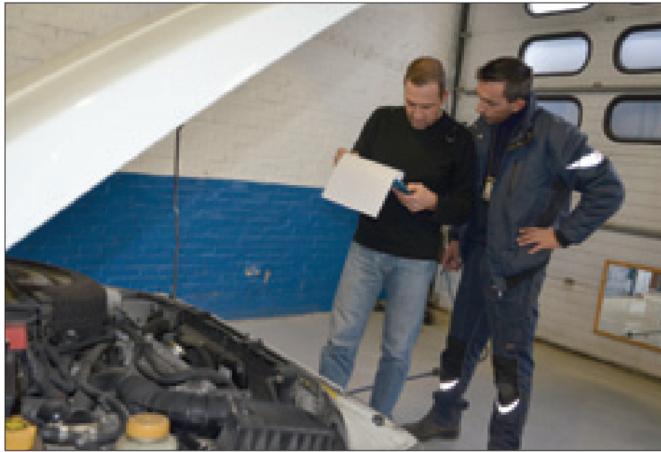
Camp Darby employees perform a pre-winter vehicle safety check as part of the annual emphasis for the community.

Eaton also said winter driving endorsements were provided, Fatal Vision events were offered to simulate drinking and driving and pedestrian situations as were free vehicle winterization inspections.