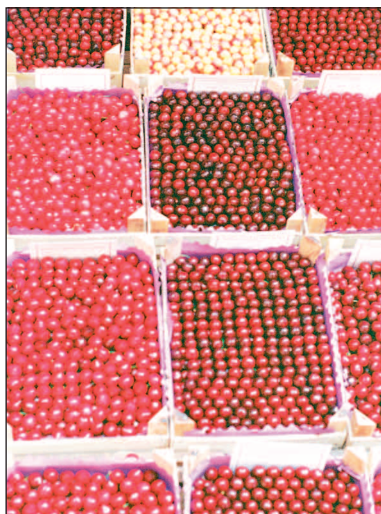
Cherries on display during a past cherry festival. Currently the area around Maser can count on an annual production of about 1.5 million pounds of cherries. This fruit was cultivated in this area since the period of Ancient Rome and used in banquets during the Renaissance.

For more information, visit the Web site at www.villadimaser.it in English.