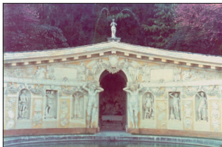
The Ninfeo , or Nimphaeum , sits behind the villa. The four giants (two of them visible in the picture) are attributed to Marcantonio Barbaro , one of the two brothers who commissioned the villa. In the niches are statues portraying divinities created by pupils of Alessandro Vittoria , a sculptor who also created numerous stuccos inside the villa and in the nearby circular church.

The nymphaeum consists of a decorated exedra, semicircular stone