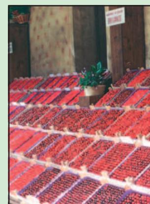
Cherries at the Castello Inferiore , lower castle, in a past event in Marostica.

Chiampo 45th Mostra Provinciale delle Ciliegie June 17-18