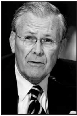
Defense Secretary Donald Rumsfeld told Capitol Hill lawmakers that cuts in the funding requested to continue progress in the terror war could cost U.S. taxpayers more in the long run and delay the time when U.S. troops can return home.

"It reflects the appreciation and the support for the service that has been manifested by this committee and by the Congress and the people you represent," he told the subcommittee members. "So I thank you for your support in this complex and difficult struggle."