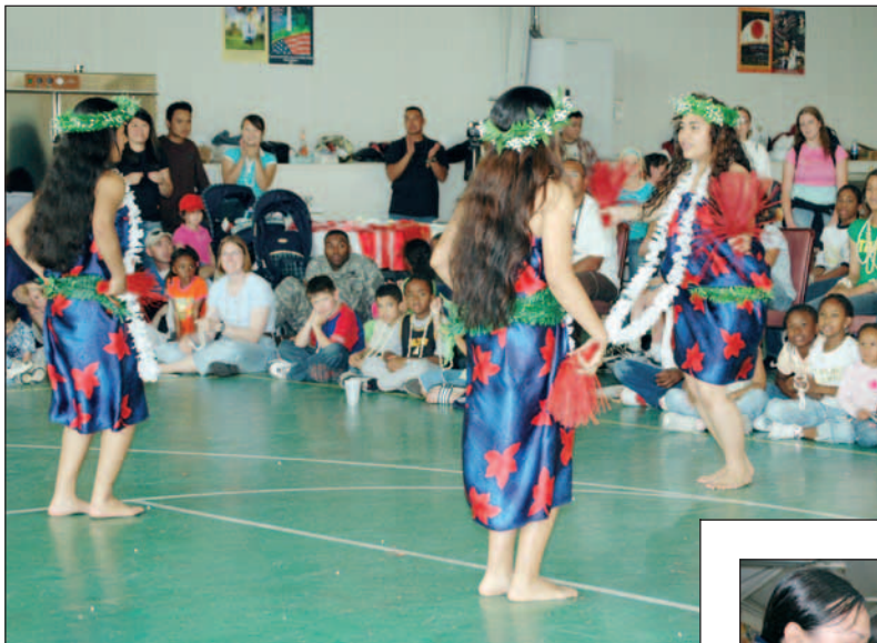
Dancers perform the Fast Tahitian , the last dance performed by the group. At the end of the dance they also invited community members to perform the same dance together.