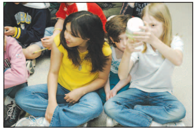
Students examine the teeth of a former patient of Houston. The teeth were brought in as an example of what can happen to those who neglect dental hygiene.

Houston spoke to the eager students about the new methods of brushing, flossing and warned them about the worst kind of