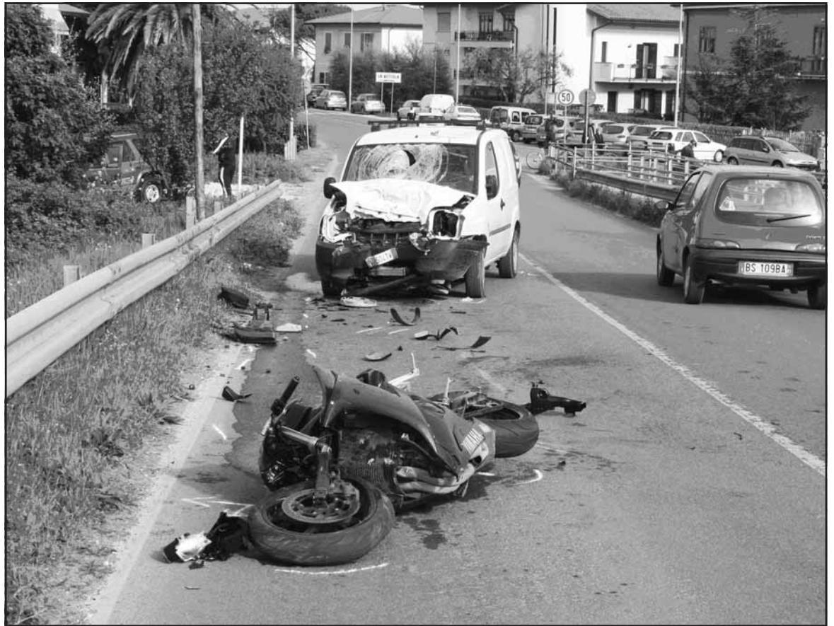
The accident in this photo occurred in April outside of Camp Darby when the servicemember, an experienced motorcyclist, attempted to pass at high speed with oncoming traffic. He was killed on impact.

Classroom dates are scheduled for (Mondays): May 22, June 12, and June 26 starting at 3:30 p.m. in the Golden Lion. Range dates