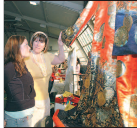
A volunteer shows one of the kimonos on display at the pavilion to a family member. This traditional Japanese dress is very valuable, and it is used by girls when they turn 18. Left: A participant introduces some Tahitian dances during the program.