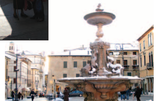
Above: View of Piazza Garibaldi with the central fountain created in 1898 by Carlo Spazzi. On the southern side of the square is located San Francesco , a Romanesque-gothic style church built in 1287. The cloister next to the church has been partially rebuilt after WWII, and is the entrance of the Museo Civico , one of the oldest museums in the Veneto region, renowned for paintings of the 16th century and some works by Antonio Canova, famous sculptor of the late 1700s.