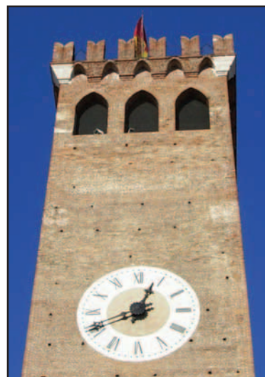
Left: View of Piazza Liberta' , one of the three squares in downtown Bassano from the Torre Granda , big tower, (pictured above) located in Piazza Garibaldi . The tower was built in the 1300s and restored a few years ago. It is open to the public.