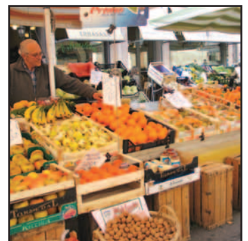
Far up: View of a tower in the area of the Castello Superiore , the upper castle, which was the first walled area of the city since probably the 10th century. In the background, the bell tower of the Duomo , which was built on a previous tower of the 12th century. Above and left: Stands of the weekly market that takes place in downtown Bassano twice a week on Thursdays and Saturdays.