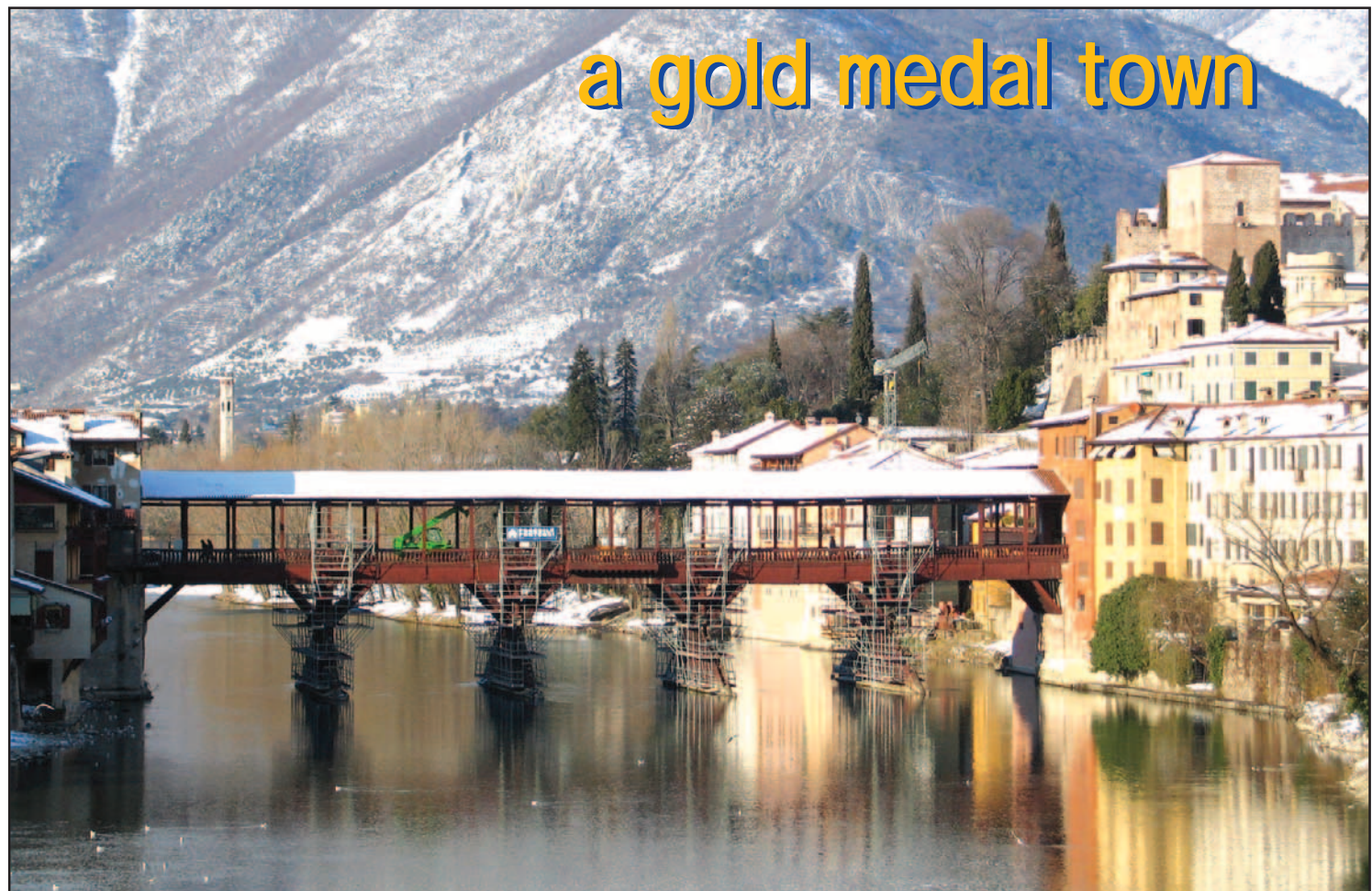
View of the Ponte Vecchio or degli Alpini covered with snow. The first document mentioning a bridge on the Brenta River dates 1209

Bassano was once again a war zone. Due to the strong defense, the support of the city, and the tragic events that occurred in the last period of the conflict, in 1946, Bassano was awarded the “Gold Medal for Military Value.” Honoring “all the sacrifices