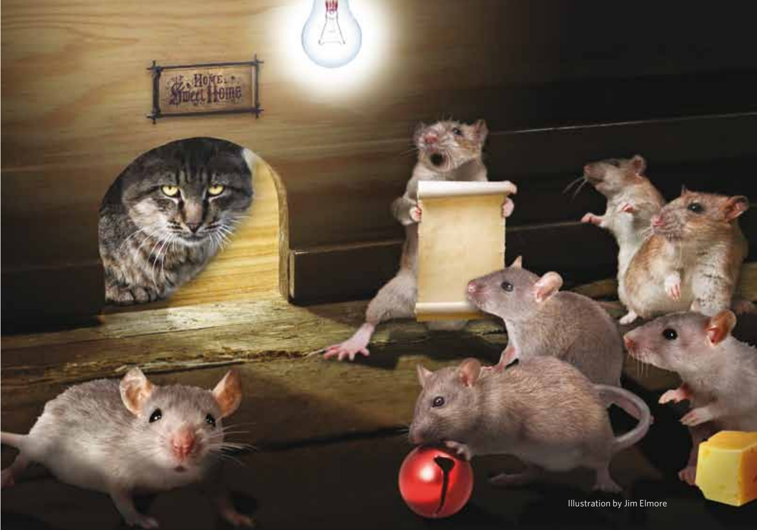
Illustration by Jim Elmore