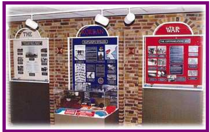
The Korean War Exhibit (at right)