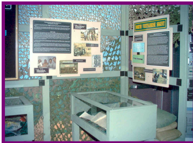
The Vietnam War Exhibit (at left)