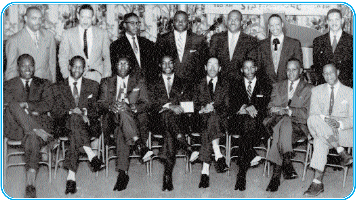
Leaders of AFSA-213, ca. 1951.

you would get an idea of what was going on. If something was completely irrelevant, we would throw it away, but I explained to people that they had to be very careful to give the analysts all the messages we possibly can, because the work was important. . . . Most of the people I worked with were younger than I, and I felt an obligation to be as good as I could be to help them to be good. 55