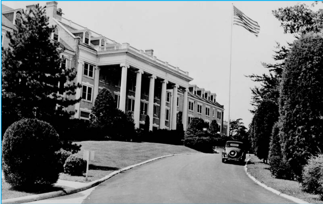
Front view of Arlington Hall Station headquarters building

and all the windows were open. Novella was one of those people singing all of the time – singing and working on the machines. It was just a different environment. 63