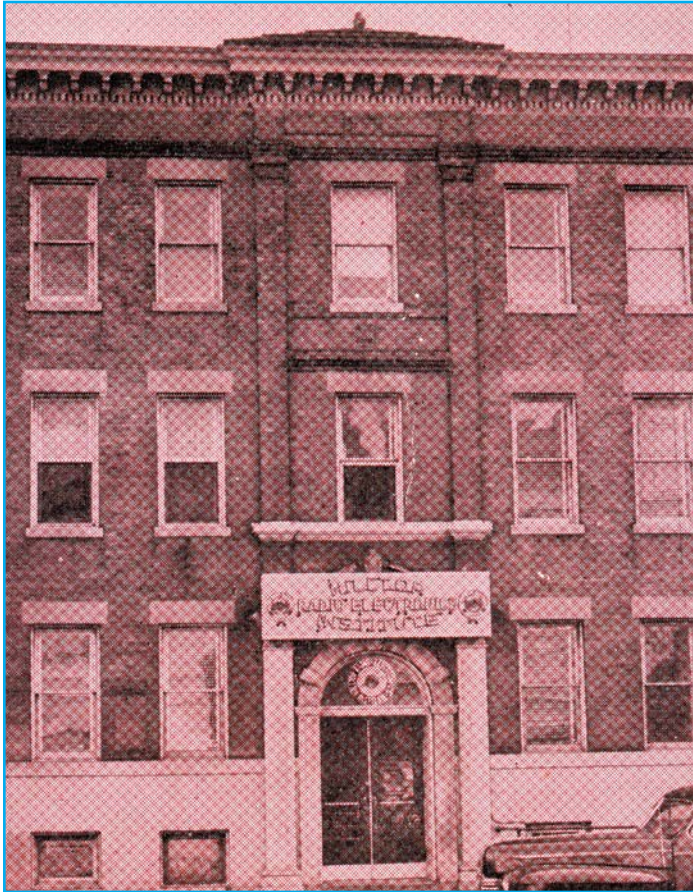
Hilltop Radio-Electronics Institute