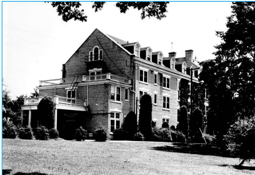
Garden in rear of Arlington Hall Station headquarters building