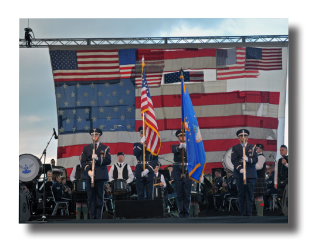
The WPAFB Honor Guard proudly displays our colors as part of the 2011 Freedom's Call Tattoo festivities. Download High

Additionally, special guest performer, singer-songwriter and double-platinum recording artist Eddie Money will take the stage after the Band of Flight.