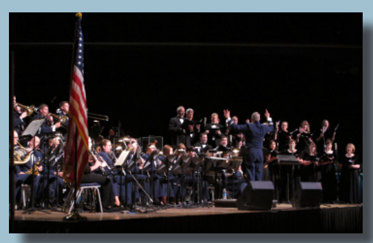
The Band of Flight joined forces with Musica! for its recent guest artist feature. Download High-Res

The second half highlighted soloists from Musica! with selections by Aaron Copland and Gilbert & Sullivan with the Concert Band. Not a single person remained in their seats as the two groups combined for the definitive patriotic closer, Battle Hymn of the Republic. This concert was indeed a treat and showcased the artistic talent in the Miami Valley!