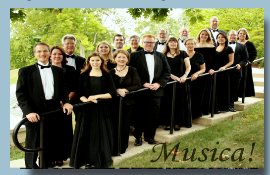
Musica! a Dayton based Choral Ensemble was the featured guest artist with the Air Force Band of Flight. Download High-Res