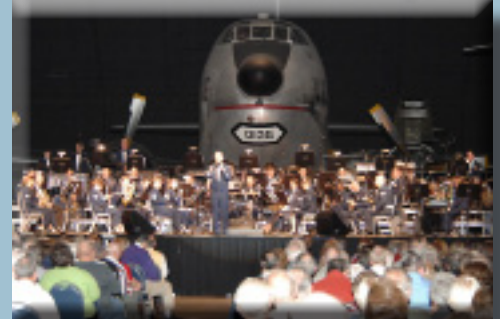
The Band of Flight concert band performs at the National Museum of the United States Air Force. Download High-Res

On February 12, 2011, at 7:30pm, the Air Force Band of Flight will present its annual "Hearts, Heroes and Heritage" concert, featuring the Concert Band, at the National Museum of the U.S. Air Force. This free concert will simultaneously pay tribute to our country's heroes, while also celebrating African-American History Month and Valentine's Day. This year there will be two additional opportunities to hear this program: February 9, 2011, at 7pm in Brookville, Indiana, at Franklin County High School and February 10, 2011, at 7:30pm in Marysville, Ohio, at Marysville High School. We hope to see you there!