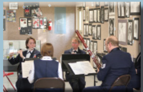
Huffman Prairie Winds woodwind quintet performs at the Preble County Fine Arts Center in Eaton, Ohio. Download High-Res

In March, 2011, four of the Band of Flight's small groups will be touring for the purposes of educational outreach and recruiting. The Systems Go rock group will be performing in the local area, focusing on recruiting in the schools. The Huffman Prairie Winds woodwind quintet will reach the states of Indiana and Kentucky, while the Night Hawk jazz ensemble will be utilized for recruiting purposes for the first time ever, visiting schools in Ohio. Wright Brass, who played for the Kentucky Music Educators Association earlier this month, will present clinics and perform at three universities and a high school in Indiana.