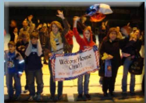
Families welcome home deployed members of New Harmony. Download High-Res