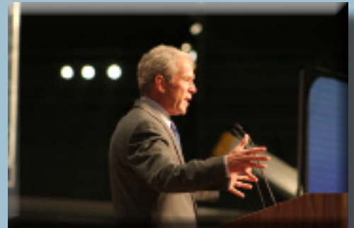
Former President George W. Bush speaks at the National Museum of the United States Air Force. Download High-Res

On Veteran's Day, 2010, the Air Force Band of Flight had the distinct honor of playing for former President George W. Bush, who was speaking at the National Museum of the U.S. Air Force. His visit honored veterans and their families, and was tied to the recent release of his memoir, "Decision Points." Prior to Mr. Bush's speech, the band performed for an audience of 1,500 in a 30-minute concert that included vocalists and a patriotic sing-a-long. Also, Systems Go combo played background music for a reception that evening, and was able to meet Mr. Bush.