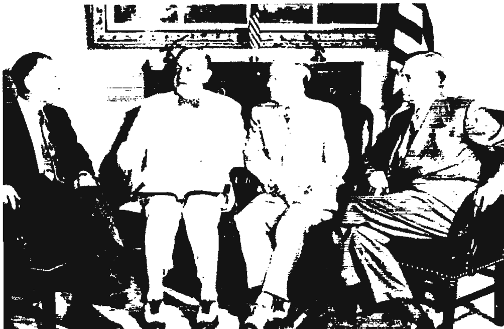
The Johnson Team

Thus, the atmosphere for cooperation and consolidation was volatile. However, by the time the vote on the AFSA merger took place, Johnson had appointed a new Secretary of the Navy, Francis P. Matthews, whom he had selected personally. 29 Matthews supported Johnson's position. As for the Air Force, Vandenberg, as Air Force Chief of Staff, had consistently and actively promoted the growth of the Air Force as an independent service. In addition to the commitment for an independent cryptologic arm for the Air Force, it is also likely that Vandenberg envisaged receiving greater financial support for aircraft programs if he went along with consolidation in other areas such as the merger of cryptologic activities.