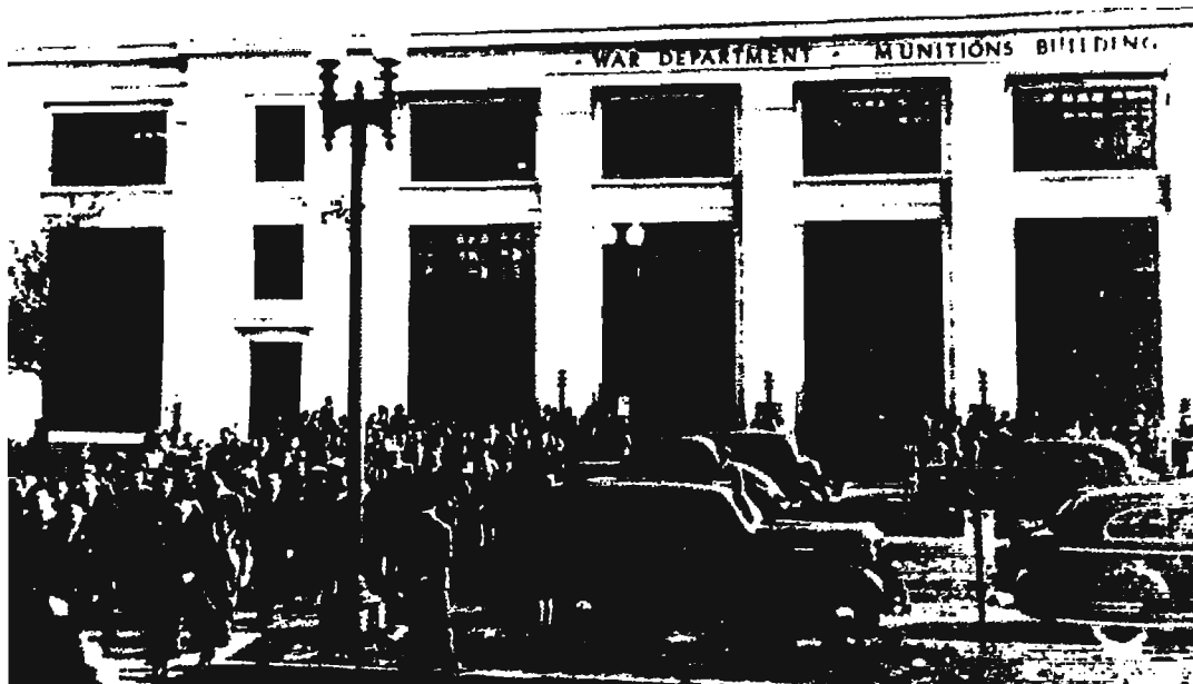
War Department Munitions Building

Leaving nothing to chance in their advance preparations, Army and Navy officials held a number of closed meetings prior to the meeting of the full committee. They sought primarily to resolve their long-standing disagreement on coverage of diplomatic targets. Five days before their meeting with the FBI, the Army and Navy succeeded in reaching an agreement on the division of COMINT responsibilities between their organizations. 21 The solution, urgently promoted backstage, resolved the nagging question of how to allocate service responsibility for diplomatic traffic. At the Navy's request, on 25 June 1942 the Army-Navy participants agreed to transfer the entire diplomatic problem to the Army for the duration of the war.