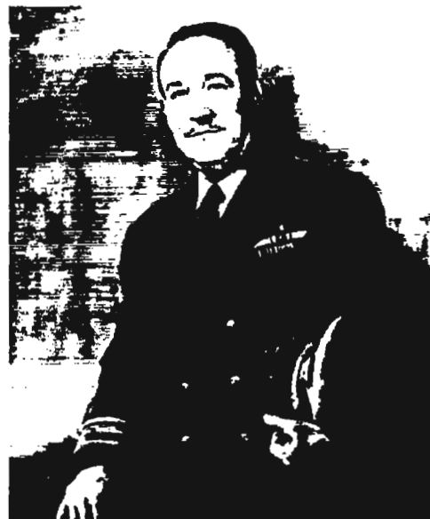
Admiral Sidney W. Souers Executive Secretary, NSC