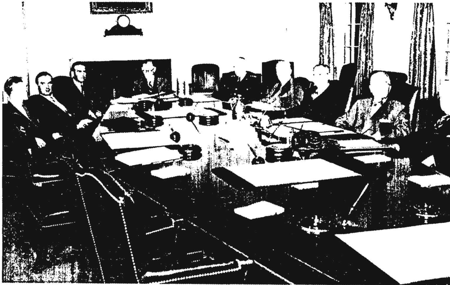
Meeting of the National Security Council, January 1951