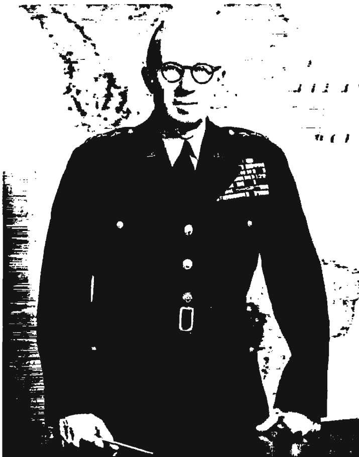
Major General Ralph J. Canine

take issue with some aspects of the report. The committee had proposed an extension of the responsibilities of AFSA to include a communications security responsibility for the entire United States government rather than merely the Department of Defense, as was then the case. Canine agreed in principle with the proposal but pointed out that the committee had included very little on communications security in its report. He recommended that the proposed directive be confined to COMINT, with communications security to be made the subject of another study and to be addressed in a separate directive. Canine also argued strongly against retention of the rule of unanimity - even for COMINT matters outside the jurisdiction of AFSA. He pointed out that this would only serve to perpetuate one of the chief difficulties that had hampered USCIB in the past. He urged the acceptance of a majority-rule principle to govern all USCIB decisions. Lastly, Canine pointed out that the Brownell Report had omitted the generally accepted