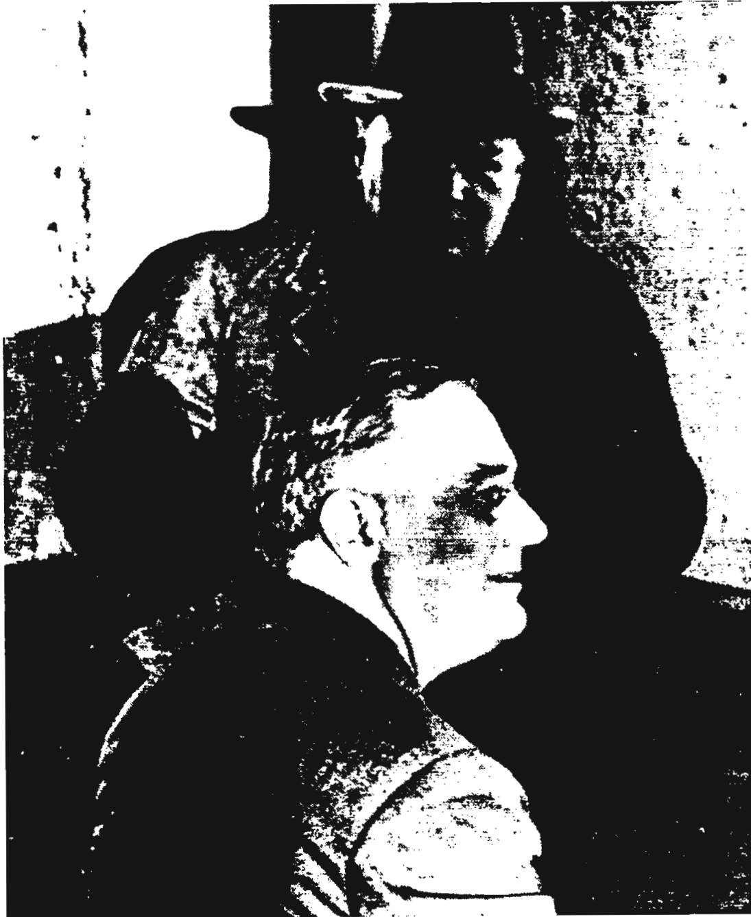
Franklin D. Roosevelt and Winston Churchill established a direct channel of personal communications in 1940, reinforcing strong ties between the United States and Great Britain.