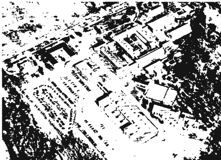
Aerial view of Navy Headquarters at Nebraska Avenue, March 1949