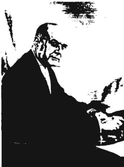
Louis A. Johnson, Secretary of Defense

Over the next three years the Air Force, as an independent service, had a major impact on the Army-Navy COMINT organizations. The establishment of the AFSS indicated that Air Force officials demanded a security service or cryptologic organization equal to the Army or the Navy COMINT structures. Competition for COMINT targets and resources intensified. Moreover, the three services now competed for recruitment of personnel to augment (or replace) the dwindling military competence in COMINT.