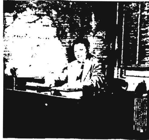
Dr. Solomon Kullback Chief, Research and Development Monitor Group