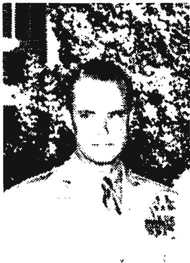
Lieutenant General Hoyt S. Vandenberg STANCIB Chairman

The COMINT organizations would coordinate their activities but would remain totally independent organizations. In addition to the integration of Army-Navy personnel on certain analytic problems, STANCIB divided the Army-Navy responsibility for military and naval targets along the traditional lines and identified the diplomatic and commercial communications as a "joint" responsibility, to be placed under the direction of the new Coordinator of Joint Operations. To implement this new concept of Army and Navy cooperation, STANCIB directed the Chiefs of ASA (Army Security Agency) and OP-20-G to draw up the details of a plan and statements of general principles governing the roles and responsibilities of the services and the Coordinator of Joint Operations. 23