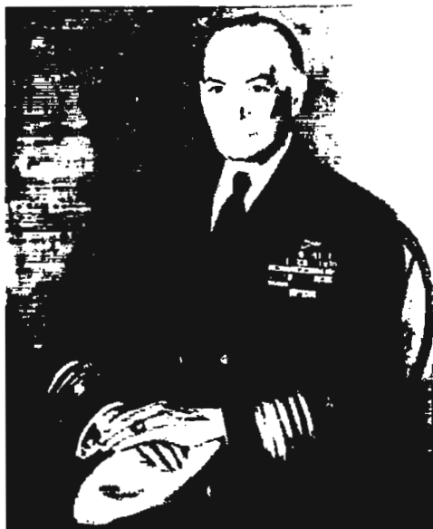
Admiral Roscoe H. Hillenkoetter Director of Central Intelligence