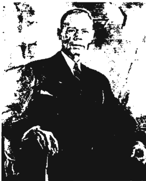
General Walter Bedell Smith, DCI