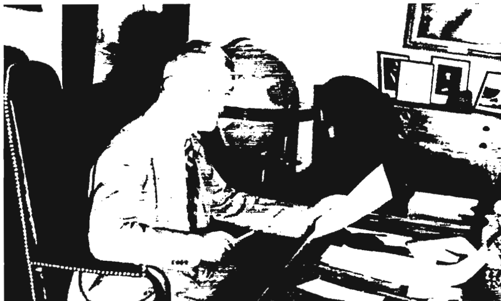
James V. Forrestal, First Secretary of Defense, 1947-1949