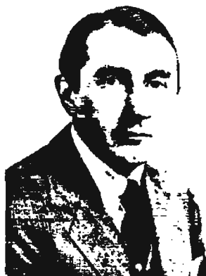
William H. Jackson