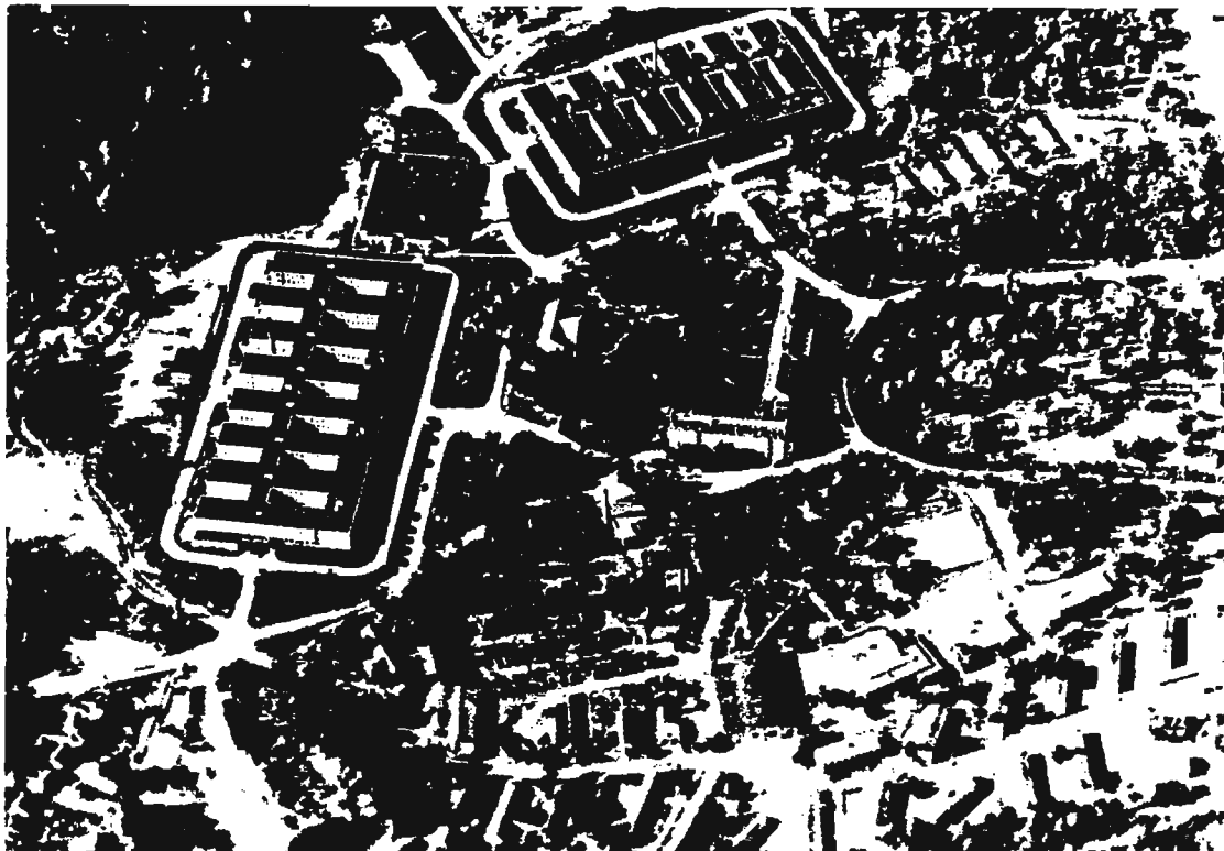
Aerial view of Arlington Hall Station

Coincidental with the negotiations over the allocation of cryptanalytic targets and in anticipation of new and greatly expanded operational missions, each service initiated search actions for the acquisition of new sites to house their already overcrowded facilities. Within one year, the services accomplished major relocations and expansions of their operations facilities within the Washington, D.C., area.