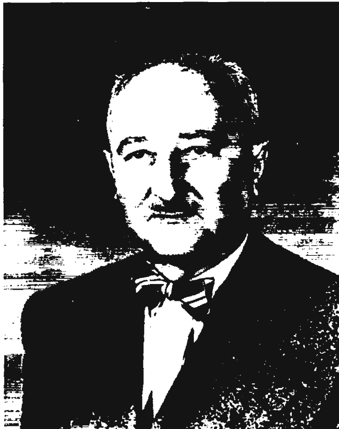
William F. Friedman

The stated fundamental objective of the CONSIDO consolidation plan was to improve Department of Defense intelligence and contribute to "efficiency and economy." With the establishment of CONSIDO, the COMINT exploitation units of all other departments were to be abolished. CONSIDO was to provide integrated intelligence estimates on all available COMINT and was to reflect the joint view of all intelligence agencies. 4 General Joseph T. McNarney, special assistant to the Secretary of Defense, became an enthusiastic supporter