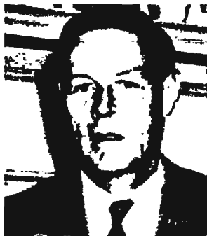
Charles E. ("Chip") Bohlen