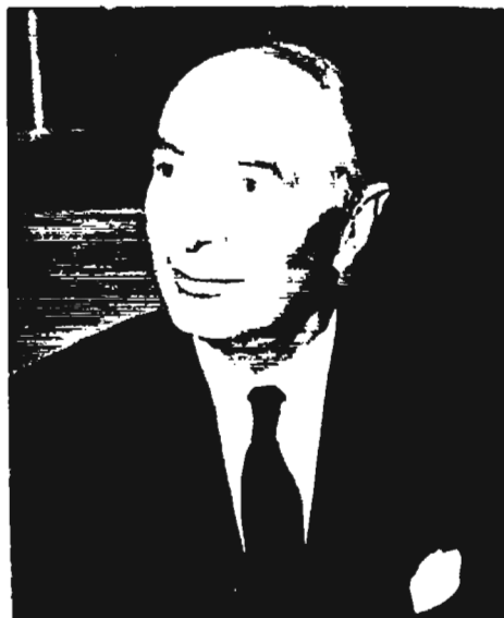
Robert Lovett, Secretary of Defense

With Lovett's memorandum, Canine acquired a new relationship with the military services and their COMINT activities. Theoretically, he now had control over all COMINT collection and production resources. Canine started a four-year term of office as the director of NSA on 4 November 1952. In accordance with its new charter, he received a third star. Each of the services assigned one or two two-star grade officers to the new agency. This change was consistent with Truman's decision to elevate the status of the unified agency. The reorganization of AFSA removed the COMINT structure from exclusive military control and theoretically gave all intelligence agencies, military and civilian, an equal voice in the COMINT processing and requirements process.