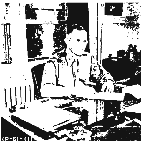
Colonel W. Preston Corderman, USA