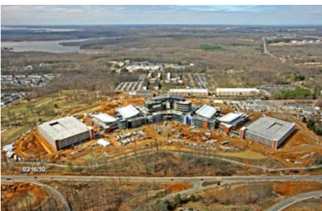
SAMMC-N Consolidated Tower March 29