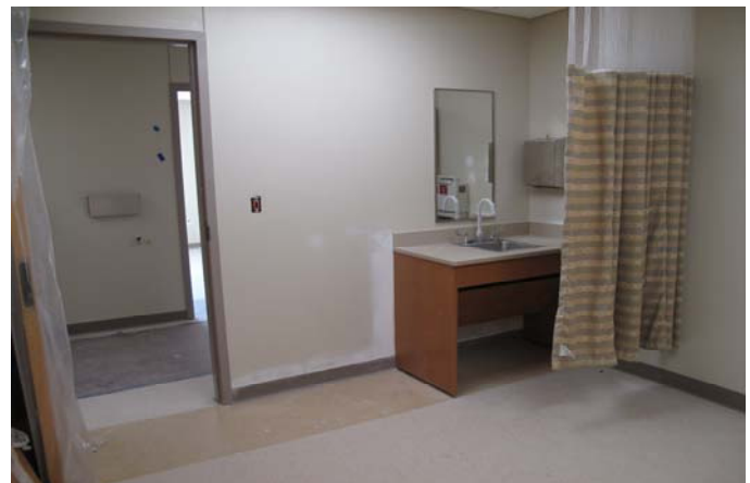
Mock-Up Room at the National Naval Medical Center

The mock-up of the patient room on the third floor of Building B is being overhauled. The nurse call system and connections for medical air and oxygen are in place.