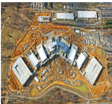
SAMMC-N Consolidated Tower, Jan 10