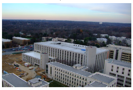
Consolidated Tower, 28 Apr 10