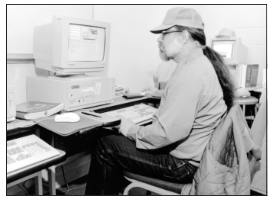
An inmate at Airway Heights Corrections Center works on aggregating information sent electronically to the prison from the seven Ex-O job placement contractors for inclusion in the Corrections Clearinghouse's MIS.

CCH brokers a number of services—that is, it acts as the agent for other groups to establish collaborative ventures. CCH staff telephone high-level administrators of two or more groups to explain that they have a common problem they can probably solve if they will meet together. CCH staff arrange a meeting among the groups and sometimes provide several hundred dollars in one-time travel expenses so they can begin working together. CCH staff may or may not attend or facilitate these meetings. The