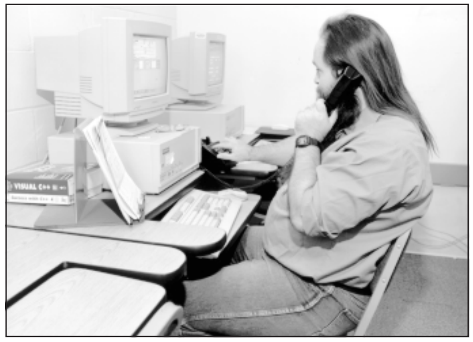
An inmate at Airway Heights Corrections Center talks with a service provider to update information in the Corrections Clearinghouse's Case Management Resource Directory about the organization's current services, eligibility requirements, and fees.

Six or seven of us go out in a group and work at least in pairs—for example, laying down plastic on floors. Since it requires teamwork, we learn to compromise. When I get out [of prison], I can show I have experience in the field. Besides, instead of watching TV or sitting in dull classes or my cell, I'm doing something interesting. My attitude changed—I do less arguing, I get along better with people.